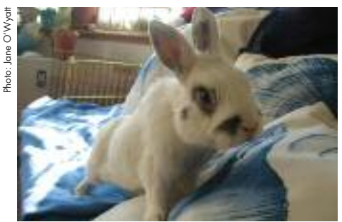
After Ramsey died very suddenly at home, his adopter had his vet do a necropsy.

If you decide to euthanize, vet offices have different protocols. While no one likes to talk about this subject, it may be a good idea to ask how your veterinarian does things. Hopefully it includes a preanesthetic, which is a tranquilizer that will help your pet relax and relieve all of the pain. This is followed with the euthanasia solution, administered when both pet and owner are ready. You will be asked if you want to be present for this procedure.