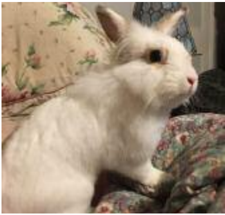
Princess Penelope Godiva.