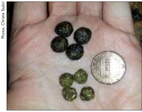
Normal fecal pellets.

Anyone who lives with a bunny has seen a fecal pellet. These are the small, brown