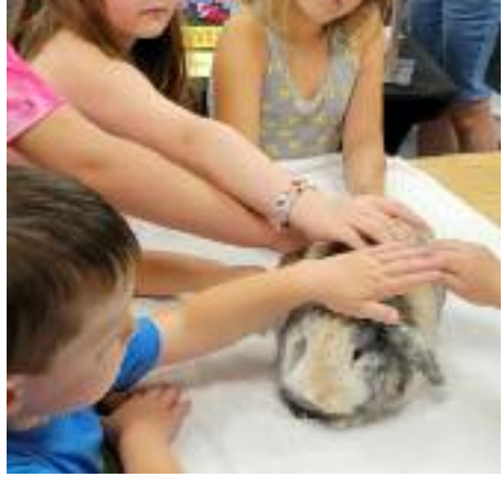
So many gentle hands petting me at Oyster Bay-East Norwich Public Library.