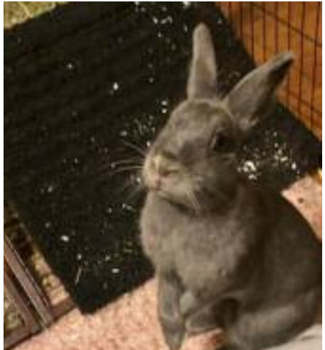
Tara, all grown up.

hormones were raging! I was not the nicest bun. I would nip and growl at my foster mom. One time I even bit her when she was trying to feed me. Luckily, I have calmed down now, and don't do those things anymore.