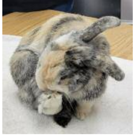
Quick timeout for cleaning at Oyster Bay-East Norwich Public Library.