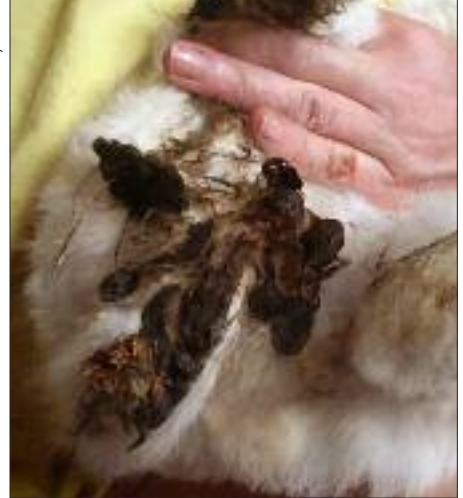
This rabbit needed a wet butt bath.

Resolving runny stool in a rabbit is not always a simple matter. It may require dietary changes, good husbandry, and sometimes extensive diagnostic work and treatment by your veterinarian. But it will all be worth it for a long life filled with happy, nose-wiggling love and a nice, clean bum.