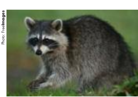
Raccoons harbor deadly roundworms.

Leaves can harbor fleas and ticks. Perhaps the most deadly parasite is raccoon roundworm: Rabbits who ingest leaves