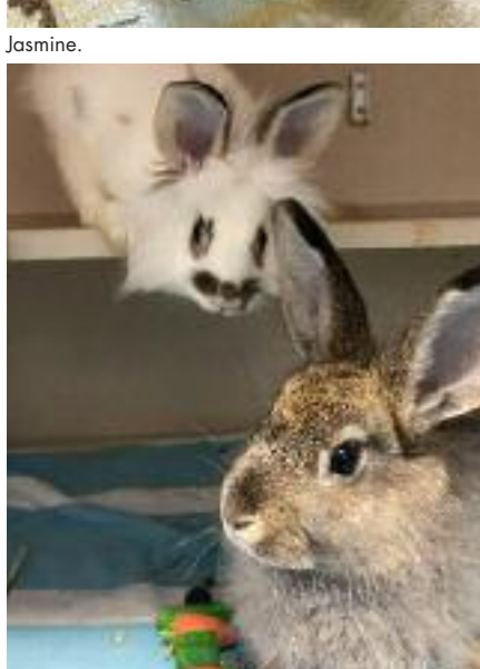
Polar Bear and Brown Bear.