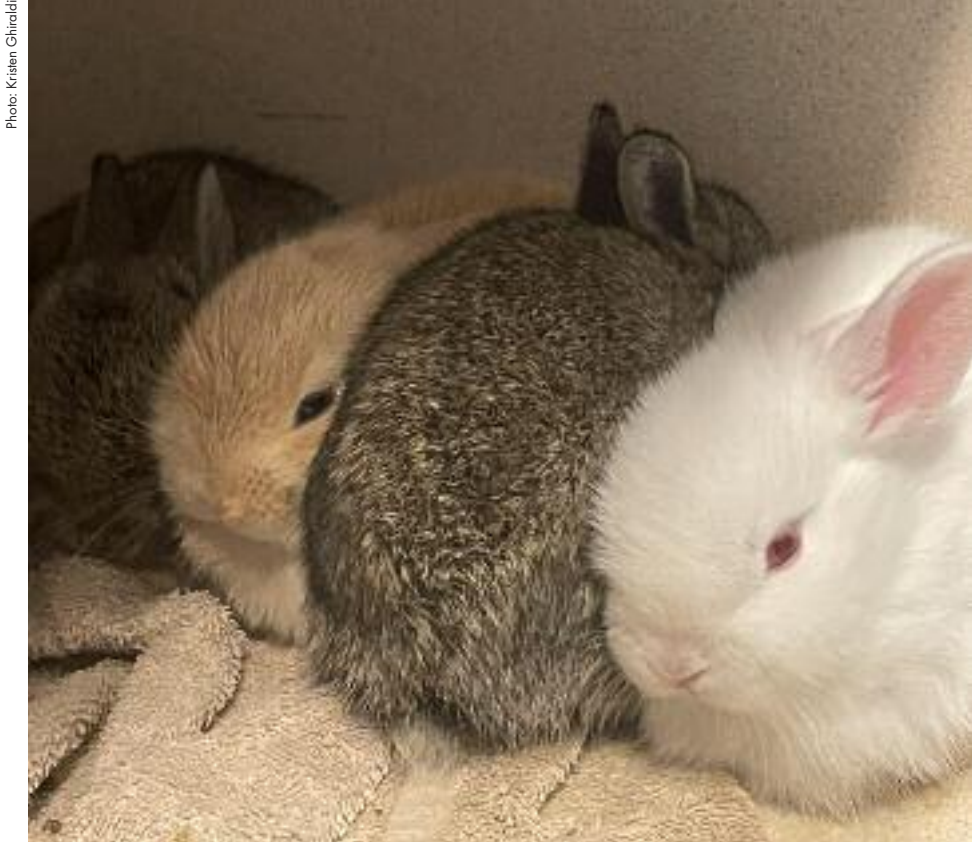
Swirl's Babies: Swoosh, Twirl, Whirl, Swish.

If interested in volunteering for Rabbit Rescue & Rehab, please email nyc.metro.rabbits@gmail.com.