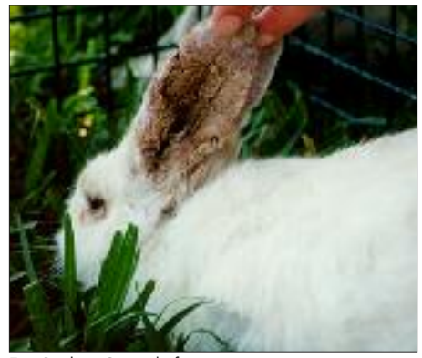
Ear Canker: Gypsy before treatment.

Psoroptes cuniculi is one of the most painful and nasty types of mite infestations your rabbit can suffer. When Gypsy first came to us as an abandoned stray, she had the worst case we'd ever seen: