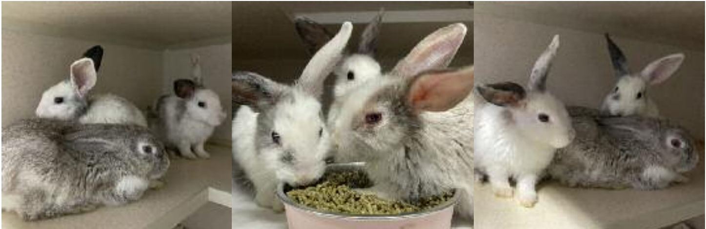
The recently arrived "girl gang" at Manhattan Animal Care Center includes Eyeshadow, Hairspray, Fresh, Floss and Lipgloss.