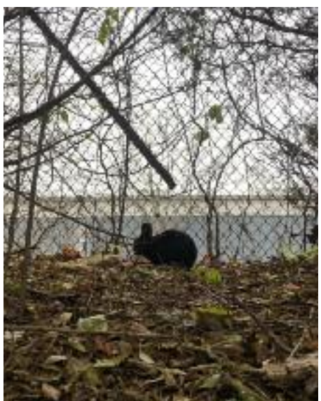
To avoid the rain, the rabbit was huddled under the trees.

Every year, Long Island Rabbit Rescue Group receives hundreds of emails about rabbits found abandoned in neighborhoods, parks, school fields and in much more precarious situations. Naturally, we wish we could save each of these rabbits. However, as a foster-based rescue, our ability to rescue one of these rabbits hinges on having the space to responsibly house them. Rabbits adopted out mean more rabbits can be rescued to fill their spots. Fortunately for the tiny black rabbit noticed by concerned citizens outside the Westbury Target in December, we had several adoptions that week, opening up room for newcomers.