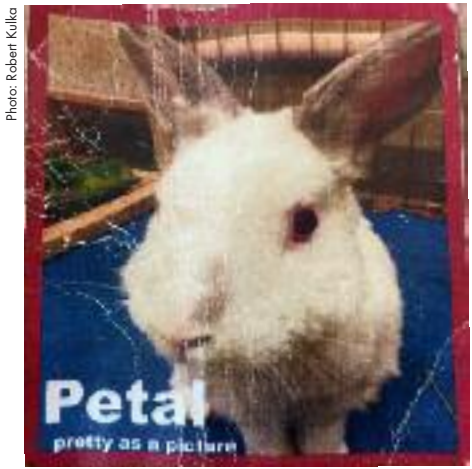
Petal at Petco in 2014.

Robert snapped a photo of Petal to display at the entrance of the store, and added these words: " Petal... pretty as a picture."