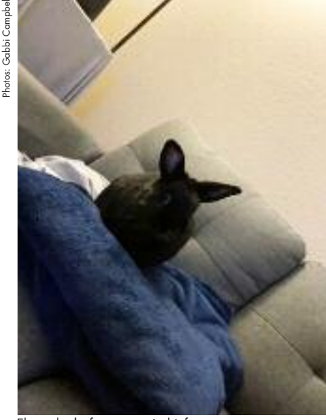
Ebony looks for some mischief.