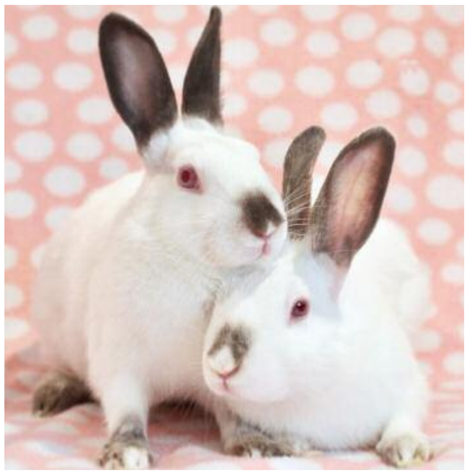
Purple and Blue.

Carmela is a young medium-sized Rex rabbit. Her beautiful coat is mostly white with tan and black spots. She is a sweet rabbit who loves to have her soft