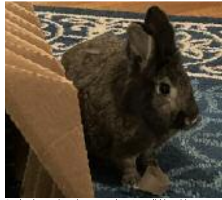
Simba keeps her distance when I smell like chlorine.