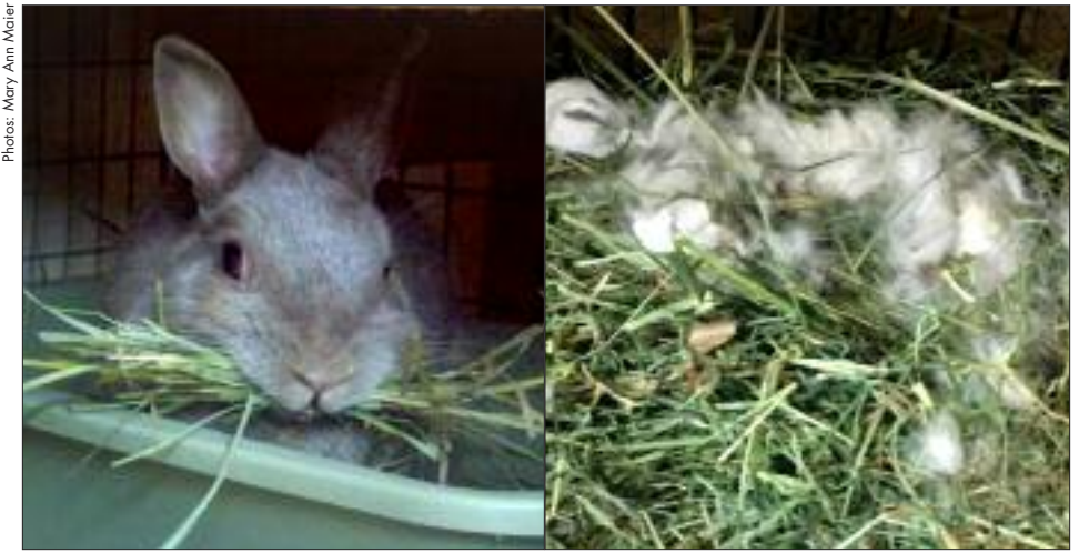
Nest Building: Philomena moves hay from litter box to nest.

The best way to prevent this is to keep your rabbit in a dry habitat, and to