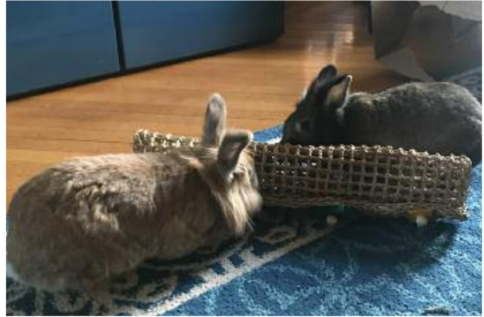
Simba and Nala enjoying a seagrass toy.

A word of caution: if you purchase seagrass mats for your bunny, be sure that they are made of raw, untreated materials. Seagrass is now a popular material for some home goods (like storage baskets) but these options are usually coated in other materials and are not safe for bunnies.