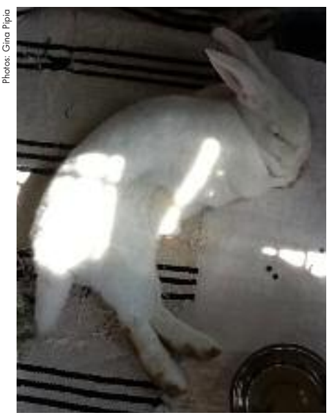
This was the morning after she was rescued. She was content knowing she was safe.

The last week of her life she fought so hard and rallied and declined and rallied again but my girl just couldn't hold on anymore. I had to let her know that it was OK to let go and that I would be OK without her, although I would miss her every single day. I told her that our love was eternal and that we would always be together in some sense. And then with that, I had to help my beautiful girl cross the rainbow bridge. I held her