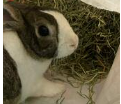
Nibbles loved to eat.

None of this worked. She then stopped eating pellets, which made me think there was an issue with her mouth because she was able to eat the softer foods.