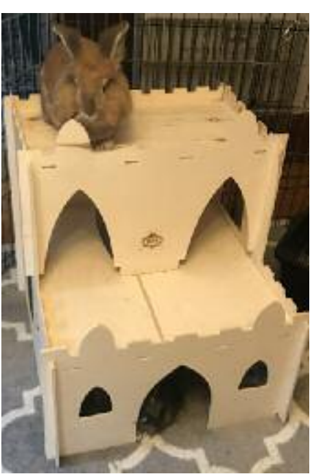
Nala climbs the castle while Simba rests below.

While writing this list, it strikes me that my bunnies have a lot of treasured possessions. I think they are quite important as they help to keep Charlie, Simba and Nala stimulated and entertained while we humans are working and unable to give them the utmost attention they deserve (nay, demand).