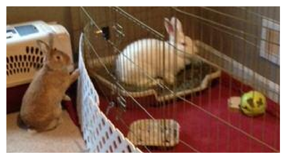
This was the day I took her home to foster and my Butterscotch wanted to welcome her.

On the other side of the trees were the railroad tracks. I knew I couldn't leave her there. I crawled under the trees with a carrot in hand and sure enough this bunny came right to me and started chomping away. We played a little bit of "catch me if you can," but after a while I needed to make the move and grab her before I lost my opportunity to save her. I was very concerned about being so close to train tracks. I finally grabbed her, and she let out a huge scream. I was terrified, as was she. I never heard that sound come from a rabbit (and I NEVER want to hear that again). I got her into the carrier to take her to the rescue so