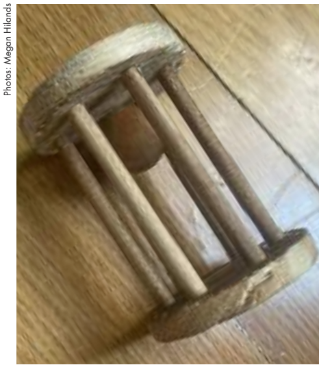
This is just one of the several bunny dumbbells we have.

work out, as you can imagine your bunny is also getting in a few sets along with you. Whether it's the shape, the noise the dumbbell makes when it's picked up, or that Simba just likes to work on her strength – this toy is a big hit.