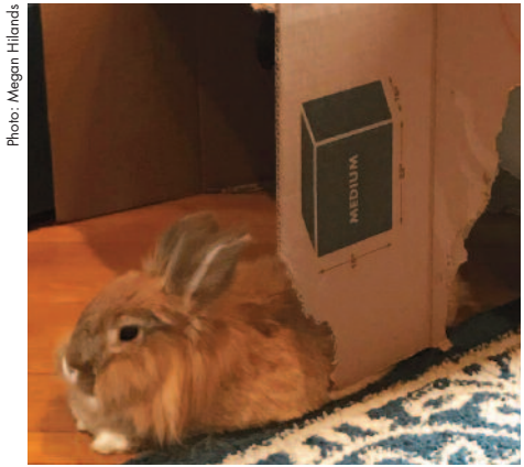
Nala loves to sit in the moving boxes

Nevertheless, there are several toys that stand out as definite winners with my rabbits. These are used almost daily by