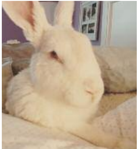
Colleen touched the hearts of those she met.

By Gina Pipia Long Island Rabbit Rescue Group volunteer