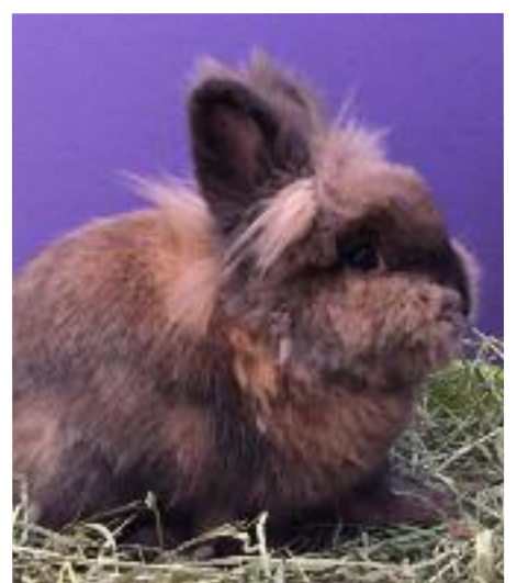
Cute Lil Britches would probably try to bite a stranger who tried to pick her up!

Imagine what the world looks like to this bunny. She's surrounded by a new environment, and there's a big, strangesmelling animal that's always looming over her. She has no idea you're trying to be friendly. Her "hard wiring" tells her: "AAAAAAAAGH!!! It's going to EAT ME!" Imagine yourself in her bunny slippers: No one speaks her language; she has been taken from her family and has no one of her own species to comfort her; and she has no idea whether you