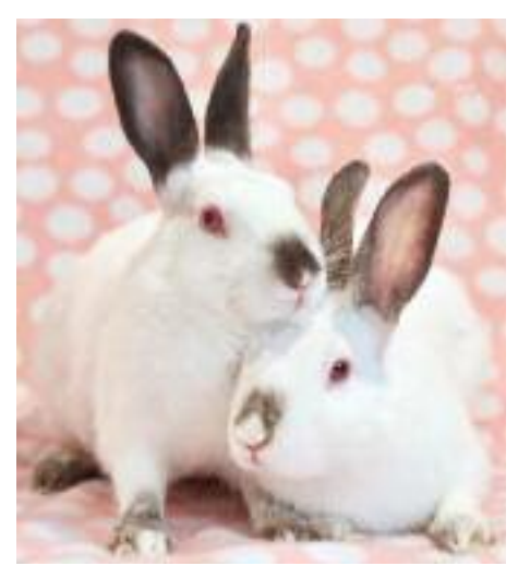
Purple and Blue.

Blue and Purple are a young brother/sister pair of 3.5-pound Himalayan rabbits. Blue is the more outgoing of the two, and enjoys being wherever his people are at all times. He loves having his cheeks rubbed and will happily melt into the floor for long petting sessions. Purple is shyer than her brother, but is never far behind Blue and enjoys occasional head pets from quiet, gentle people whom she trusts to respect her boundaries. Blue and Purple are a wonderful pair who are very affectionate with each other and spend a lot of their down time closely snuggled up together or grooming one another. Blue and Purple are neutered/spayed and living in