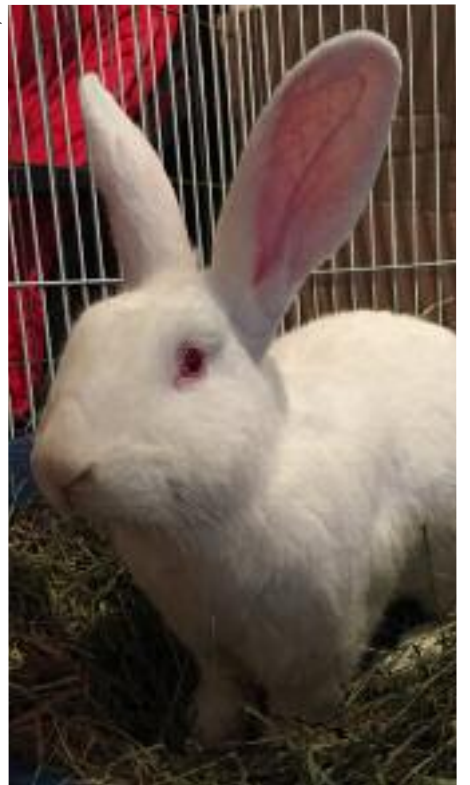
Spooky, who weighs 9 pounds, presents less of a temptation to people who might want to grab and pick up a bunny.

knowing that his safety and well-being depend on your playing with him on his own terms.