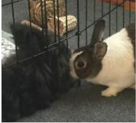
The black bunny with Nibbles is her buddy Chewy.

I brought Nibbles to the vet, who could not believe it was the same rabbit that she had just seen two months earlier. She was concerned about Nibbles' sudden weight loss and after some blood work and X-rays, it looked as if her teeth might indeed be the issue. The front incisors were a little overgrown and there were some teeth on the left side that were ground down to the gum line and looked infected. The doctor trimmed the front teeth but said she wasn't sure if that would help. She said that she had seen rabbits with much