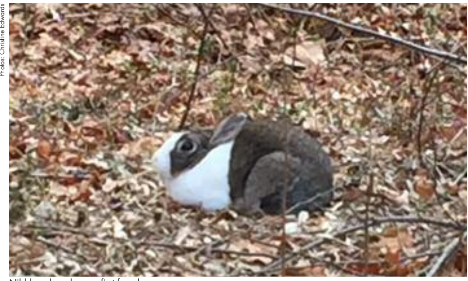
Nibbles when she was first found.

One day, out of the blue, Nibbles stopped eating hay. This was very concerning given her love of food. She still ate her pellets, bananas, greens and treats. I thought maybe the hay was the issue, so I tried many different brands and cuts of hay as well as grasses and sprinkled herbal medleys to encourage foraging.