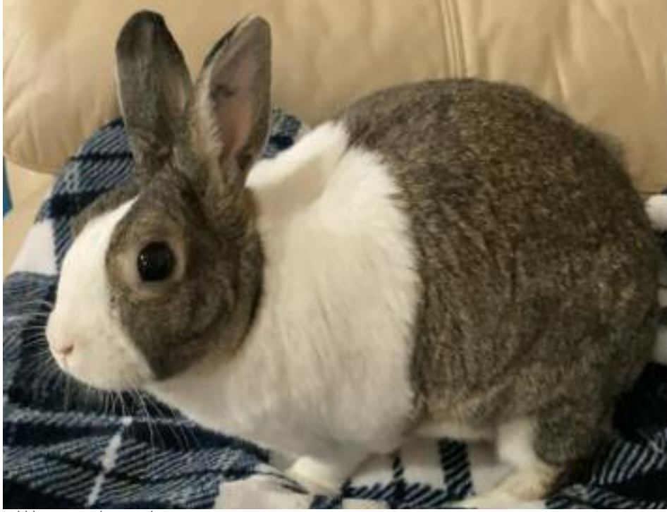
Nibbles waits to be petted

I had another vet appointment set up to discuss our plans going forward. However, a week before the appointment, I noticed that Nibbles' front teeth were overgrown so I dropped her off at the vet to get a tooth trimming while I went to work. I received a call from the vet that afternoon saying that Nibbles had a lot of necrotic tissue under her tongue and her jaw was pretty much locked up. It was determined that Nibbles was too far gone and it was time to let her go. I drove to the vet's office to spend my remaining time with her. I knew the end was coming but was not prepared when it actually happened. On Nov. 8, 2021, I said goodbye to Nibbles. I told her she was the best bunny and that I would love her forever. I was with her until the very end, petting her head gently as she went over the rainbow bridge. It was a heartbreaking experience.