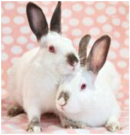
Purple and Blue.

Pineapple and Sugarplum are a beautiful pair of large Lionhead sisters who were born in the shelter as part of a litter of five babies, before we took the whole young family into our rescue. Their mother, two sisters and brother have all been adopted and now it's their turn. Pineapple is black and white, while Sugarplum is all black – and both have amazing manes of hair! These girls are shy at first but have tons of energy and are a joy to watch as they exercise –