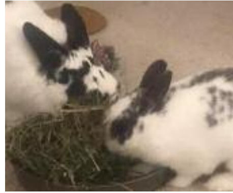
Oreo and Luna.