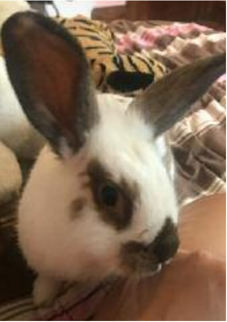
Charlie after a few weeks with us.

Luckily, Charlie received a clean bill of health from Catnip & Carrots Veterinary Hospital. Despite being found outside, he is (and was) very clean. The little guy was 4 pounds at the last weigh-in and is estimated to be around 6 months old. It's hard to say how big he might get. He's definitely grown a little since we took him in and his ears are very large. We have his neuter surgery scheduled very soon, and this should help to