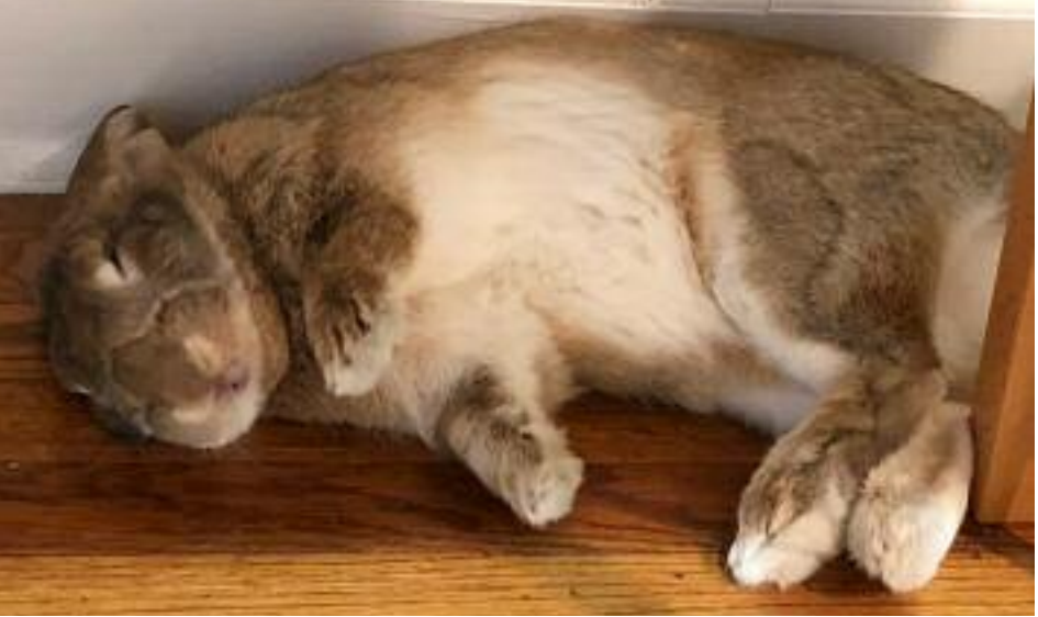
Olaf flopped comfortably at home.

rabbit. In October 2020, I contacted Long Island Rabbit Rescue Group and after going through a thorough screening process and interview, I was approved for adoption. I looked at the rabbits up for adoption on the LIRRG website and was told to pick one or two rabbits that I was interested in meeting. While the first rabbit I met was very sweet, he was not the right fit for my family. I was very eager to bring a new bunny home, but knew it was better to wait for the right rabbit to hop along as opposed to making a hasty decision.