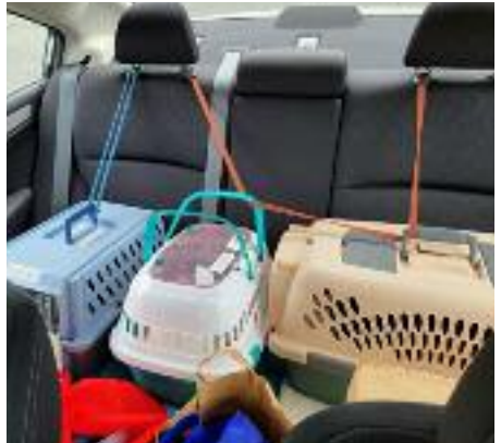
All passengers were secured in the back seat.

vacation as they are still bonding, but they had time to play together as well.