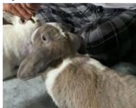
Cuddles and Cleo Fiona.