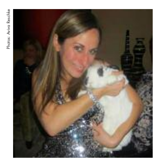
Frasier with me at my 30th birthday.

Shortly after I got married, I moved from New York to California. My husband liked animals just as much as I did but we weren't ready for the responsibility that came along with owning a dog. Cats were not an option as my husband was very allergic to them. He suggested we adopt a rabbit. My initial reaction was that he was out of his mind. I didn't have anything against rabbits but there