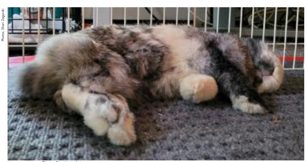
Mountain air flops for Noah!

Upon arrival we set up their X-pens and each bunny happily hopped in to eat some hay and drink some water. During the first few hours we monitored all of them for droppings and to be sure they were drinking and eating. We kept Noah and Puff side-by-side even on their