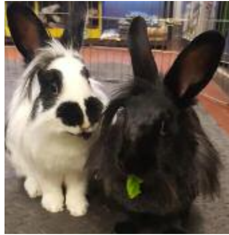
Pineapple and Sugarplum.

running and binkying with reckless abandon! They have been spayed and are living in foster care. If you are