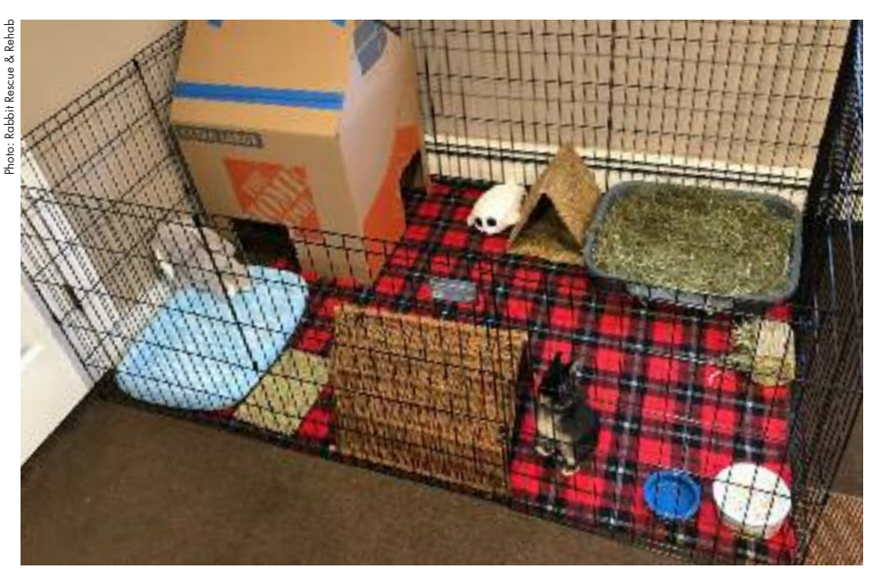
'Home Base' is a well-furnished puppy pen.