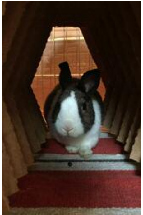
Arnie in his accordion tunnel.

rabbit will eat from this hay, too! That means that your litter box must be very full of hay, much more than only what your rabbit will eat since some of the hay will become soiled and your rabbit will only eat what is clean.