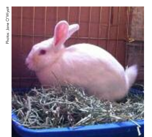
Lola peeing in her litter box.

Select an appropriately sized "cat-type" litter box for your rabbit. The size should be large enough that your rabbit can lie down comfortably inside the litter box. Avoid "corner" litter boxes, as they are not large enough for even the smallest rabbits. The bottom of the litter box can be lined with newspaper sections, and then an unscented, non-clumping, and non-clay-based litter can be added for additional absorbency, if desired. Options include compressed paper pellets, wood pellets or paper pulp. Whether you choose to add litter or not, the entire litter box must be topped with a thick layer of fresh, quality, Timothy hay to allow urine to pass through and keep the rabbit's feet completely dry. Your