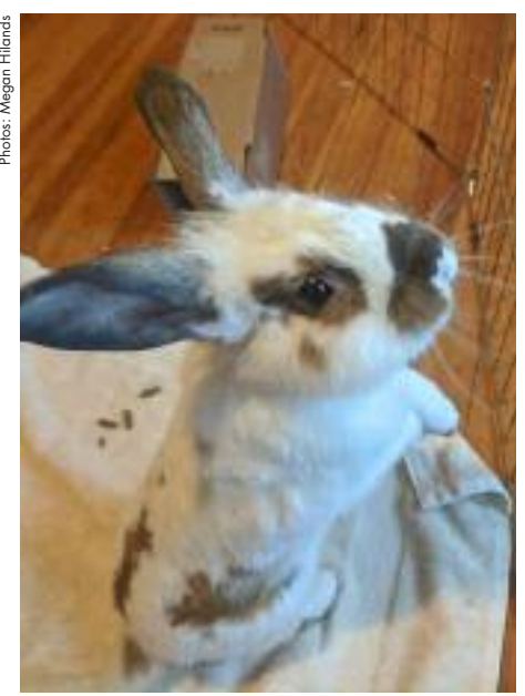
Charlie right after we got him inside. He was curious about his new surroundings right away.

Charlie is without a doubt one of the most adventurous and affectionate bunnies I've ever met. He loves to climb on us and cuddles up right next to us for pets. He even started to groom us within the first week of living here. He is also extremely agile and clever. He can easily open the door of an X-pen if we forget to fully latch it, and can jump out of a 40-inch pen (which we've covered with a sheet for now). He's even jumped to the top of a desk! Sign this bunny up for the Olympics!