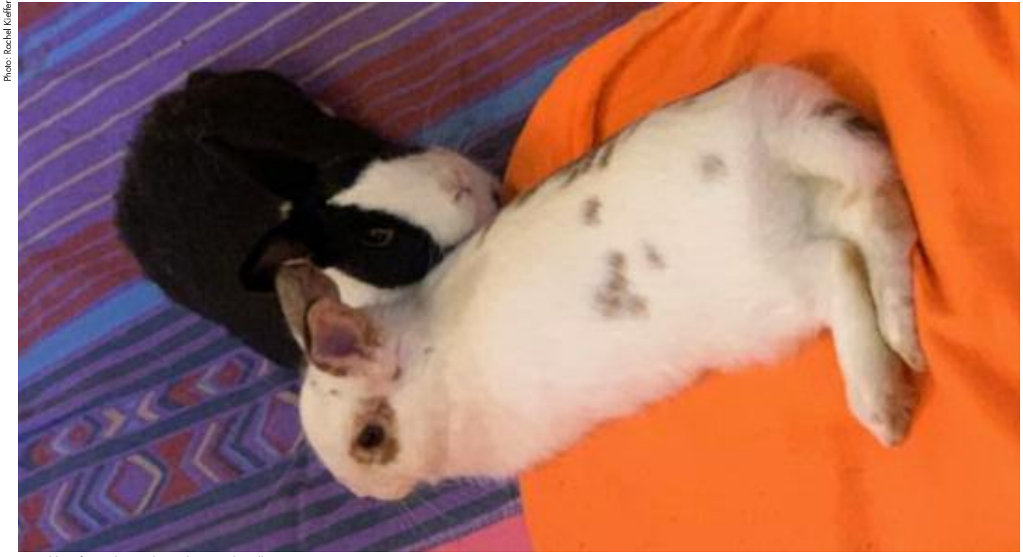
Munchkin (formerly Panda) with Matzah Ball.