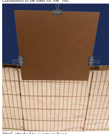
'Hat" attached to a gate or X-pen