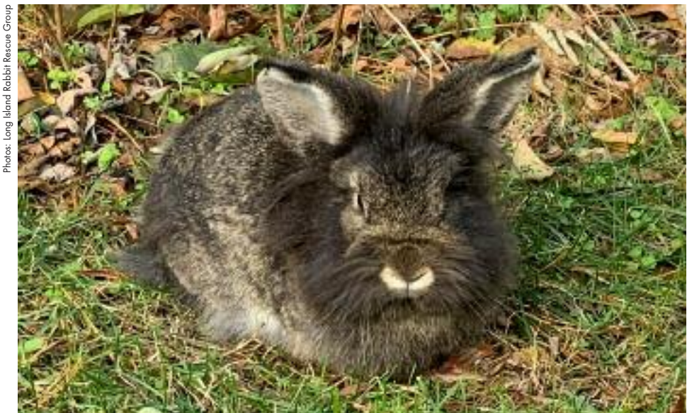
Violet in the finder's backyard.

together as a team helped us to achieve our goal of helping to save an abandoned animal. Can I do this? YES! Will I help or hinder this situation? HELP! Am I ready? ALL DAY, EVERY DAY! A special thank you to Long Island Rabbit Rescue Group for making this amazing experience possible.