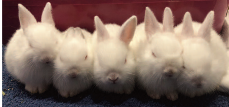
We needed to be able to tell the babies apart!