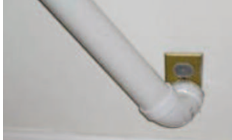
PVC pipe protects electrical wires.