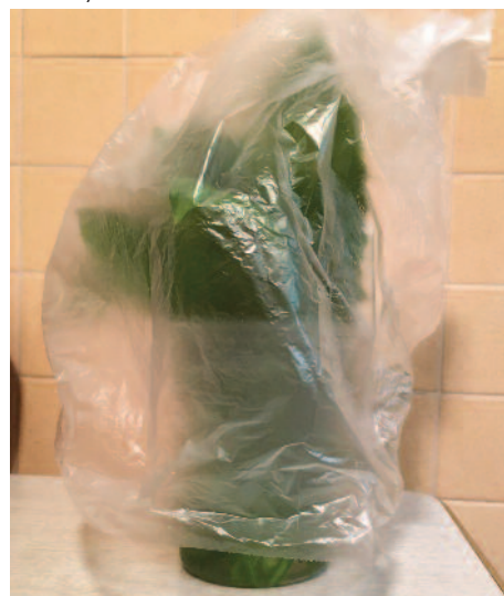
Keeping greens fresh