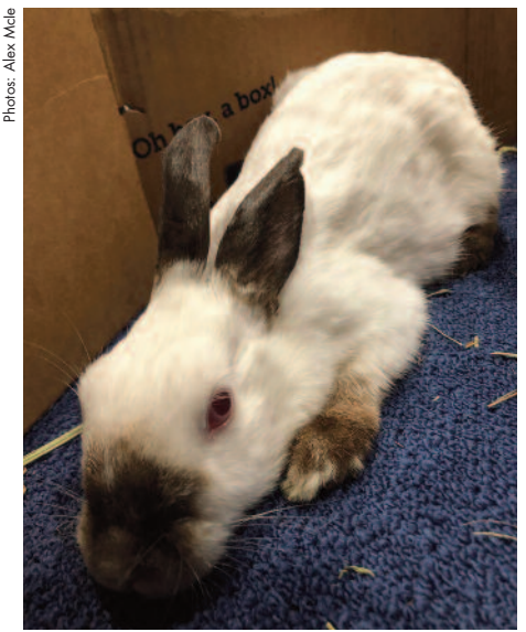
Before: Skye, May 2019.

When the babies were only about one month old, we started to see some very unusual behaviors from Green. She would seem to get "stuck" looking straight up in the air, and for 10-plus seconds at a time, would not move and would seem unaware of anything going on around her. This soon progressed to where Green would look up, stand up on her back legs, and then continue to lift her head further and further until she fell straight backwards. At its most severe, this would happen several times an hour.