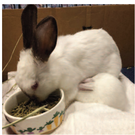
Skye with one of her litter.

One night Pink suddenly stopped eating, and he declined rapidly overnight. He stopped pooping, instead producing a lot of mucus; a sign that he was straining and in great discomfort. Throughout the night, his positions and loud tooth grinding made it clear that he was experiencing a lot of pain. First thing in the morning, he was rushed to the vet. Pink was hospitalized for days without a diagnosis, never returning to normal, but with intermittent periods in which he would seem to be improving. Pink came back to his foster home during