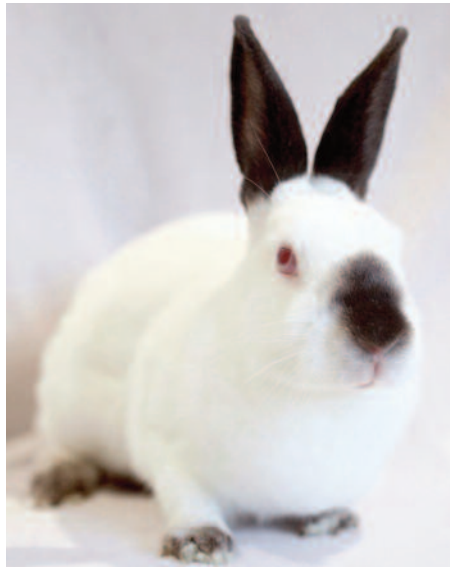
After: Skye, November 2019