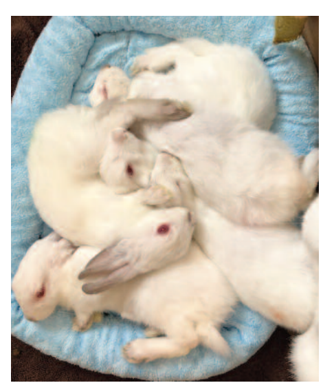
Babies nestling together.