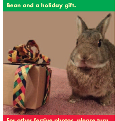
For other festive photos, please turn to page 6.