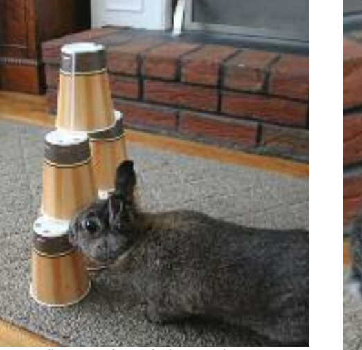
Any small cups can be stacked over and over again for bunny to knock over.