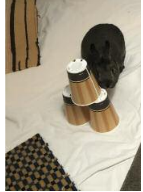
On Bun Island with stacked cups.