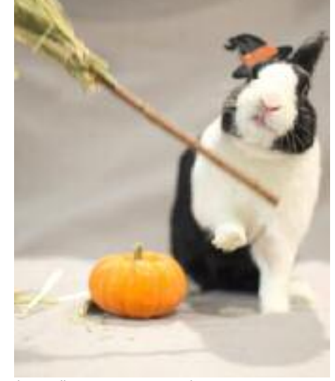
Iko's Halloween costume, outtake 2.