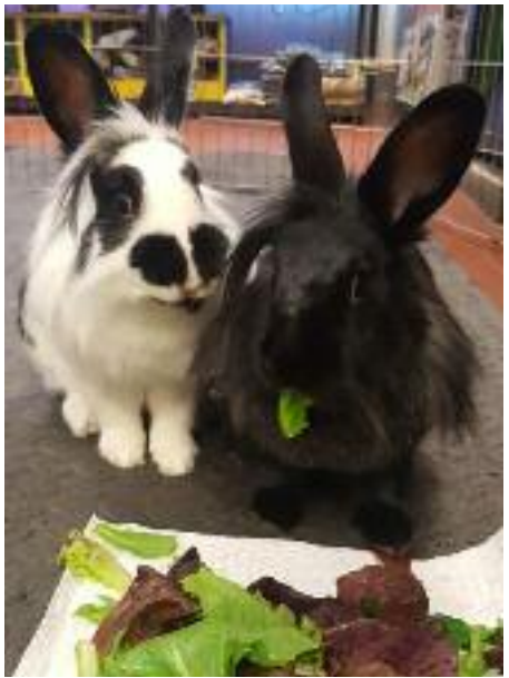
Pineapple and Sugarplum.

are a joy to watch as they exercise – running and binkying with reckless abandon! They have been spayed and are living in foster care. If you are interested in adopting Pineapple and Sugarplum, please email nyc.metro.rabbits@gmail.com.