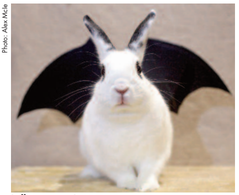
Puffin poses as Batman.