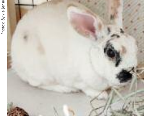
The incomparable Carmela.

Adoptapalooza was presented by Rock& Rawhide, and featured hundreds of