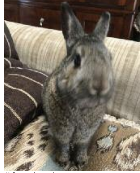
Chilling on the couch.