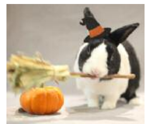
Iko's Halloween costume, outtake 1.