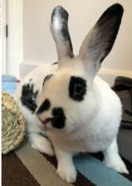
Today Marbles has reached a healthy weight and has become a happy and confident bunny.

When I found her, Marbles was thin, scared and disoriented. Without resistance, she let me wrap my sweatshirt around her and carry her home. She welcomed being brought indoors (I suspect she had been kept outdoors – her legs were dirty and she had ticks) and loved nothing more than being soothed by being petted behind her ears. Over time, she has become not only friendly but funny. She does binkies every morning before breakfast and then takes a nap. She is constantly rearranging her toys and likes to adjust my pants and sleeves with her teeth. From a distance, she gets along with my very docile cat, Claude, who is very curious about her vegetarian diet. Marbles is now healthy and has filled out into an elegant and trusting rabbit