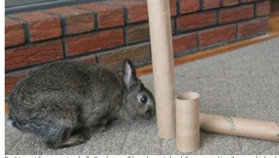
Don't toss out those paper-towel rolls. Your bunny will be so happy to knock them over and toss them over his head