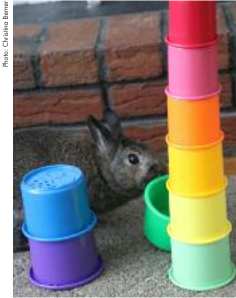
Stack them, hide treats under them or just place them around and you'll find what your bun likes best about stacking cups.

Bowling — Bunnies love to nudge things out of their way. Sometimes they