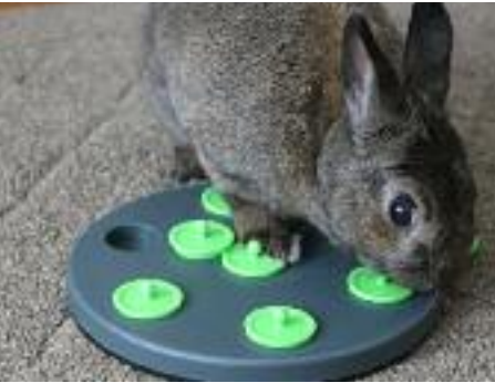
This Trixie toy makes treat time more fun for bunnies. They love to sniff out the treat's location.