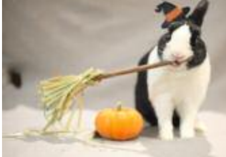
Iko's Halloween costume, outtake 4.