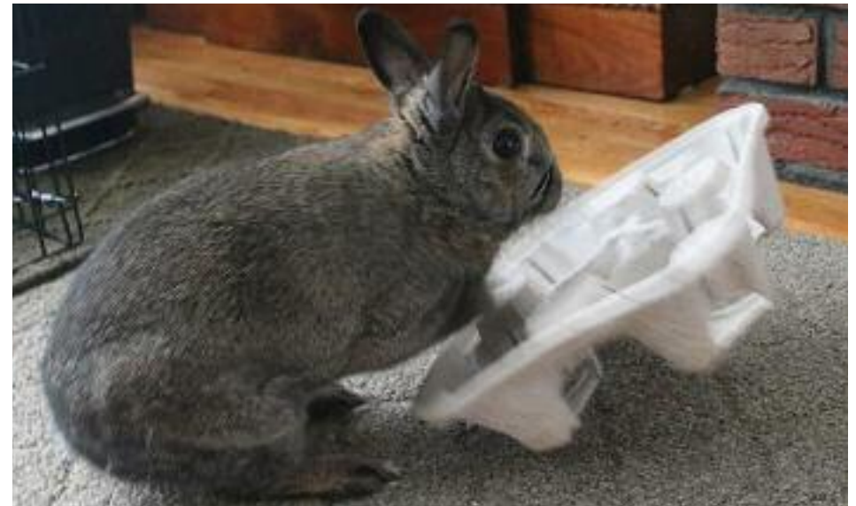
A drink holder is one of the best toys a bunny could ask for. You'll see your bun flip it, chew it and dig at it over and over again.