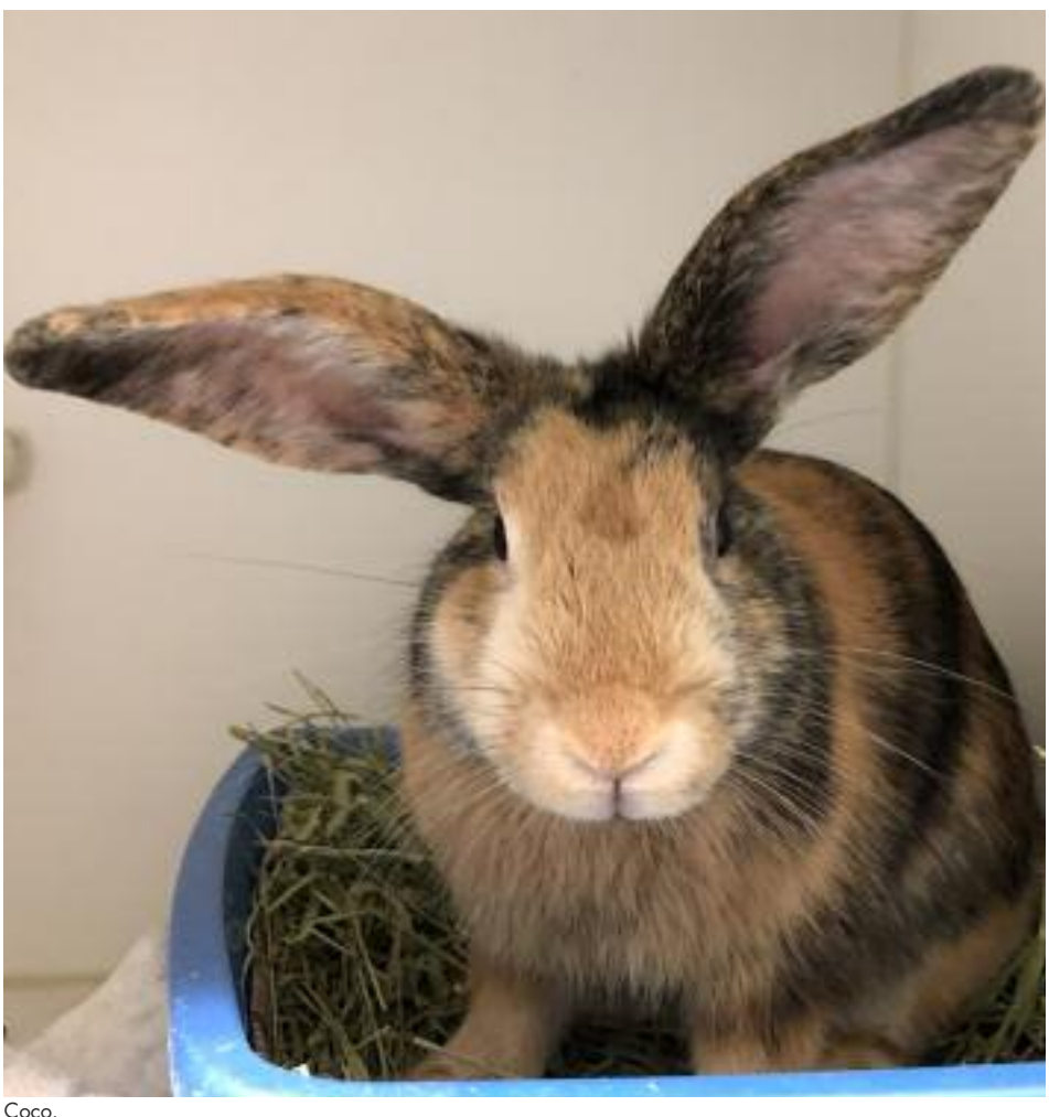
THUMP OCTOBER 2019