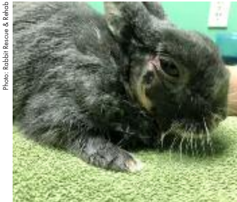
Toby being treated for an abscess in 2018.

Toby's veterinary bills have already been costly, with his expenses to date having well exceeded $4,000, which we have been able to cover. At this time, we are