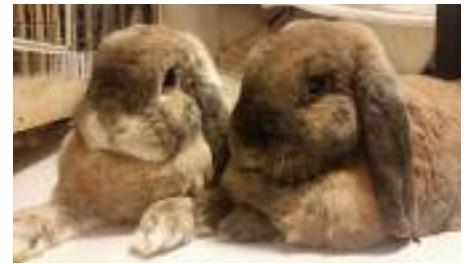
Wally and Daisy.

Sadly, Woody was found outside in the woods with two of his pals, and rescued just in the nick of time. Upon rescue, they were weak and disoriented. Thankfully, with the right care and lots of TLC, they are now healthy beautiful guys with a zest for life! Woody is a medium-sized, handsome light brown and white young boy. He has a wonderful spirit and personality. He is an inquisitive bunny with a weakness for cilantro and the fabulous ability to keep his white paws sparkingly clean. He loves to explore and can be an excellent escape artist when his curiosity gets the best of him. Woody prefers head pets to snuggles, and he loves to lounge nearby. While independent, Woody is mild-mannered and takes most things in stride. Just don't mess with his feeding times or he will remind you by shaking rattling things to get your attention! Woody has been neutered and is living in foster care awaiting his forever home. For more information about Woody please email nyc.metro.rabbits@gmail.com .