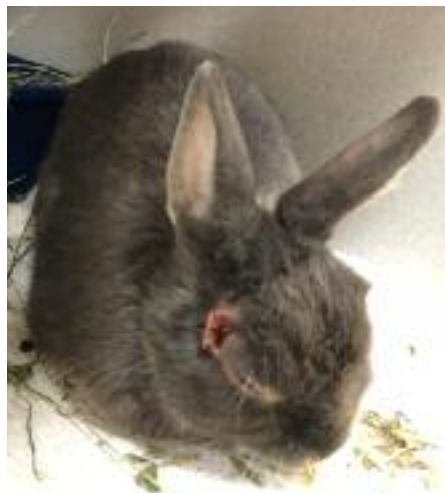
Toby when we first met him in 2018.

recovered beautifully from that surgery and is definitely much more comfortable without them!