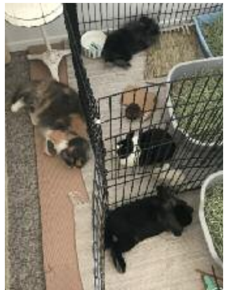
Happily living side by side with 3 inches of space in between and cat Patti joining them in a nap.