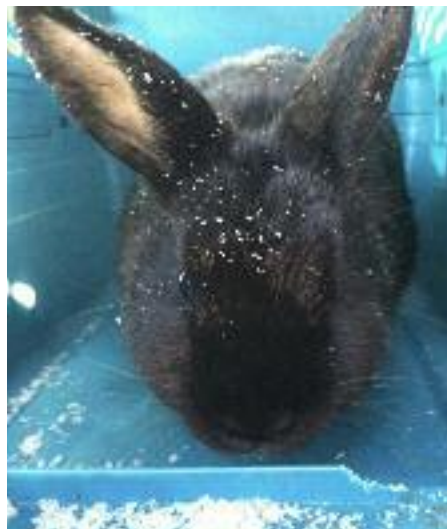
After her rescue, Maisie was placed in a carrier.

A few hours later, I found myself on my first domestic rabbit rescue, crawling on my frozen hands and knees in a less than welcoming Hempstead neighborhood. After over an hour, Maisie, as I soon named her, was located huddled under a parked car trying to conserve what little heat she could. With my team of two new Long Island Rabbit Rescue Group acquaintances, we received permission from the homeowner to carefully surround the car with exercise pens. I climbed in,