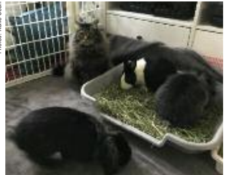
Bonding supervisor Nigel the cat on duty.