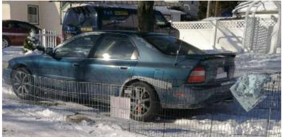
Maisie was rescued from under the blue car.

it to stay, we would make that happen. Enter the scrapbooking room!