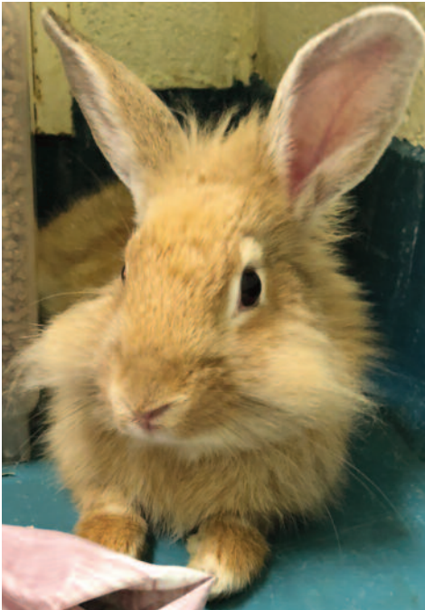
Bun Bun's mutton chops.