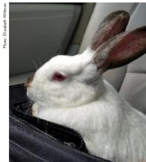
Marlena patiently waiting in the car after a trip to the vet.

Nonetheless, I didn't have too much time to dwell on this, because a new bun was coming in only a few hours. While exchanging messages back and forth with another Long Island Rabbit Rescue Group volunteer, I was sent a picture of the new baby. She was a Californian rabbit, a breed that I knew for their size