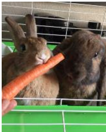
Cottytail and Flopsy.

were going to pan out. We brought along their favorite bed sheet, which we planned to use to obstruct the view between two cages, if needed.