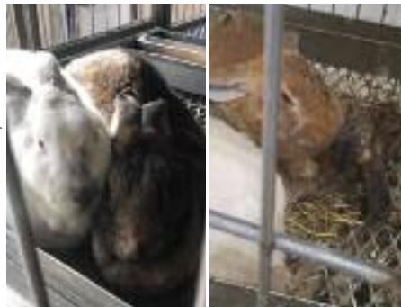
These photos were taken inside the slaughterhouse.