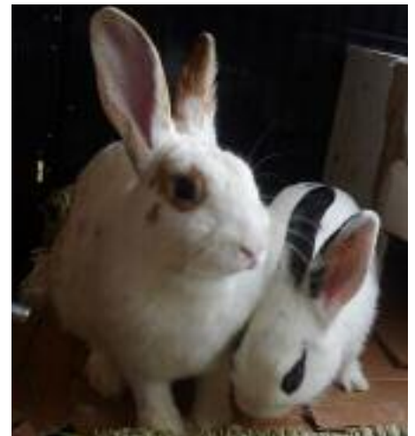
Mandy and Cruise.

Mandy and Cruise are a bonded mother-son pair of English Spot rabbits. Mandy is the larger bunny with lighter markings, and Cruise has the darker markings. They are curious and friendly,