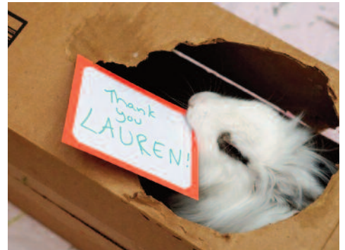
Bunny Coco holds a thank-you note for a rabbit-rescue donor.