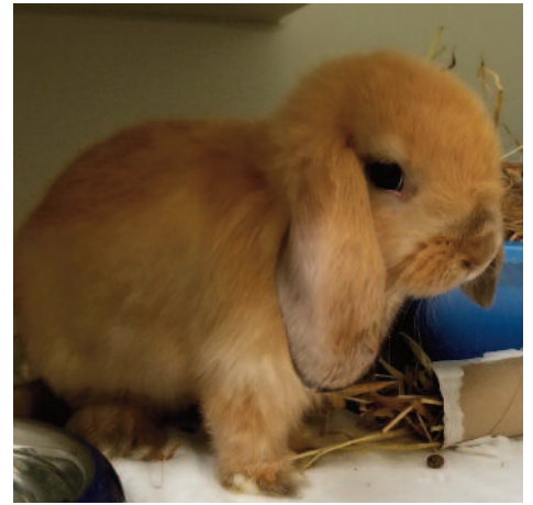
Red Bean Bun.