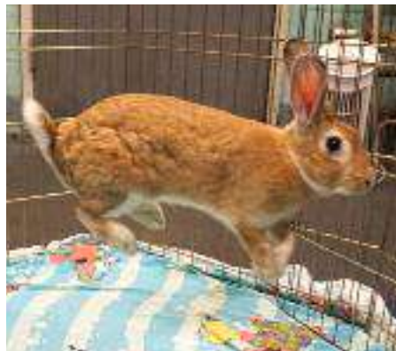
Lola: Astronaut. Lola the Astronaut hopes to go into orbit one day.