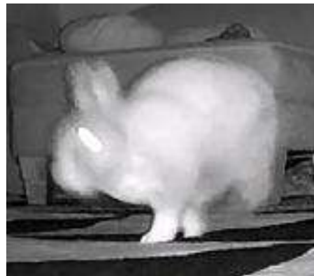
Tuck: Secret Dancer. Here he is caught on a pet cam in the middle of a highly choreographed performance.