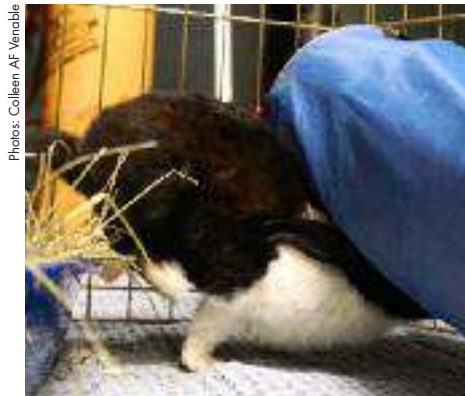
Lola: Pinballing. She clearly thinks jumping INTO the side of the tube is more fun than running through it.