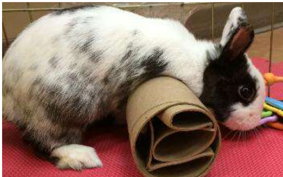
86th St. bunny.

and mauled, that came from hoarding situations or was injured from mistreatment. These rabbits all respond differently, but with love and care they all seem to come around in their own way and somehow understand they can trust again. I have seen the tiny sweetheart with splayed legs run to me for love and comfort, ignoring her condition. I saw my Lara after her leg was removed, immediately showing affection when she woke from surgery. Her trust and love have continued to grow. She has become a puppy dog that sits next to me in the evenings and asks for petting.