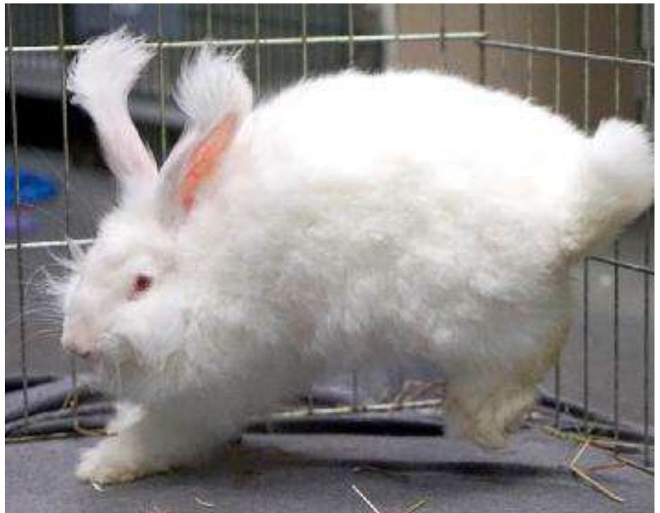
Cotton: Farah Fawcett. Stunning Cotton gives Farah Fawcett a run for her money.