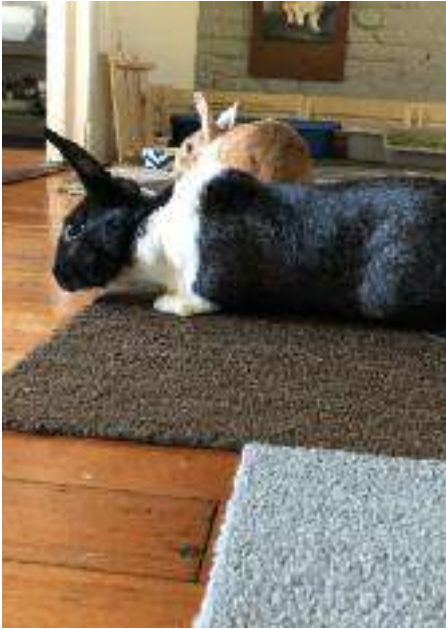
▲ Dashie in front, with Pippi in back. ▼ Pippi.