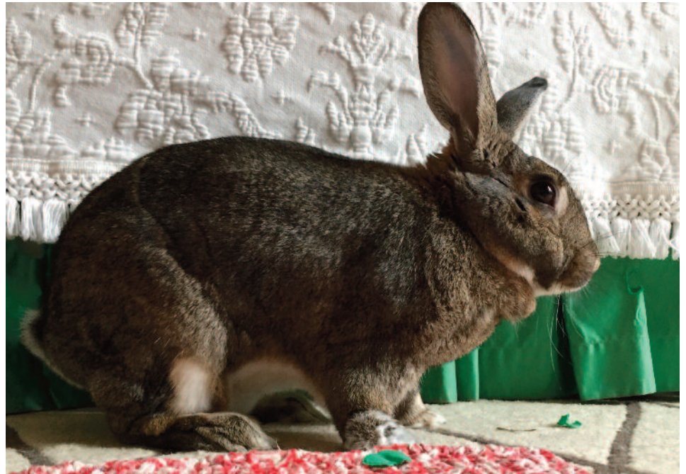
▲ Tina. ▼ Dusty Fluff.