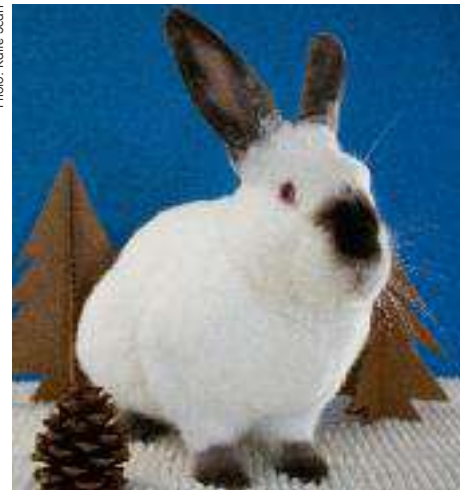
Adoptable boy Mylo loves to pose.