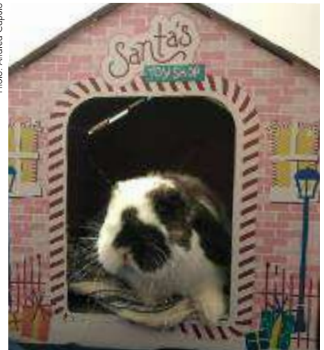
Hazel the lop sniffs around Santa's toy shop. She was adopted from Long Island Rabbit Rescue Group.