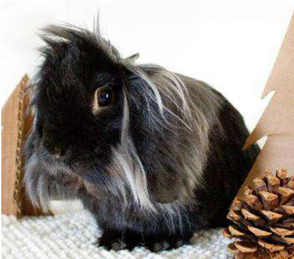
▲ Moe the Lionhead loves holiday fun. He was adopted from Long Island Rabbit Rescue Group. ▼ Winston is driving, Barney (who passed away recently) and Maisie are in the back.