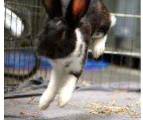
Yang: Popcorn Gymnast. A master of all styles, Yang shows off the Popcorn Gymnast.