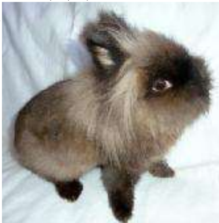
Veronica's "passport photo."