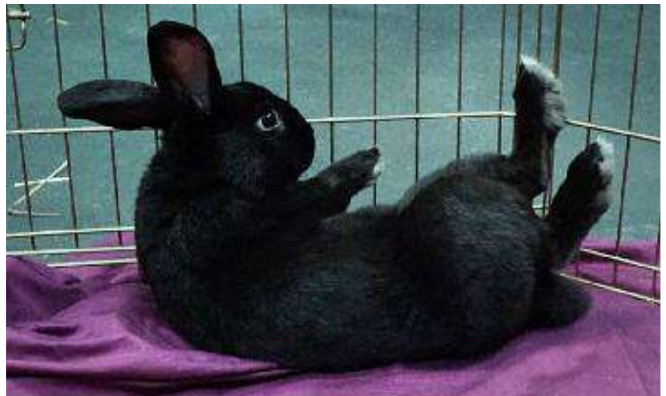
Dusty Fluff: The Finale. Flops are not always graceful, but Dusty Fluff sure made her binky Finale something to marvel at.

F-stop. The larger the F-stop, the more in focus parts of the image will be, so you have a better chance of getting that ridiculous mid-binky expression in all its glory.