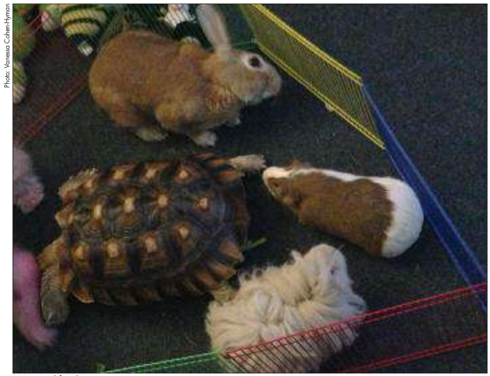
Monty and family.