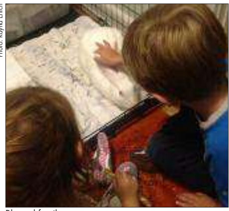
Blu and family.