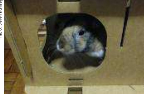
Duke, King of his castle!!!