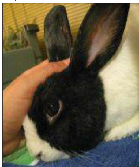
Sunny was a gentle, sweet boy.