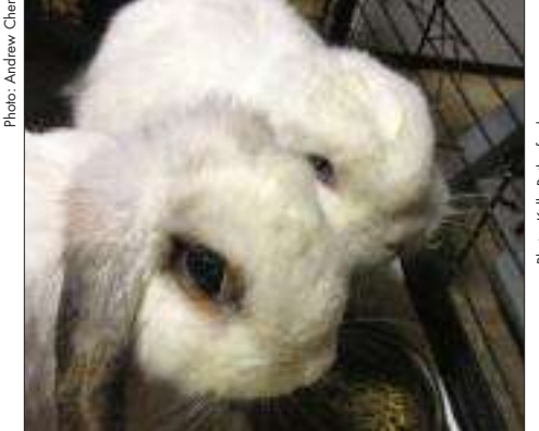
Candy and Momo...the love story continues.