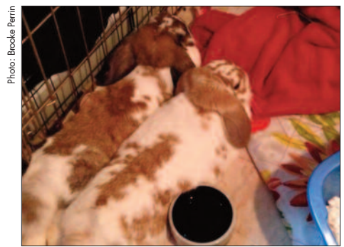
lune and Louise