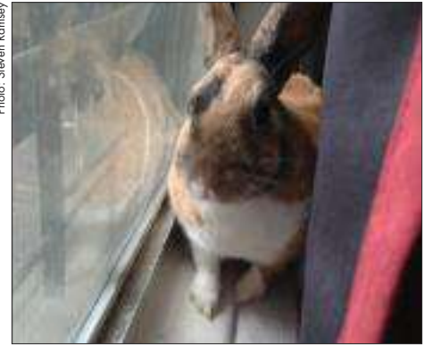
Sophia at the window.