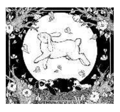
honor Megatron, I'm selling these silkscreens on my etsy (www.etsy.com/shop/followtheblackrabbit) and donating half of the proceeds to NYC Rabbit Rescue & Rehab. I want to spend the rest of my life giving rabbits a better life; I can't think of a better way to commemorate Megatron.