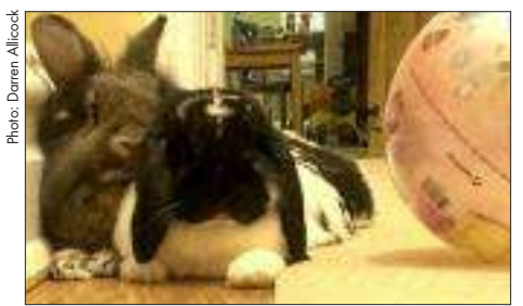
Chewy and Oreo.