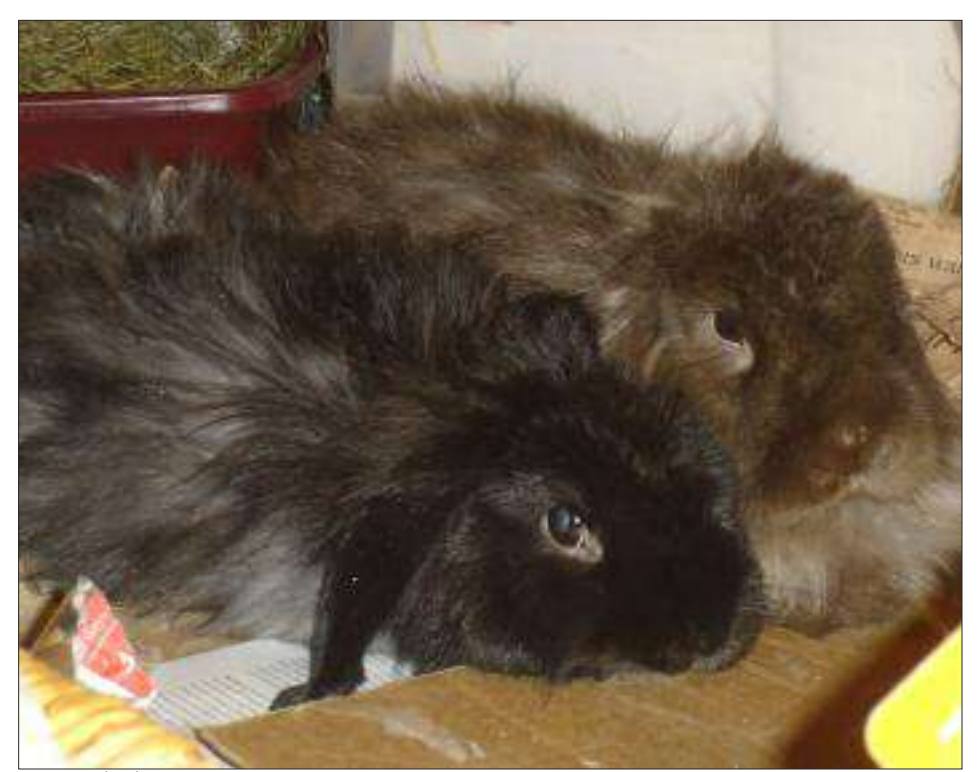
Mopsy and Robin.

I'm terribly sorry that I couldn't give Robin more than five years. I fought and fought to save him. Robin had health problems throughout his life. He had been to many rabbit vets in NYC and the surrounding area for his health problems. He'd suffered from numerous ear infections, E. cuniculi and repeated stasis episodes. Although Robin had at least 16 documented stasis episodes through the years, vets could never determine the cause.