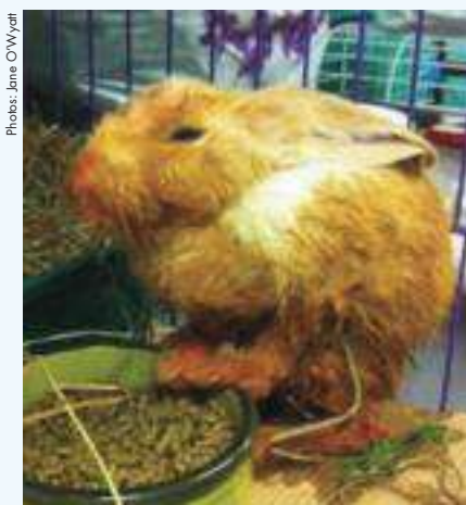
Sept. 6, 2010. Benita taking a rest break while eating pellets.

My helper Kitty Pizzo gasps, looks horrified when I bring the bunny into rabbit room. We set up cage: litter box lined with kraft paper, topped with soft Organic Hay Co. 2nd-cut, trimmed AC&C cardboard carrier with clean towel as a hideaway, water bottle with sipper tube. Rabbit sits in litter box in corner of cage with her back to us. She is wet and trembling, so I ask Kitty to find and nuke two SnuggleSafe heating