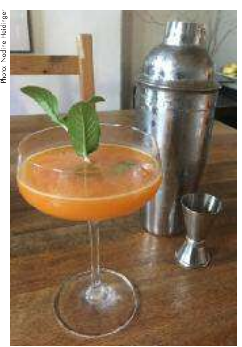
Krolik in the Sun.

Moving on to bites and nibbles, vegetarian and vegan options are a MUST at any