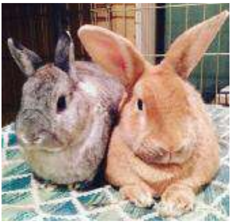
Eeyore and Lola.

and neutered. If interested in potentially adopting them, please email nyc.metro.rabbits@gmail.com