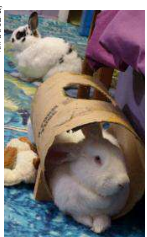
Charlie and Piper with cardboard tunnel.

Small cardboard tubes from toilet paper and paper towels also make great toys,