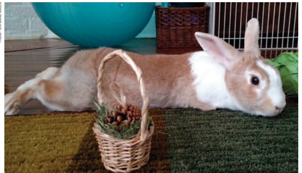
RIP Benita. See Thump's coverage of Benita's rescue and rehabilitation in 2010 and 2011, pages 19-26.