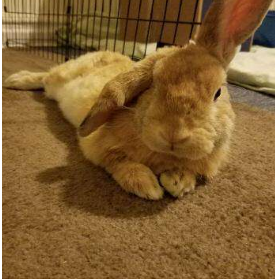
Baloo stretched out.