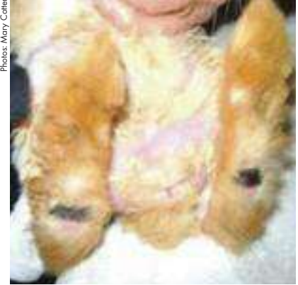
Sept. 19, 2010. Scabs on hocks

She gives a quick startle and jerks away when I am too close, or nicking her skin, but she settles right back down on my lap, unrestrained, ready to tolerate more. I am able to use one hand to hold up the spikes, and the other hand to work them loose with tiny scissors or with my electric clippers - leaving no hands to restrain her. She permits me to use those loud electric clippers even right next to her enormous angel-ears. Some very sensitive areas (especially under her chin) she does not want me to touch, but we "negotiate," and sometimes she relents a little, and I am able to make some progress. And when she has had enough, she lets me know, and I put her back in her cage so we can both take a break.