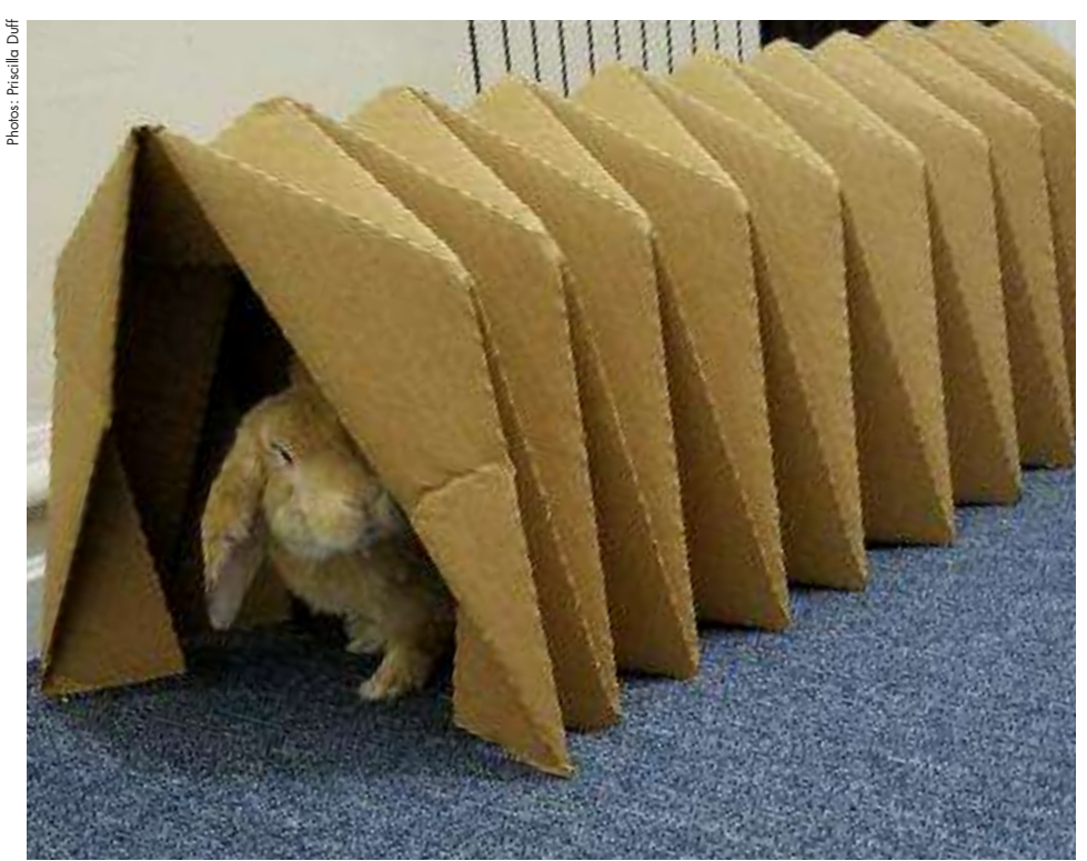
Baloo in cardboard tunnel.