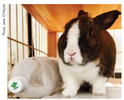
Arnie with frozen water bottle on ceramic tiles.

islands" that can make it feel even warmer than surrounding areas, and with a heat index that can soar to the upper 90s for multiple days at a time. I would rather