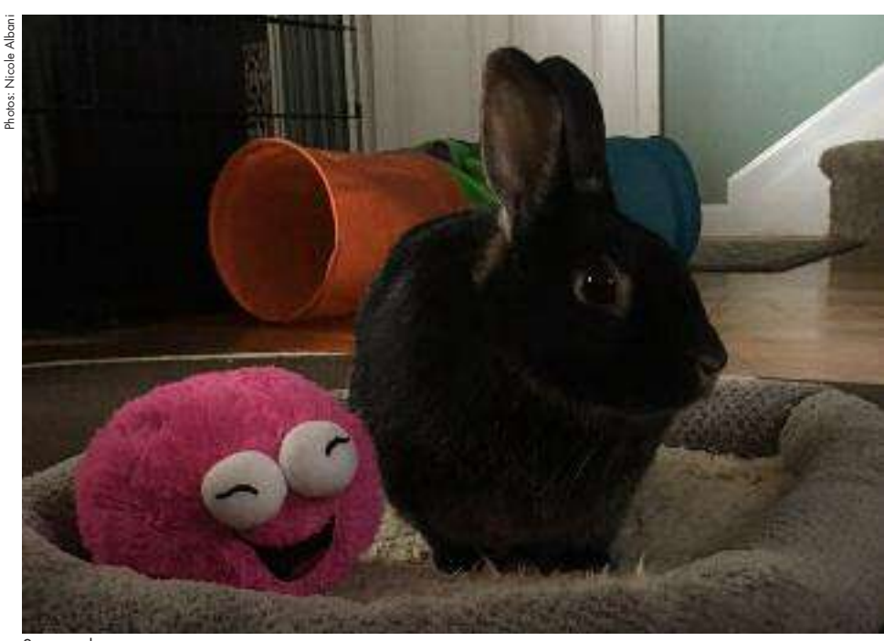
Storm at home.

I never knew there was so much to learn about rabbit lingo before Storm came into our lives. She has taught us a lot and has made us better bunny parents. Learning any new language takes time and patience, but most of all, love. If you get to know your little ones, learn what to look for, and listen to their own special personalities, you, too, can be "bunlingual!"