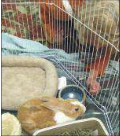
Benita with admirers at annual Rabbit Rescue & Rehab conference at the end of October.