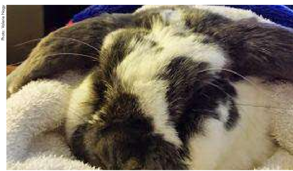
Lucky as burrito bun.

I began using a burrito technique with Lucky, wrapping him a towel and petting him on the floor. He enjoyed these burrito sessions, hanging out with me as I stroked and kissed him while he was burritoed.