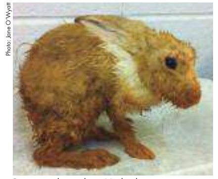
Benita on the scale in Medical.

After passing by the entrance to the aforementioned building, I noticed a small box in the doorway. Upon closer inspection, it appeared to have something inside it: something alive. That's when my heart sank; it was a filthy bunny rabbit trapped inside an even filthier cage, stewing in a concoction of its own urine, feces and God-only-knows what else. The cage – barely large enough for the rabbit to stand upright - was rusted and the attached water bottle also heavily oxidized, barely capable of releasing the murky fluid inside. At first I panicked, completely overwhelmed by the shocking discovery; how could somebody just abandon an animal like this? I rushed back to my own apartment, dropped off the groceries (my appetite having since expired) and got online to contact my