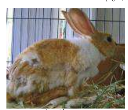
Oct. 2, 2010. Clipped fur is growing in.