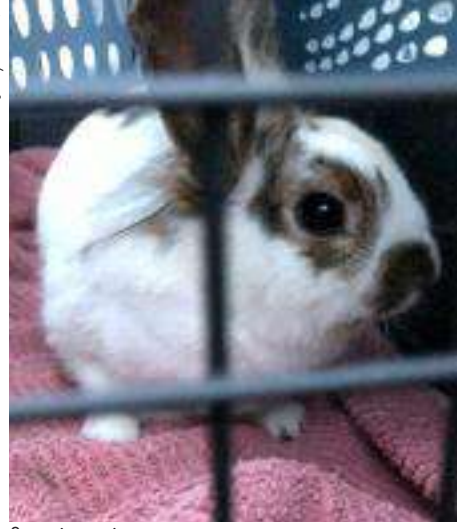
Scout in carrier.

The rabbit was sitting in the grass, munching on leaves, in all of its white and brown beauty. Bryce ran back to the car to grab the carrier, pen and some treats that might appeal to the poor little bun. Short on supplies, we knew we had to act quickly and effectively.