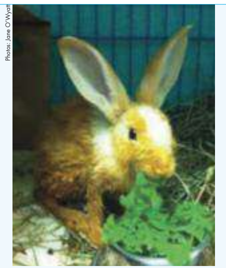
Sept. 7, 2010. Benita eating greens, ears up.

After Kitty and Cindy leave, I reheat both SnuggleSafes and put them back in cage (it's 8 p.m. and maybe they will stay warm through the night, though manufacturer guarantees only eight hours of heat), set up a salad bowl with wet greens and add dry pellets to bowl on top of which Cindy had put the