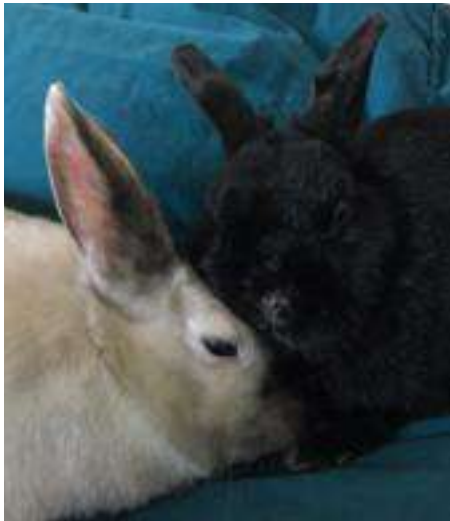
Chewy and Rufus.

At home Rufus decided he was going to try to be dominant. A couple of weeks later, I had a day off where I could keep an eye on them. They became friends and settled on a co-dominance relationship.