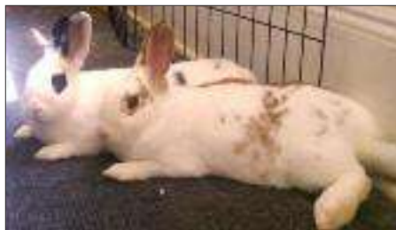
Mandy and Cruise.

Freddie and Flossie are a bonded pair of medium-sized bunnies that must be adopted together. Flossie is slightly larger than Freddie and has more brown fur. They have been spayed and neutered and are currently in foster care. For