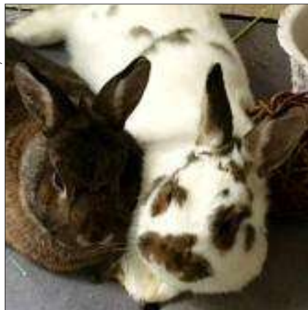
S'mores and Oreo.

cleaning each other. We have snuggle time most nights before bed.