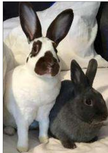
Nala and Simba.

Angelina and Floppy are a bonded pair of medium-sized adult rabbits who need