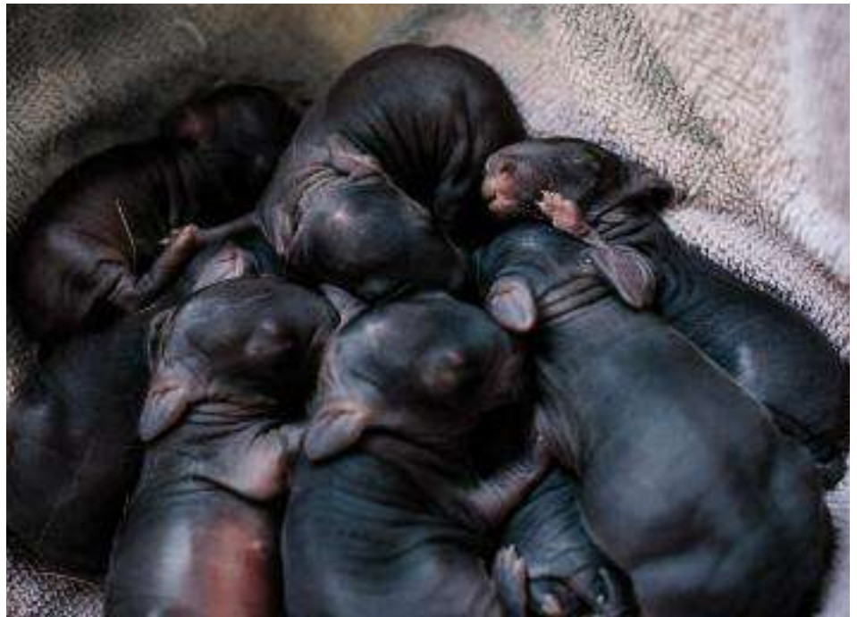
Eight beautiful kits! Mom, dad and babies are looking for homes.

hutch. How did this happen? How did she get INSIDE of the hutch? We were confused, but also genuinely concerned that we had just stumbled upon a breeder from whom the rabbit had escaped, and we would be met by an angry homeowner telling us to leave.