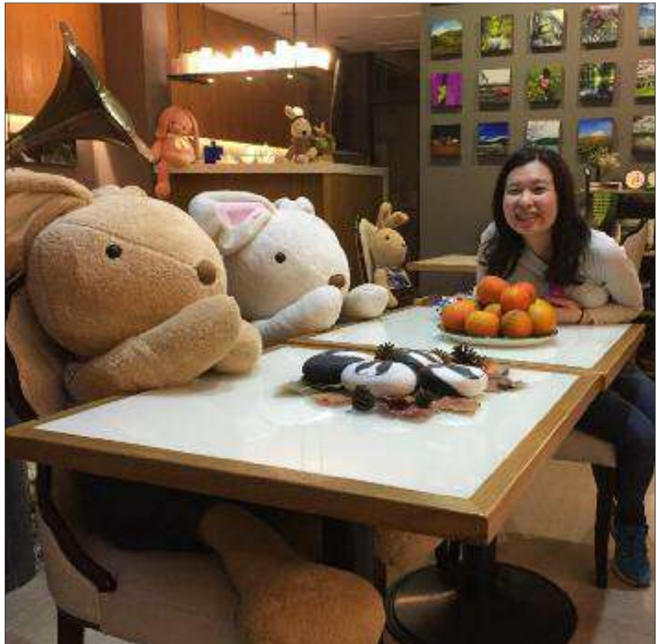
There was a dining area where guests were served breakfast. The benches were shared with stuffed rabbits like these two here. The counter behind these two new friends is the kitchen area where the owner prepared the morning meal.