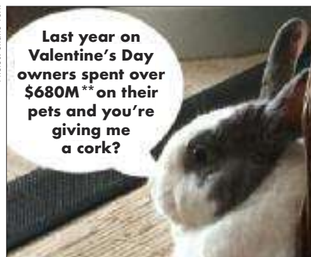
Lola always knows best.

soon as Lola heard this, her ears picked up and she flicked him on her way out. He laughed and asked me what that action meant. "The bunny just said, 'Flick you!'" Lola always knows best.