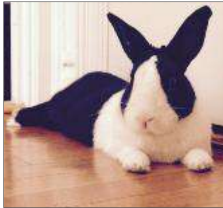
We have carpeting pretty much everywhere but Babs loves lounging on that bit of hardwood floor.