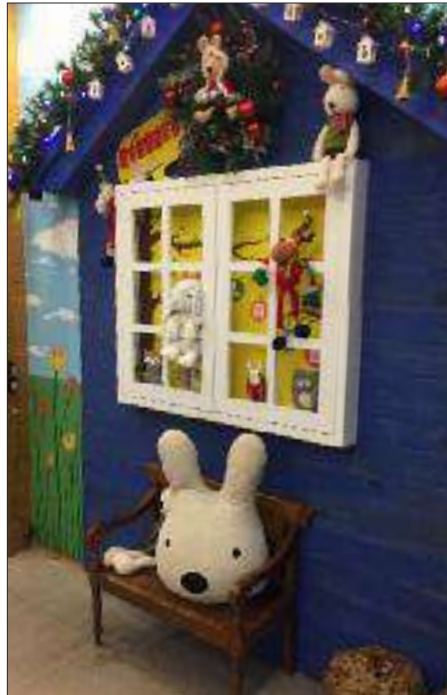
What we saw upon entering the B&B.