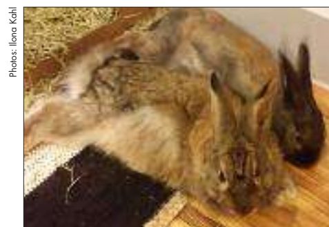
Thor and Siv.