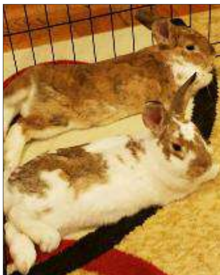
Freddie and Flossie.

more information and/or to arrange a meeting with Freddie and Flossie, please email nyc.metro.rabbits@gmail.com .