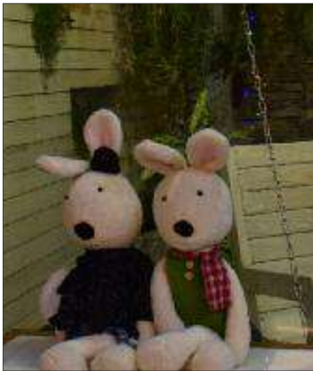
The enclosed porch area had a nice swing. We saw kids playing on it in the morning.