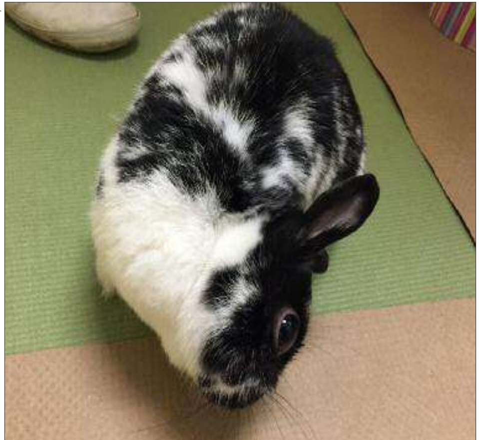
Dizzy fka Thumpelina, during speed date at Center for Avian and Exotic Medicine, 2015.