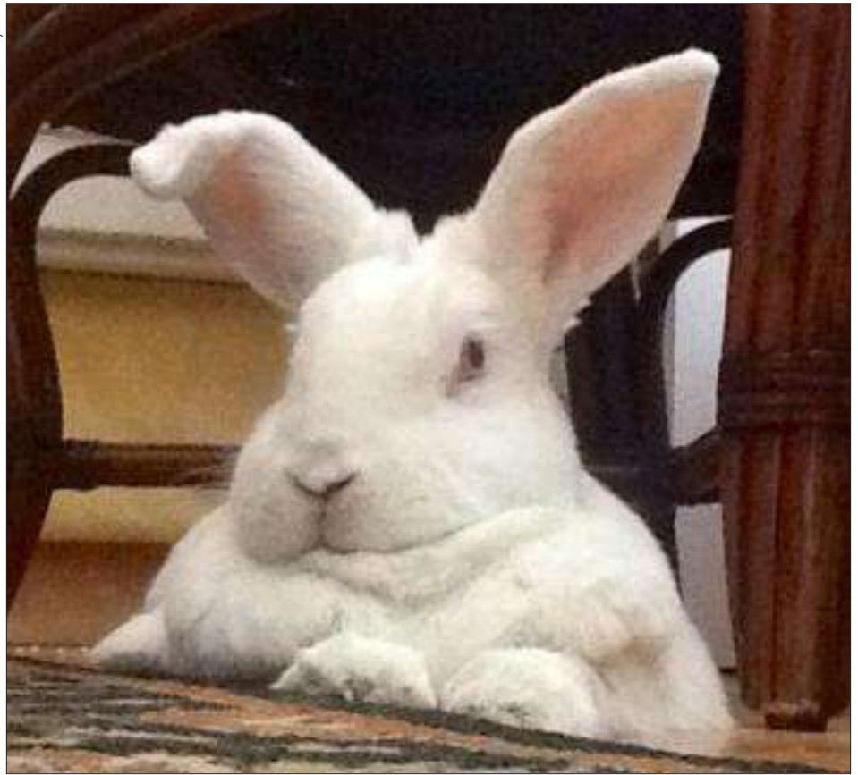
Rosa. 'My heart has joined the Thousand, for my friend stopped running today.'—Richard Adams