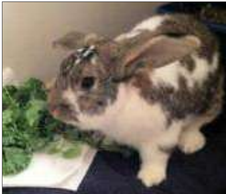
Francis recovering in the bathroom.

our cats, and each species was curious about the other, opening and closing the bathroom door was an anxious business. Francis, who responded well to treatment, started binkying in the limited space and wanted to meet the cats on the other side of the door. However, he seemed to accept the fact that he wasn't here to bond with our cats. He made himself at home in the bathroom, becoming more host than guest: he welcomed us with invitations to pet him. He tickled our bare toes with his whiskers and chinned our ankles.