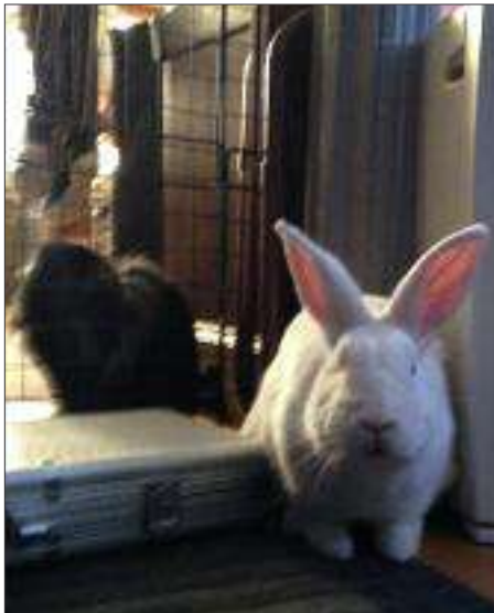
Chopper and Buster.