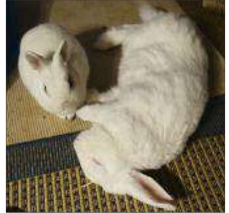
Love is feeling safe to flop. Luna guards Snowball.