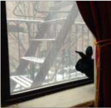
Owney checks out the first snow from the window.