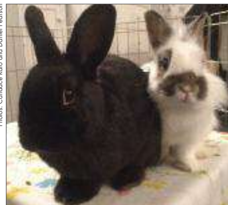
Pepper and Chili.