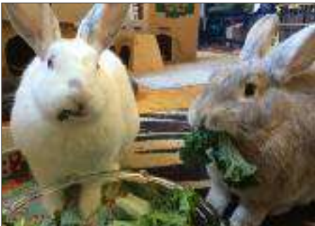
▲ Trixie and Bunz. ▼ Fuzzy.