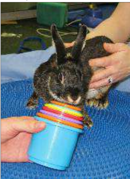
Working with plastic cups.