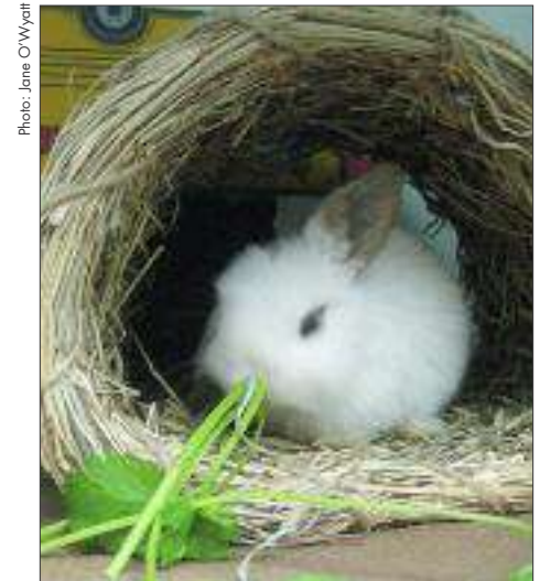
Candy eating cilantro at AC&C.