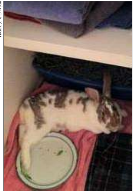
Nutmeg fka Angela.