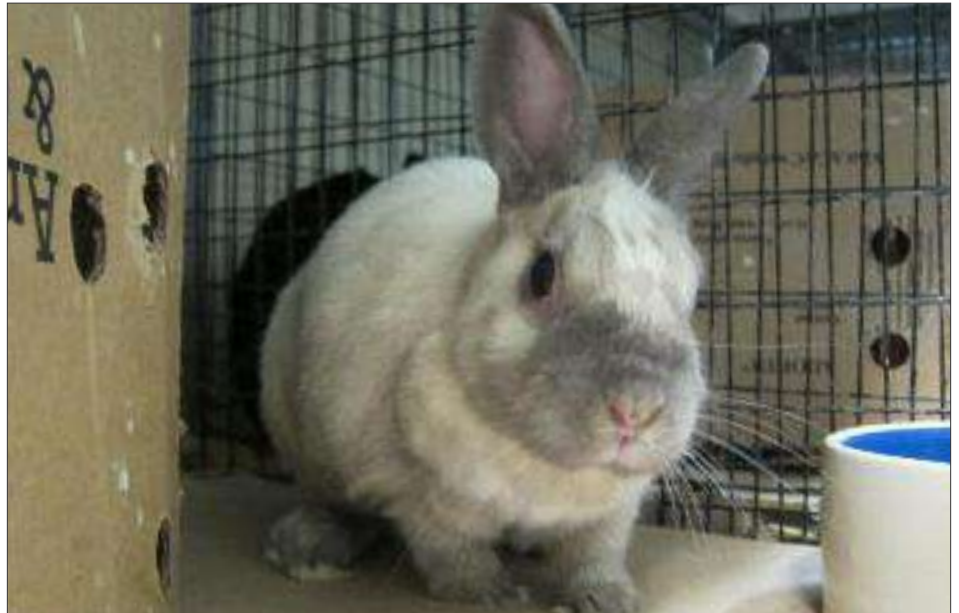
▲ Rocko. ▼ Thistle.