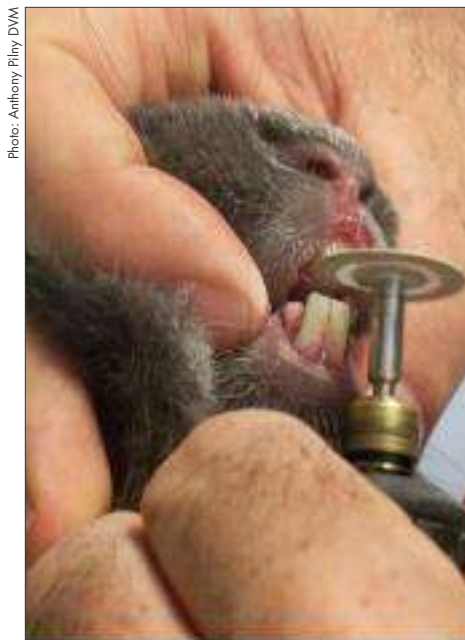
Trimming incisors with a diamond disc.