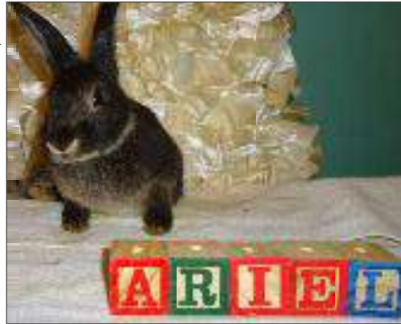
Ariel as a baby.

I spent the hottest days of July with the air-conditioning cranked up in my apartment while I was sporting a turtleneck. Any exposed skin was too tempting for Ariel to bite or scratch. I couldn't avoid handling her; after all, her hind limbs were paralyzed. She was unable to hop. I needed to bathe her once or twice a day just to manage her urine scald. Taking care of Ariel required a hands-on approach. I just needed to realize that MY hands on Ariel resulted, most days, in bloodshed for me. It was an acceptable trade, under the extreme circumstances, and one I hoped wouldn't be permanent in our relationship.