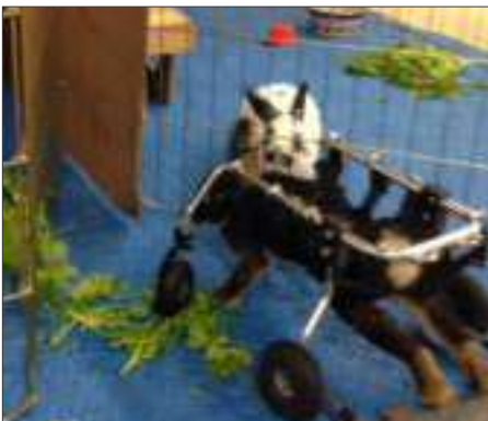
Ariel visits Whiskers in Wonderland at Petco Union Square.