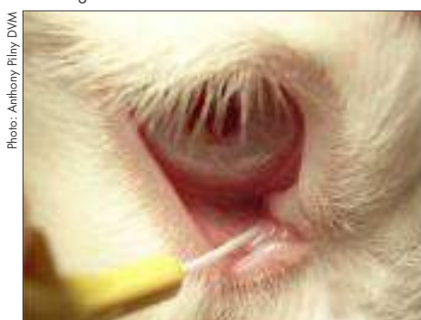
Flushing a blocked nasolacrimal duct.