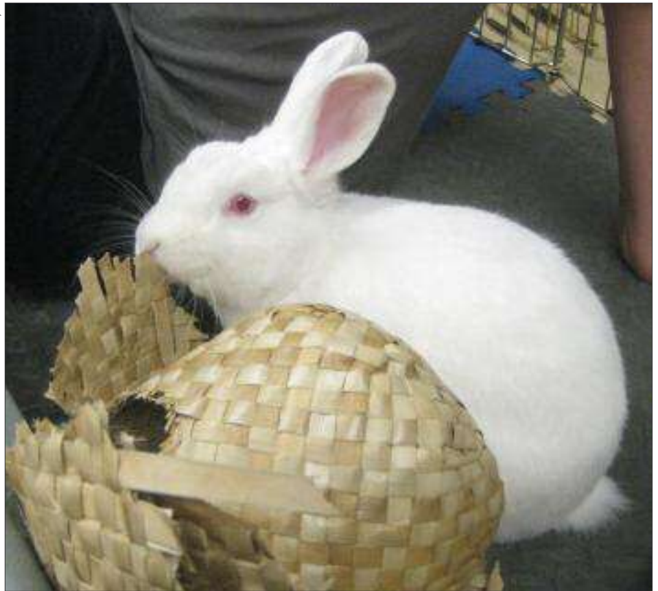
Lola eating a straw hat, a gift from Thea.

destroyed five-foot cardboard tunnel – Lola took the L train with Thea, who immediately reported: