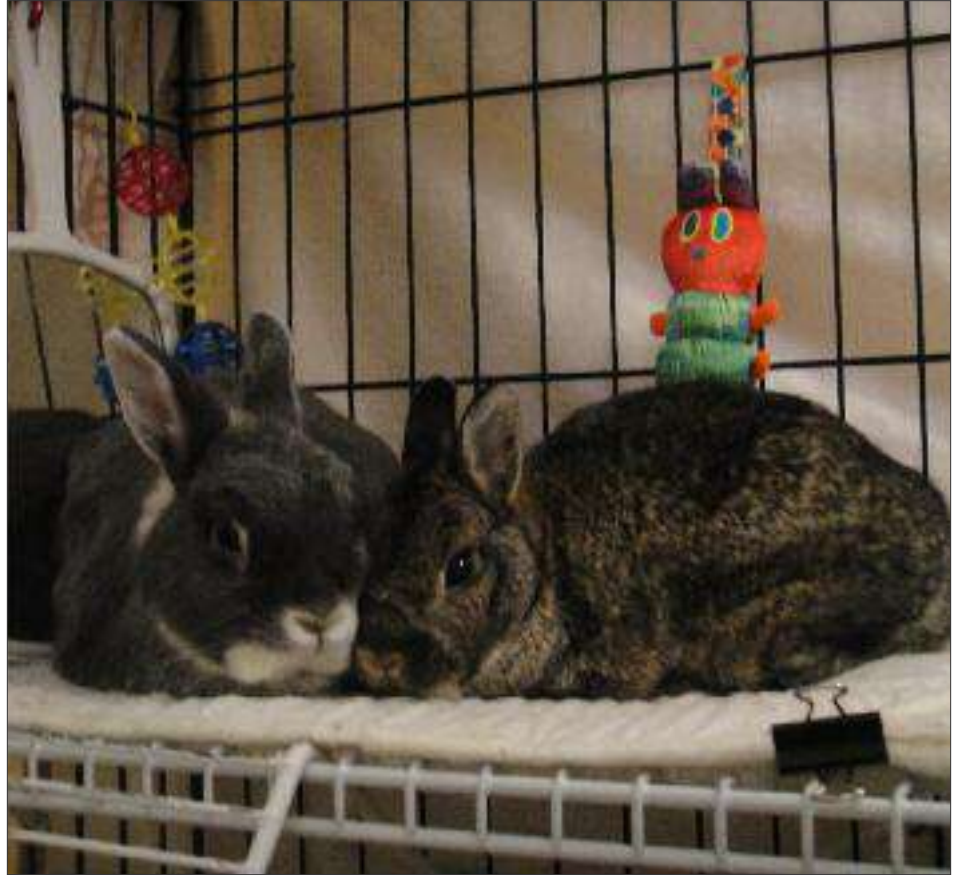
Sonic and Freeda.