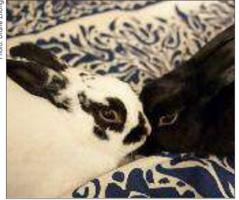
Sesame fka Mel and Vanilla.