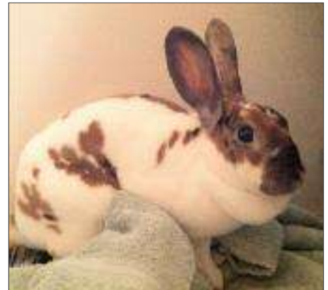
Flopsy fka Reilly.