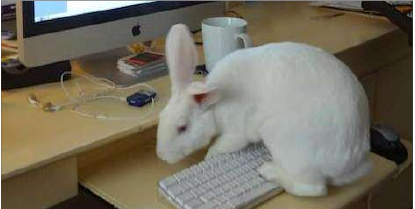
Blu sitting on Sabine's keyboard.