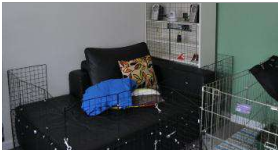
The couch is now bunny-proofed with wire storage-cube panels.

I am currently trying to bond a new bunny with one of my own so I had to figure out a way to fit a new pen into the room. I ended up having to move my computer desk but I didn’t want to lose the use of all the electrical outlets where the desk used to be. An IKEA bookcase with a hole cut through the back, positioned in front of the outlets, was my solution. This allowed me to run wires behind the bookcase and put electronics on the shelves. You can put cabinet doors on the bookcase, but I wanted airflow for my electronics so I used some more storage-cube panels. I affixed them to the front with some metal hooks. Not only did I salvage the utility of my outlets but I also gained a lot of storage space. My webcam is safely spying on my bunnies from inside the bookcase. Depending on the height between the shelves, mesh wire baskets can also be a safe way to store items and block access to outlets in a bookcase. As for my computer desk, I just moved it to a new place, plugged my laptop into another nearby outlet and that was it!