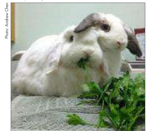
Momo and Candy during a vet visit.