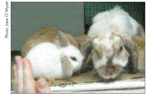
Candy with her mother Trixie and siblings at AC&C.

I had the pleasure of briefly fostering Candy and she is one bunny I will never forget. Though small in stature, Candy's personality was huge. Bold and mischievous, Candy could command attention in a house full of bunnies. Although I am saddened by her sudden loss, I know all who met her will remember her with a smile.