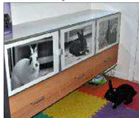
The storage cabinet is suspended.

storage cabinet. It’s suspended off the ground by a wall mount so my bunnies can run underneath it or use it as a hiding place. I used the glass doors as picture frames for my rabbits. Now everyone coming in knows right away that they’ve stepped into the rabbit zone!