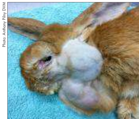
Shelter bunny Asher's dental abscesses before surgery.

Abscesses, or tooth-root infections that progress, are the bane of many rabbit guardians. Extractions may be the only way to treat these conditions. Veterinarians will often start antibiotic therapy before anything else, but surgery is often required.