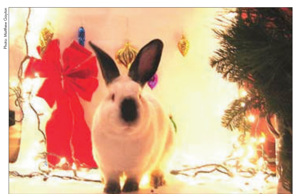
Bobo inspects the tree for hazards.

Go ahead and buy that poinsettia. They're festive and safe. Contrary to popular belief, poinsettias aren't toxic. That, however, doesn't mean they should become part of your bunny's holiday salad. They can cause mild intestinal discomfort if your rabbit has a sensitive stomach.