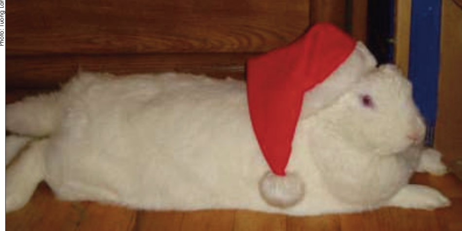
For Santa Binkie, partying was exhausting.

http://www.rabbit.org/faq/sections/travel.html.