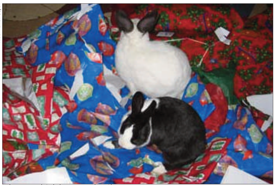
Bobo, top, and Ophelia rip around on Christmas morning.