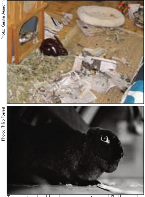
Top, a trashed bedroom, courtesy of Bella and Jerry. Bottom, Maya lurks under futon (see resolution No. 2).

5. I will not chew the back corner of my human's beloved piano, and if she tries