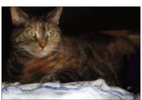
Zoe hiding under the bed, as seen by flashlight.

Many pet-sitting clients don't provide complete written instructions. So when a pet sitter meets clients and their pets for the first time, she will take notes and ask questions. A handful of clients prepare pet-care documents that include medical histories,