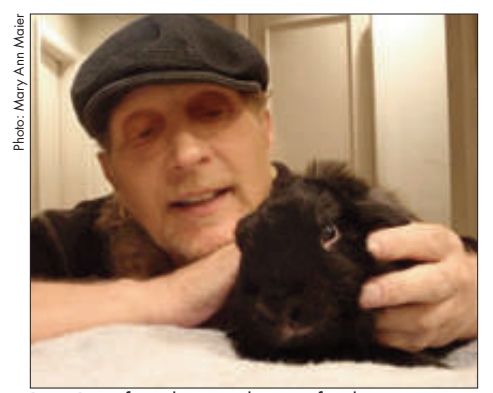
Bam Bam found a new home after being rescued in Elmhurst, N.Y.