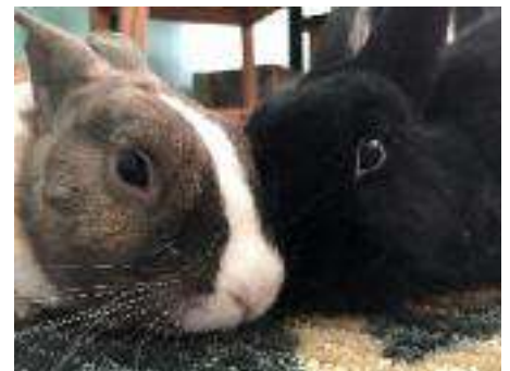
Tuck and Cher, cuddle-buns. "Put down that phone and give us head rubs!"

the door. He loves all people and will sprint around their feet on first greeting. Cher is my little genius. She's thoughtful and seems to analyze new people before she gives them her affection – though she is an absolute cuddler once she does. There isn't a bunny puzzle she can't figure out in a matter of minutes, while