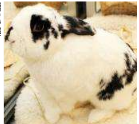
Snoopy with one paw up.