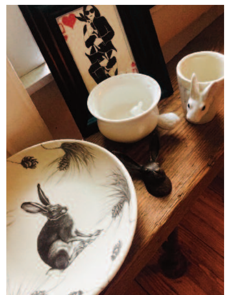
Bunny tchotchkes, a sampling.