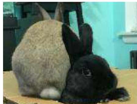
Opposites, but both adore climbing. Here they are exploring the second level of their Maze Haven toy.