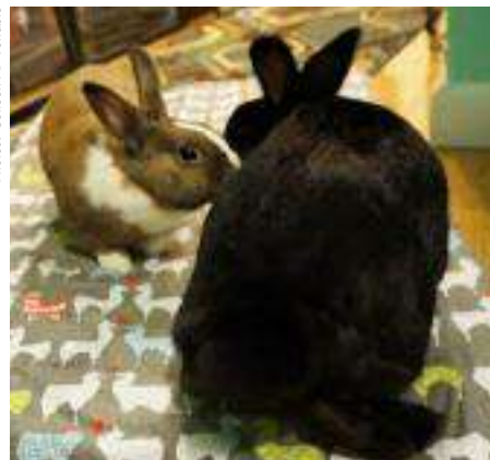
Nervous first day as roomies.