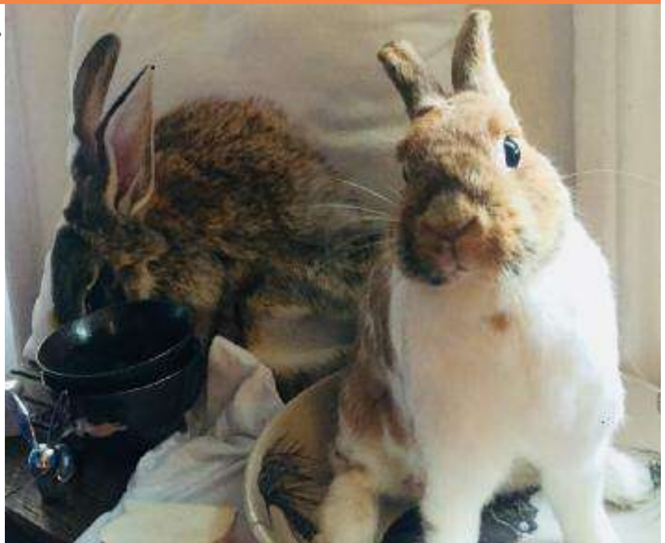
Pippi with bunny tchotchkes.