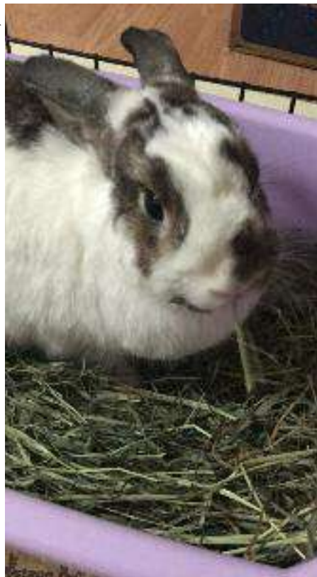
Puff in her litter box.

The first couple of weeks I couldn't even touch the side of her body. She would scratch me aggressively until I backed off. However, after hours of sitting with her each day, she's comfortable with me