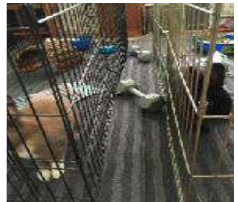
The bonding period setup. Weights were necessary because Cher is STRONG.