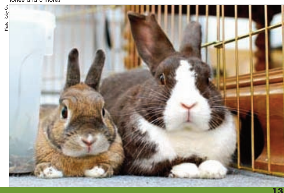
Toffee and S'mores

It took six long months, but it was worth every minute to see them so happy together. When S'mores first came to live with us, all he wanted to do was nap, but now he has learned the "how-to-approach-without-sound-and-trip-human" technique from Toffee. Toffee was never really into food. But now with S'mores, she finishes every last bit of her salad and pellets. Just the sight of them sitting together in their big litter box and munching on hay together ... this is what Heaven must be like!