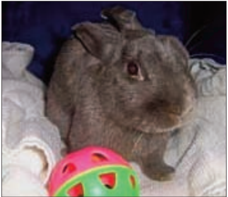
Bert, top, and Logan, the bunnies who spent the last year and a half in small cages kept in a truck-repair shop, are amazingly people-friendly and lovable. They hope to be adopted soon so they can catch up on playing and binkying in homes of their own.