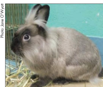
Among the rabbits who were adopted on July 3 were Hermione, Connor and Nicolas.