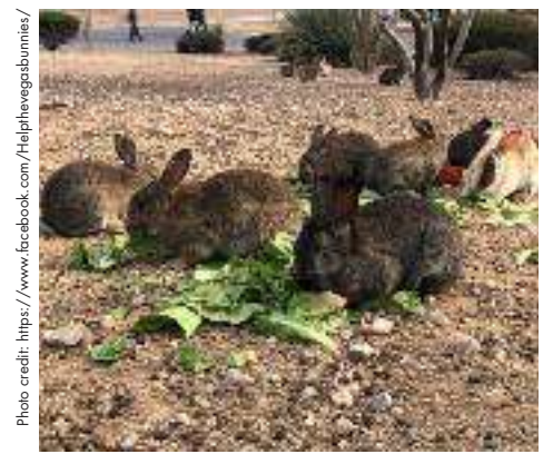
A large number of domesticated rabbits have been abandoned outside in Las Vegas.

This already overwhelming situation became an emergency on Feb. 18, when horrified volunteers discovered many rabbits dead at the dumpsite. Witnesses report seeing an individual drive up in a car and throw antifreeze-soaked lettuce to the rabbits, ostensibly in an attempt to poison them. A necropsy report later revealed that the rabbits had further