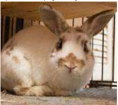
Ripley, rescued in Farmingdale, is available for adoption.