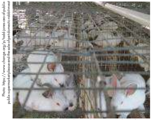
Publix Supermarket is selling rabbit meat.

Sadly, the consumption of rabbit meat is still painfully common and even looks to be growing in prevalence. Recently, the Rabbit Advocacy Network ("RAN") brought to light the shocking magnitude of Publix Supermarket's sale of frozen rabbit meat; roughly 65% of their 1,152