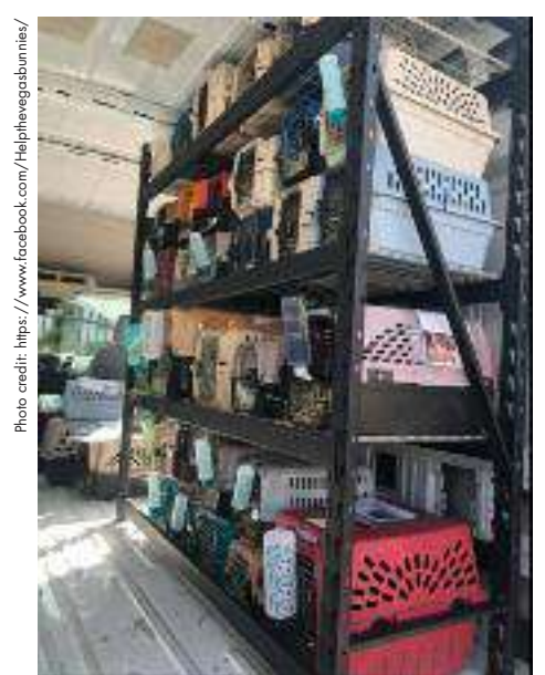
Donations and supplies are urgently needed for the rescue effort.

suffered significant acute trauma. Although responsibility for the attack remains unclear – the City of Las Vegas Government has made a formal statement that they had no involvement in the attacks – the deaths came merely days after the Department of Health posted a notice at the site inaccurately suggesting that rabbits could be the carriers of diseases transmissible to humans. At the request of rescuers who feared the spread of this misinformation, the rabbits were tested for disease at the