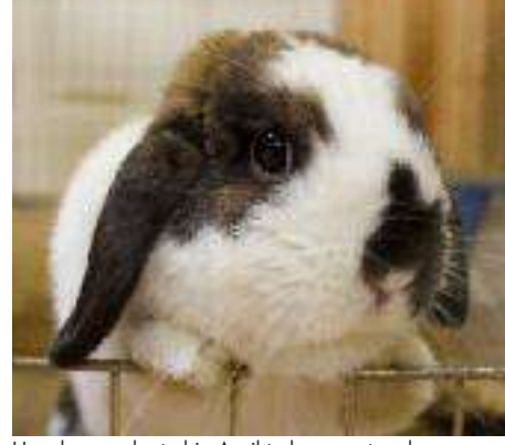
Hazel was adopted in April to be a partner bun.