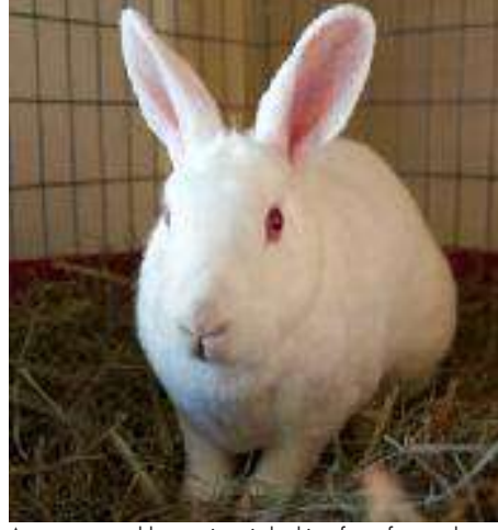
Aspen, rescued last spring, is looking for a forever home.