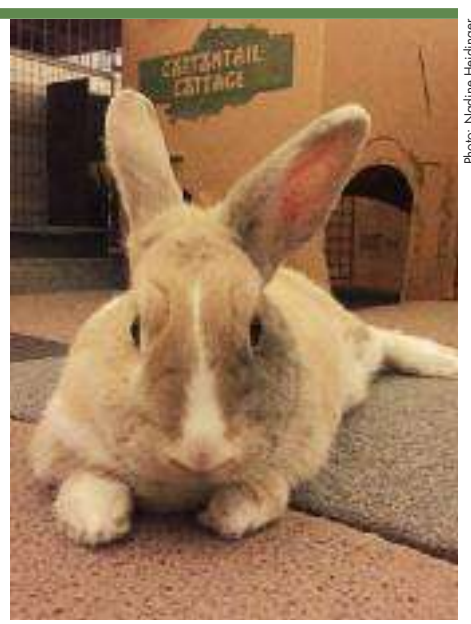
Butter on FLOR carpet squares.

Sorry for the delayed response, but I was cleaning. So I have a confession to make. I'm perfect. Nah, just kidding, I'm an addict, not of chocolate or @badass_bunny_rescuer's Instagram account (though I should be; that lady is hilarious!) but of cleaning. I own two Dyson "pet" vacuum cleaners, one cordless (V8 Animal) and one upright (Ball Animal). Both come with additions that get the hay and fur out of all sorts of places and off of most surfaces. We all know those stray poops that happen to roll under the couch, and the hay that you find and just don't know how it got