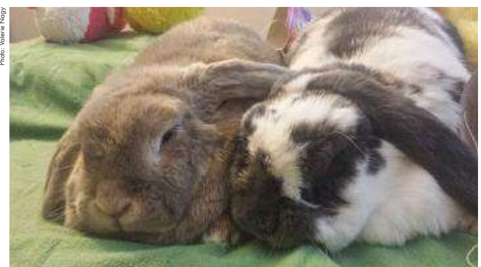
Hunny and Lucky.

The days after such a loss are very hard. You look for your rabbit – in my case, I