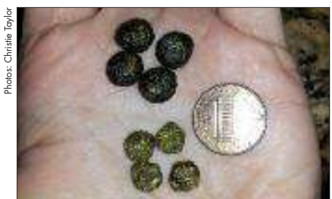
Normal fecal pellets

When we ask for details, we often learn that not only did the bunny stop eating,