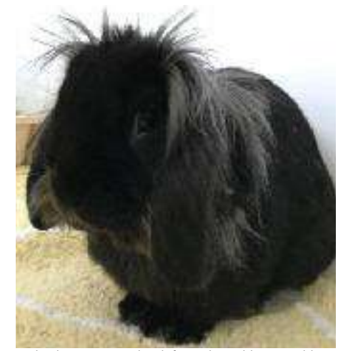
Midnight was rescued with four other rabbits in Baldwin.