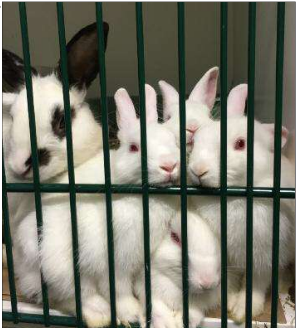
Salt&Pepper (mom) and her babies Chevron, Stitch, Chequer and Batik.