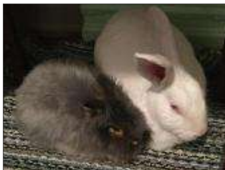
Iggy and Mona.

Iggy and Mona are a bonded pair currently in foster care. Iggy is a small, gray Jersey Wooly and Mona is a large New Zealand White. Mona is easygoing and very approachable, and an all-around sweet girl. Iggy is sweet but very shy and should be approached gently – but when he's with Mona he's a little more outgoing. They'll flourish as a couple in the right home. Iggy has been neutered and Mona has been spayed. For more information and/or to arrange a meeting with Iggy and Mona, please email nyc.metro.rabbits@gmail.com .