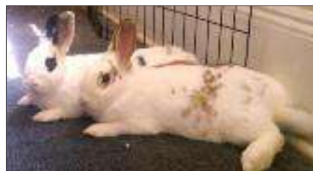
Cruise and Mandy.

Mandy and Cruise are a bonded mother-son pair of English Spot rabbits. Mandy is the larger bunny with lighter markings, and Cruise has the darker markings. They are curious, friendly, and enjoy being petted. Both are full of young bunny energy and need a home where they will receive lots of exercise time, enrichment and affection. Mandy and Cruise are currently living in a foster home. Mandy has been spayed and Cruise has been