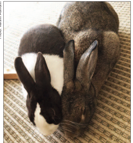
Dutchess and Moondog.