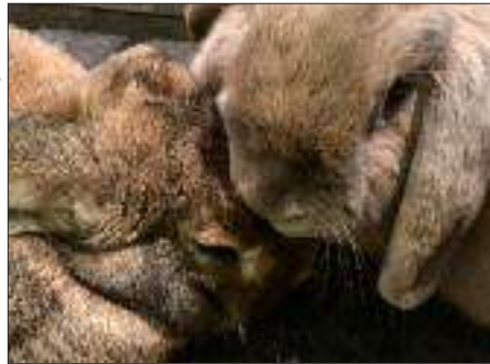
Bear and Daisy, snuggling.