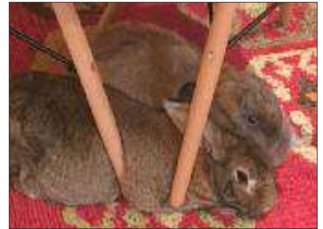
Bear and Daisy at home.

Daisy has lots of room to run about and play in the kitchen and hallway all day, but she loves running around the whole apartment and often sits at the baby