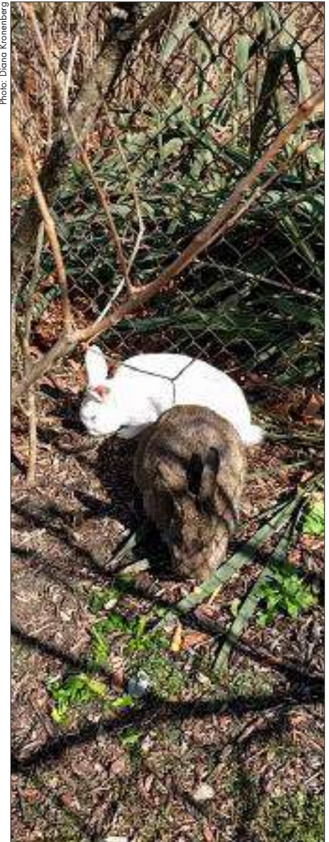
Scooter (white) and Nellie (agouti).

Group, was looking for volunteers to go out and catch the rabbits. I offered to do what I could.