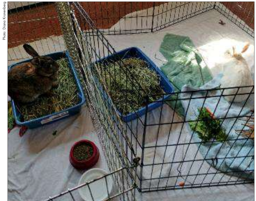
Nellie and Scooter indoors.

Fortunately, Nellie did not appear to be pregnant. We certainly didn't want this double rescue to turn into a much larger one. Both buns stayed the night at the vet, got cleaned up and were given some medication. Nellie ultimately was spayed. Then, just under three weeks after her