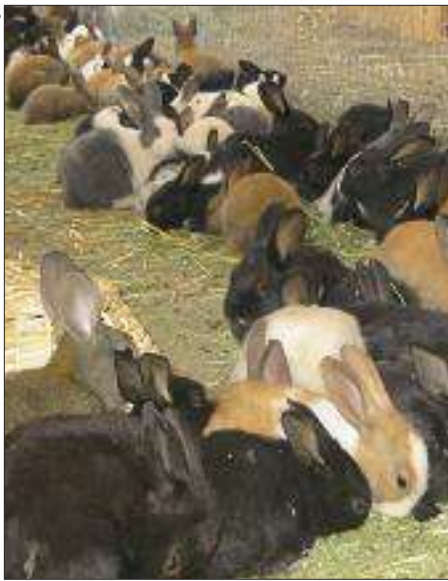
Best Friends' "Great Bunny Rescue" of 2006.

Since unspayed rabbits generally have a shorter lifespan than unspayed cats, it might be unrealistic to expect a female to live a full seven years if she's reproducing at that rate. Even so, the descendants of that initial female, reproduction left unchecked, are quite capable of bringing that number into the millions in only a few years. (Darwin was right.)