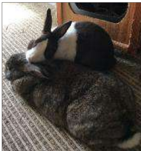
Dutchess grooms Moondog.

before heading to a job in the city, was especially heartless.