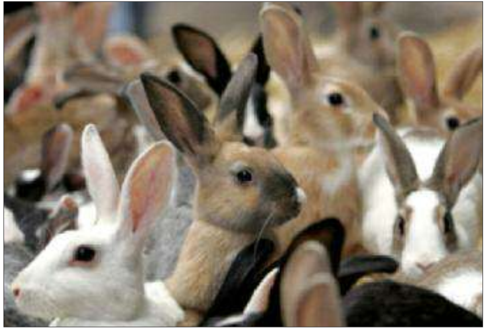
Rabbits have an amazing capacity for reproduction. This is their main defense against extinction.

Do the bunnies of the world a favor: have your companion rabbit spayed or neutered.