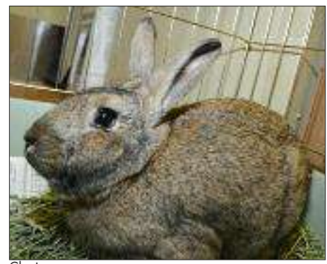
(Continued on page 11)