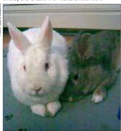
Chessie and Smokey.

When we finally arrived in Los Angeles this past July, she settled in with no trouble at all. Today everyone is doing fine--especially Chessie, who loves to nap in the California sun's rays that always stream through our window.