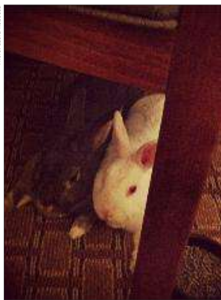
Smokey and Chessie in a Nebraska hotel room.

It took us seven days to make the trip because we didn't want to keep the rabbits in the car for too long. In the evening, Chessie and Smokey had a chance to stretch out on some fine hotel carpeting. What I remember most about the trip is how Chess took it in stride compared to the other rabbits. The whole time she sat up and watched out the car window, chewing a stalk of hay and with her ears alert. For her, it was a real adventure.