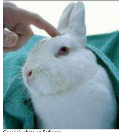
Chessie's photo on Petfinder.

Fast forward to 2012, and there was a major turn of events: We decided, due to a number of factors, that we needed to move to Los Angeles. By now our family had grown to four rescued rabbits, and we agonized for weeks over how we