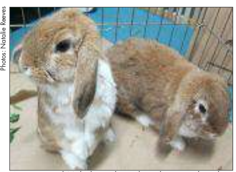
Harmony and Melody in photo shared on social media.

It can be particularly difficult to photograph bonded pairs. My goal is that any photo I use of bonded bunnies should show them interacting or show their closeness. For example, we recently had an adorable bonded pair of girls at the shelter named Harmony and Melody who obviously loved each other. Despite their mutual affection, when out for play at the shelter they weren't always moving in the same direction. But I finally did get them together in a photo. (see below)