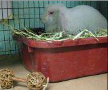
Shelter bunnies with their new toys.