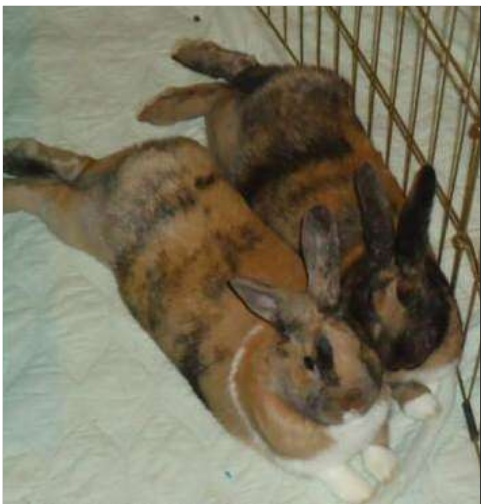
Sophia and Duke.

Sophia was the biggest of her litter and she still has a few ounces on her brother. Duke, but that is just one of the differences between these two bunnies. Sophia is outgoing and tends to be a bit of a daredevil. Playful and sweet, she is the first to try new foods and investigate new toys. Sophia would be quite content with a new family that has time to give her all the back rubs she deserves and when you least expect it, she will reward you with a soft bunny kiss. Duke is more cautious. He approaches each new situation with healthy skepticism and takes on challenges when he is ready. Before he decides to run through a new tunnel, he has probably measured it for length and read online reviews to make sure it is safe for bunnies. Duke is