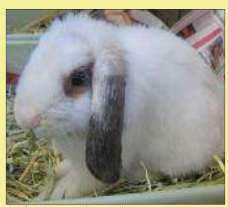
Candy in a recent photograph.

and have been spayed/neutered. They love to eat hay, and they have tried (and liked) every green on the bunny-safe list.