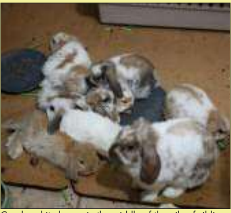
Candy, white bunny in the middle of the pile of siblings. In the foreground is Trixie, mother of them all.