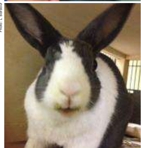
Sophie loves greens!

She needed an enucleation, or eye removal. I had seen this done before, in the tiny and beloved rabbits Marge and Hunter-except in both of those cases, I didn't see the rabbits until quite a bit after the procedure. By then, they looked like teddy bears whose button eye had fallen off. When I picked up Sophie following the procedure, one side of her face was