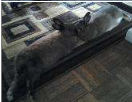
Ponponne re-arranging the sofa cushions at home. Biscotte and Ponponne snoozing.

then faced one last hurdle, customs. I was directed to the line for secondary inspection. The officer looked exasperated and just asked me, "What food are you trying to bring in?" Uh, no food, officer. Just two rabbits. That surprised him! He checked their papers and passport, and we were cleared to leave.