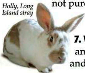
Holly, Long Island stray

7. Variety & Choices: We have wonderful bunnies of all types, sizes, ages. At any given time, we have access to far more choices than any pet store, and we have the training and desire to help you find the right one for you.