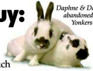
Daphne & Dasher, abandoned in Yonkers

1. Health: Rabbits that are sold by pet stores or breeders often have infectious diseases (such as coccidia, which can cause life-threatening diarrhea) due to unsanitary breeding facilities, unnatural levels of stress, inadequate nutrition, and needless antibiotics that suppress good bacteria. Often, illnesses are not detected until weeks after onset, after the rabbit's been purchased by unsuspecting customers who are then left to pay huge medical bills and/or end up with a rabbit who dies shortly after being brought home.