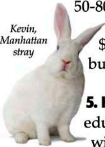
Kevin, Manhattan stray

have been altered, so you not only don't have to spend the $200 to $400 surgery cost, you don't have to deal with the bunny's recovery from the operation, either.