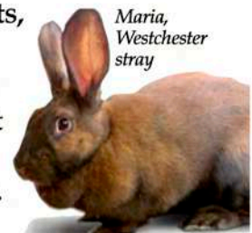
Maria, Westchester stray

7. Variety & Choices: We have wonderful bunnies of all types, sizes, ages. At any given time, we have access to far more choices than any pet store, and we have the training and desire to help you find the right one for you.