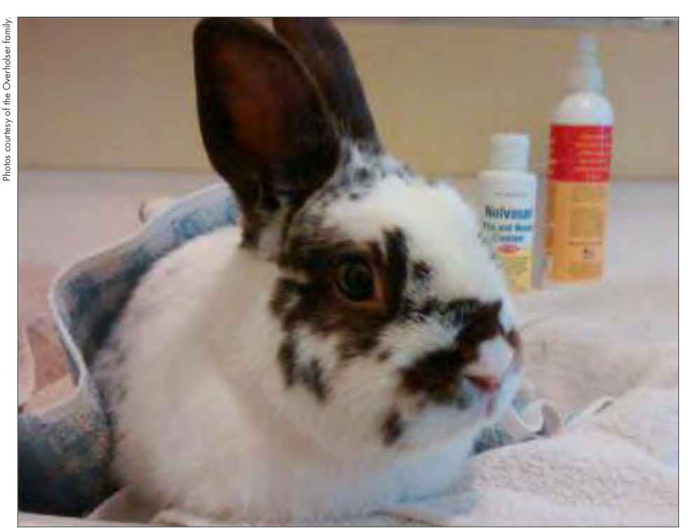
Jasper's butt bath time.

Mom came up with a plan to make my life more interesting. She got a box with handles on it and lined it with soft