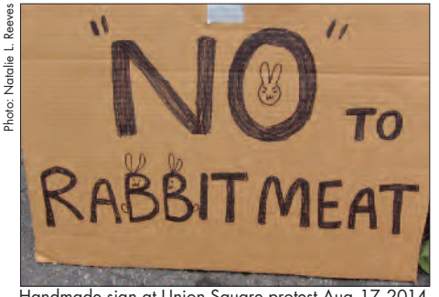
Handmade sign at Union Square protest Aug. 17, 2014.

Whole Foods Market Inc., the naturalfoods grocer, said it would end the sale of rabbit meat at all its stores nationwide.