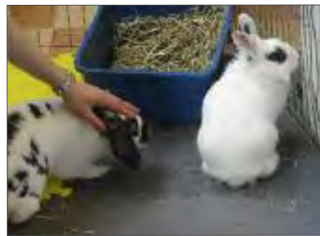
Benny and Bea during their speed date.

But the tumor was every bit as aggressive as the vet said it would be. When he