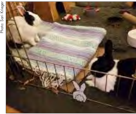
Franklin and Eleanor in their pen.

Franklin and Eleanor are now living happily ever after in their big pen. Like the famous couple of history, these two bunnies are a memorable matchup.