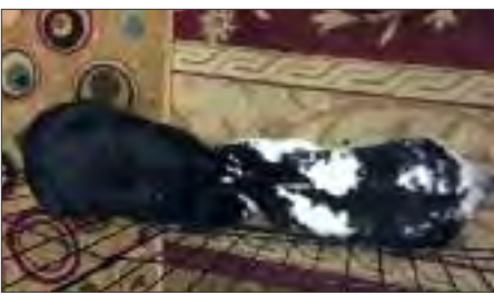
Spirit and Luna

We are being VERY PATIENT with the bonding process. At first Spirit was very afraid, and Luna was biting. She was adopted a week after she was spayed, so perhaps her condition made her overprotective or defensive – although