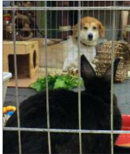
Vanessa calmly watches a dog.