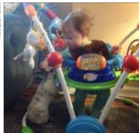
Marbles and Lily.