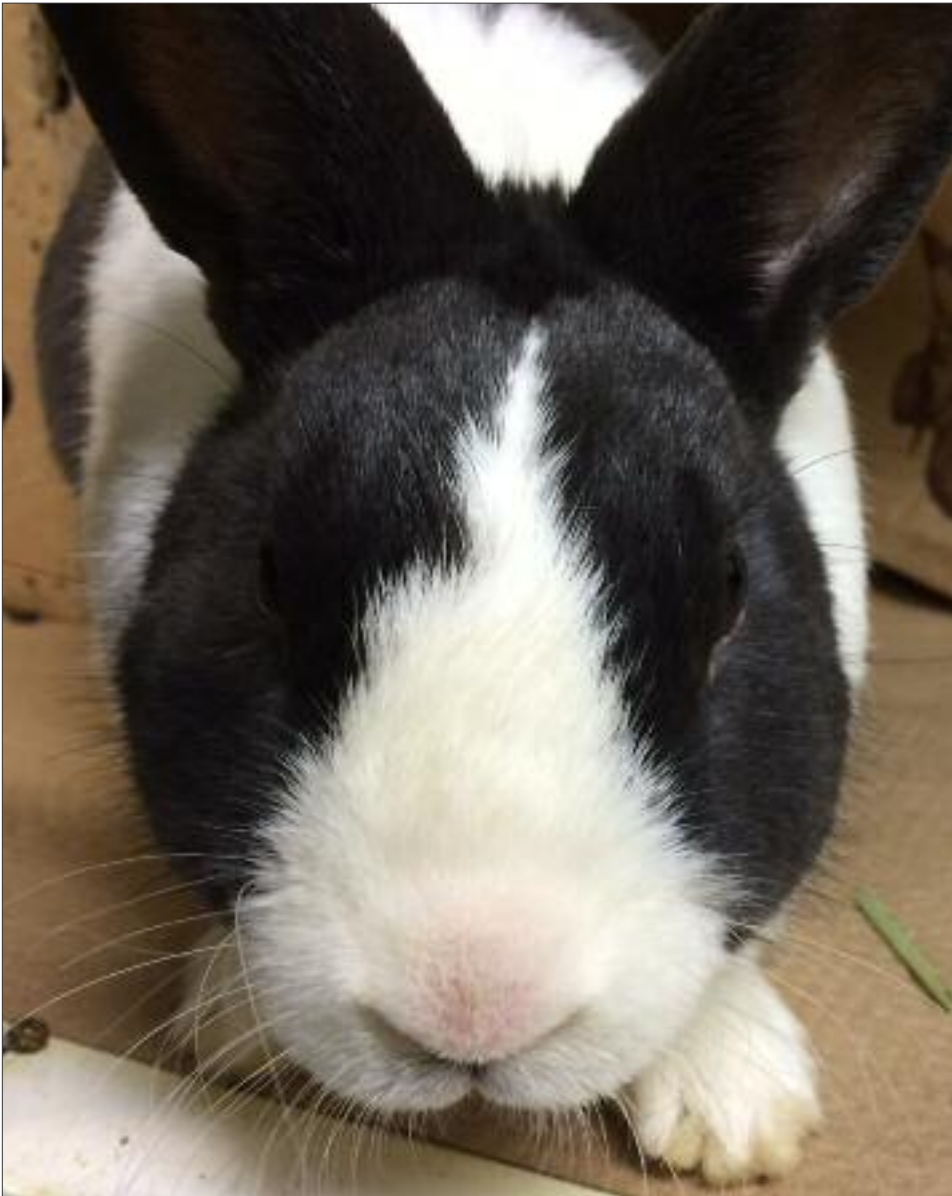
▲ Thumper. ▼ Queen.