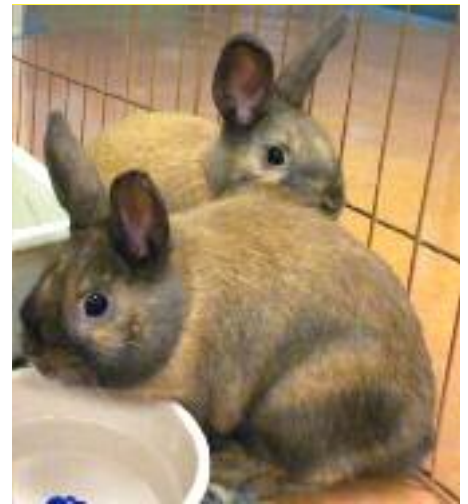
Baxter and Quincy at Maddie’s Pet Adoption Days.