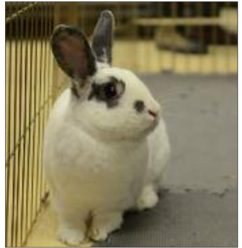
▲ Charlie Girl aka Charlene. ▼ Herbie.