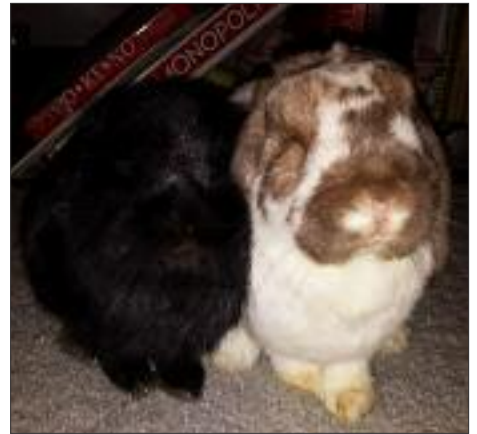
Scribble and Trixie.