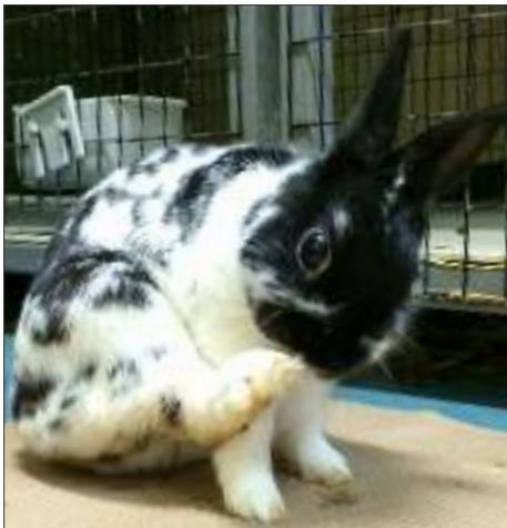
▲ Dark Cloud. ▼ Coco.