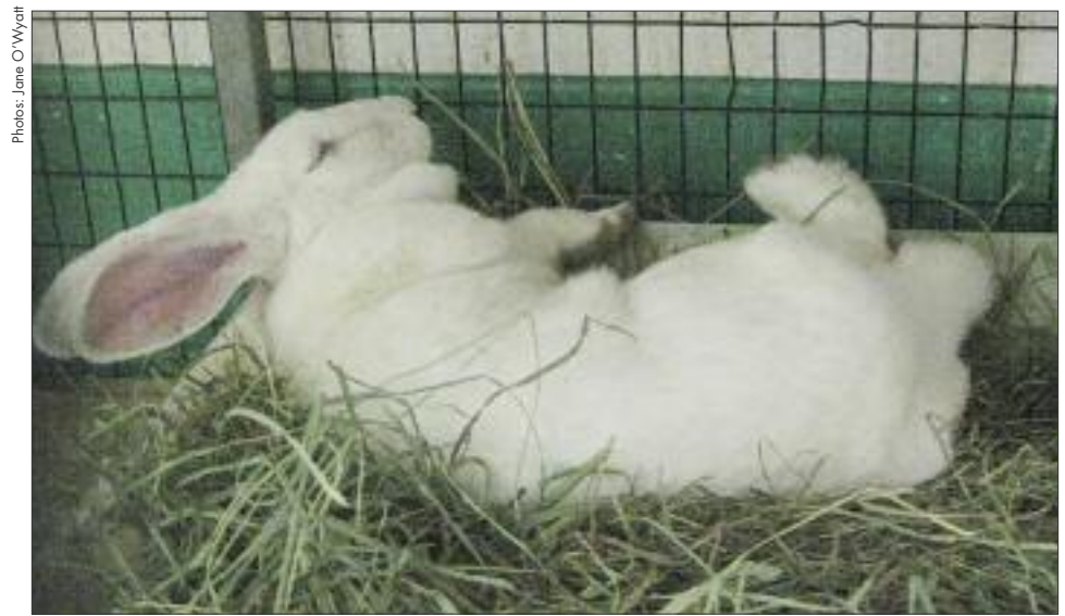
Sleeping Beauty at AC&C.

Since I did a weekly volunteer shift in the afternoons, I helped to place countless arrivals into clean cages with salads, rabbit pellets, water bowls and litter boxes. It was heartening to watch these