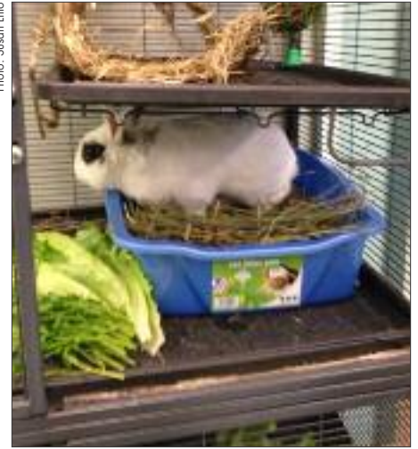
Pinto in her cage at the West 117th Street Petland Discounts store.