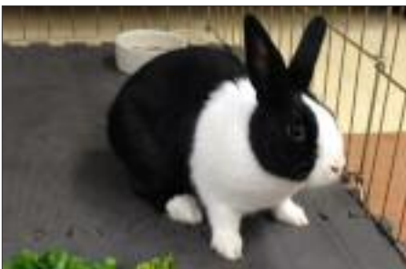
▲ Sassy was adopted. ▼ Maxine and admirers.