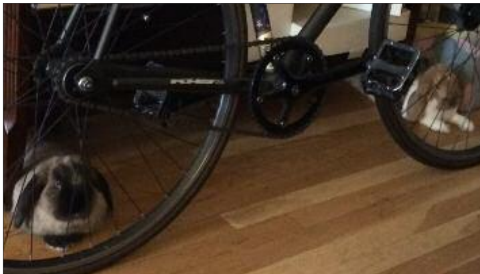
Pixie and Stanley.

It's so cute! He loves his cage and really made himself at home here. I think he likes us, too. He's still shy about being petted but is slowly letting us give him a stroke or two.