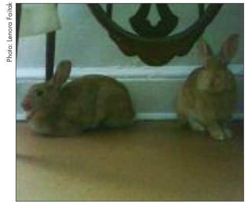
Dixie Do and Bosco Bean.