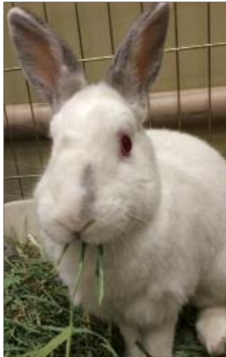
The meaning of hay...?

are: "The wise bunny knows we rarely see things as they are; we see them as we believe them to be," or "Bunnies hop. It is neither good nor bad; it simply is." One of my personal favorites is, "Every hop we hop resonates throughout the entire universe."