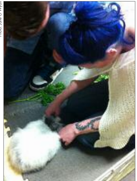
Motin with his adopters.