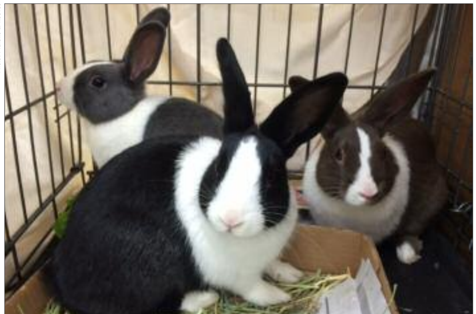
Dutch litter mates.