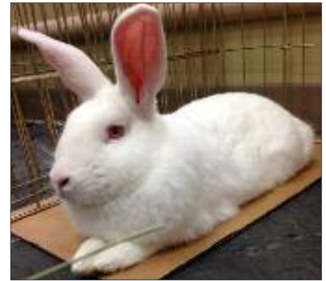
At peace with bunniness.

"Bunny Buddhism" is something to keep by your side to guide you throughout