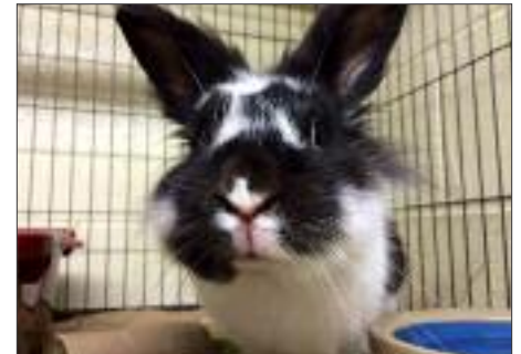
Zoro's "Adopt Me!" photo on Facebook.

I adopted my bun, Zoro (formerly Bruno), from Manhattan ACC and July 20 was our two-year anniversary since the adoption.