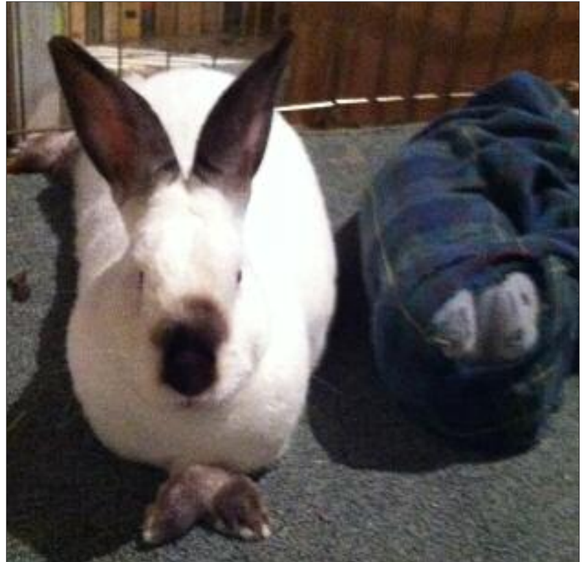
Hardy, with a frozen water bottle wrapped in a pillow case.