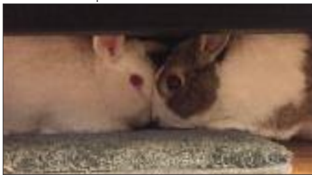
Chequer and Chunk.

Things have been a mixture of excitement and chaos with our new addition but everything is calming down now! The bunny bonding process was very