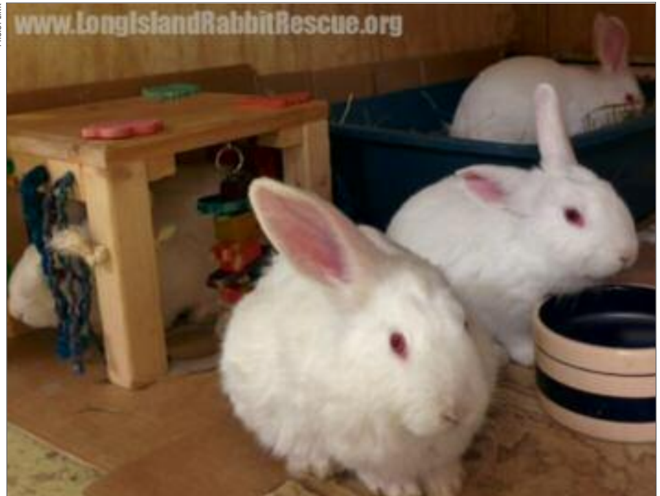
This photo of the rabbits was taken within the first weeks after their rescue.

I was at their foster home just two days ago. I sat on the floor outside of their pen for over an hour, transfixed by their beauty, trying to tell them apart (which