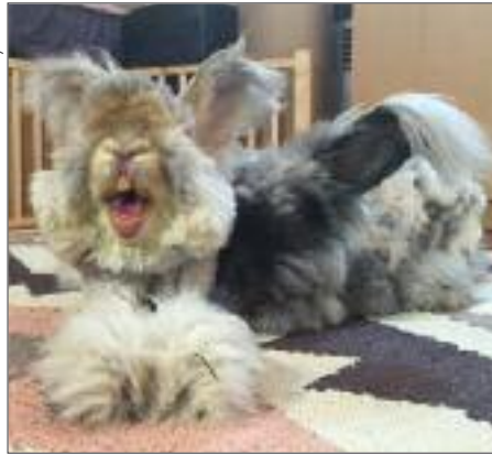
Wally with Suki.

my specific intention to pair Wally with another Angora, but I was delighted at the thought of four fluffy ears bouncing around my room. I contacted the shelter and scheduled a visit the following Sunday, May 15.