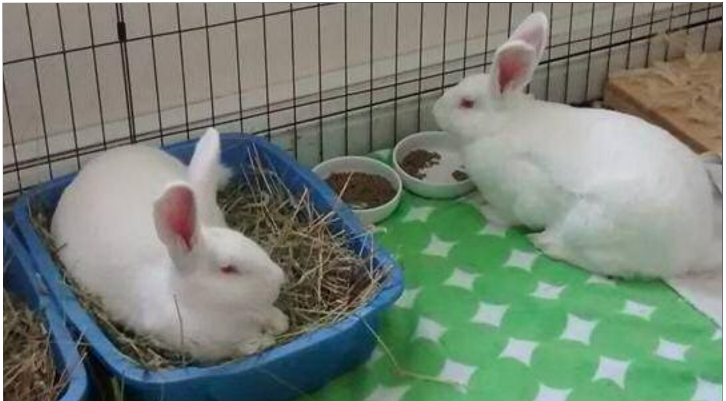
Chloe and Portia in their foster home.