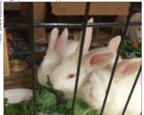
Baldwin Harbor Five (pages 6-7) baby bunnies eating fresh greens.

you (including fresh-grown garden herbs such as tarragon and various mints, with the exception of Pennyroyal) are good for a rabbit. Experiment and see which types your rabbit likes best! Rabbits love fresh, fragrant herbs from the garden.