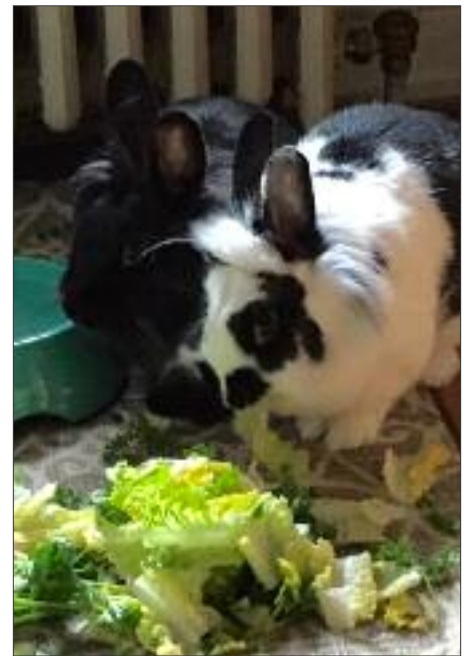
Sugarplum and Pineapple.

Fresh, moist greens are about as important as hay in maintaining a healthy intestine. Try broccoli, dark leaf lettuces, kale, parsley, carrot tops, endive, escarole, dill, basil, mint, cilantro, spinach. Almost any green, leafy vegetable that’s good for