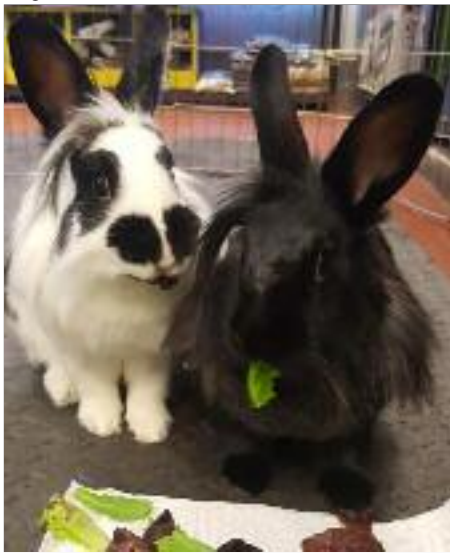
Pineapple and Sugarplum.

were born in the shelter last year as part of a litter of five babies, before we took the whole young family into our rescue. Their mother, two sisters and brother have all been adopted and now it's their turn. Pineapple is a stunning black and white, while Sugarplum is a sleek black. Both ladies have amazing manes of hair that they keep groomed nicely! These girls have tons of energy and are a joy to watch while they exercise, as they run and binky with reckless abandon! They have been spayed and are living in foster care. If you are interested in adopting Pineapple and Sugarplum, please email nyc.metro.rabbits@gmail.com