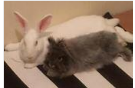
Mona and Iggy.

but when he's with Mona he's a little more outgoing. They'll flourish as a couple in the right home. Iggy has been neutered and Mona has been spayed. For more information and/or to arrange a meeting with Iggy and Mona, please email nyc.metro.rabbits@gmail.com .