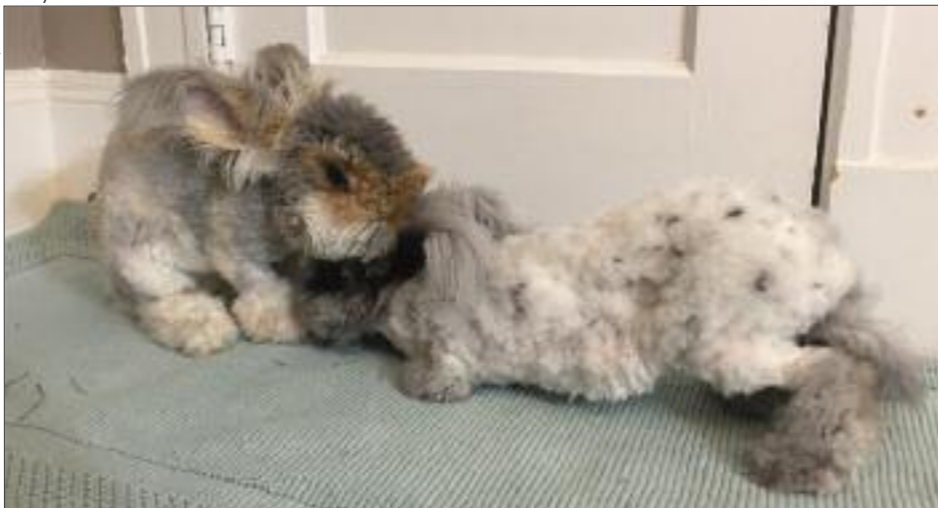
Wally and Suki.

Prior to Suki's arrival, Wally often spent much of the night on my bed, flopping next to my pillow or standing guard like an owl at the foot of the bed. But because Suki is passionate about marking my bed, neither bunny has nighttime access. It would be different if Suki was willing to wash the sheets every morning, but she's not. And until there's a device that can determine a bunny's identity via paw-scan, there's no way to only grant Wally access. But the benefits of Wally's new companionship are significantly more important than my midnight bunny snuggles. And now, I have the privilege of snuggling between two bunnies on the floor. I'm pretty lucky, because there's nothing more magical than being at the center of a Wally and Suki bunny-sandwich.