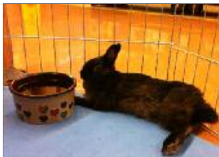
Vanessa at Petco Union Square.

Please don't make the mistake of serving less-than-fresh vegetables to your rabbit. A rabbit is even more sensitive to spoiled food than a human is. If the vegetables smell stale or are "on the fringe," they could make your bunny sick. Follow the Emerald Rule of Freshness when feeding your rabbit friend: "Don't Feed It to Your Bunny if You Wouldn't Eat It Yourself."