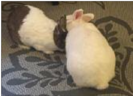
Chunk and Chequer.