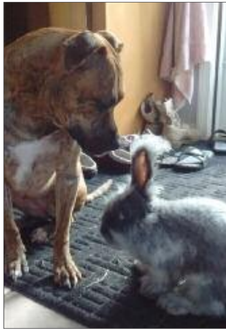
Apple Pie and Calvin.