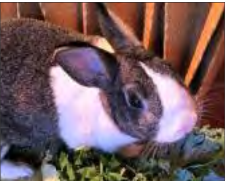
Teandra aka Little T