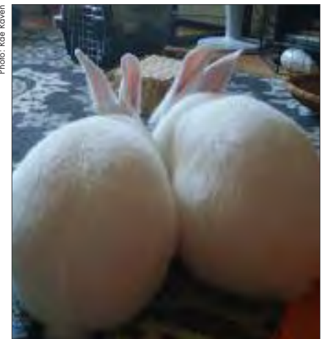
Madison and Theodore

When we had the date with Theodore, Madison seemed very interested and the bunnies attempted to cuddle a little. I do not know if they recognized each