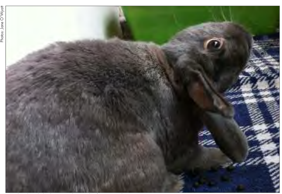
Buggles' head-tilted view is the result of E. cuniculi.

Rabbits, too, have small retinal areas with more cones than rods. However, this area centralis is not indented, and it has far lower cone density than our fovea has. The image formed by the area centralis is relatively "grainy" compared to the one formed by your fovea, but it serves the rabbit well. Using this image, your voice, body movements and scent