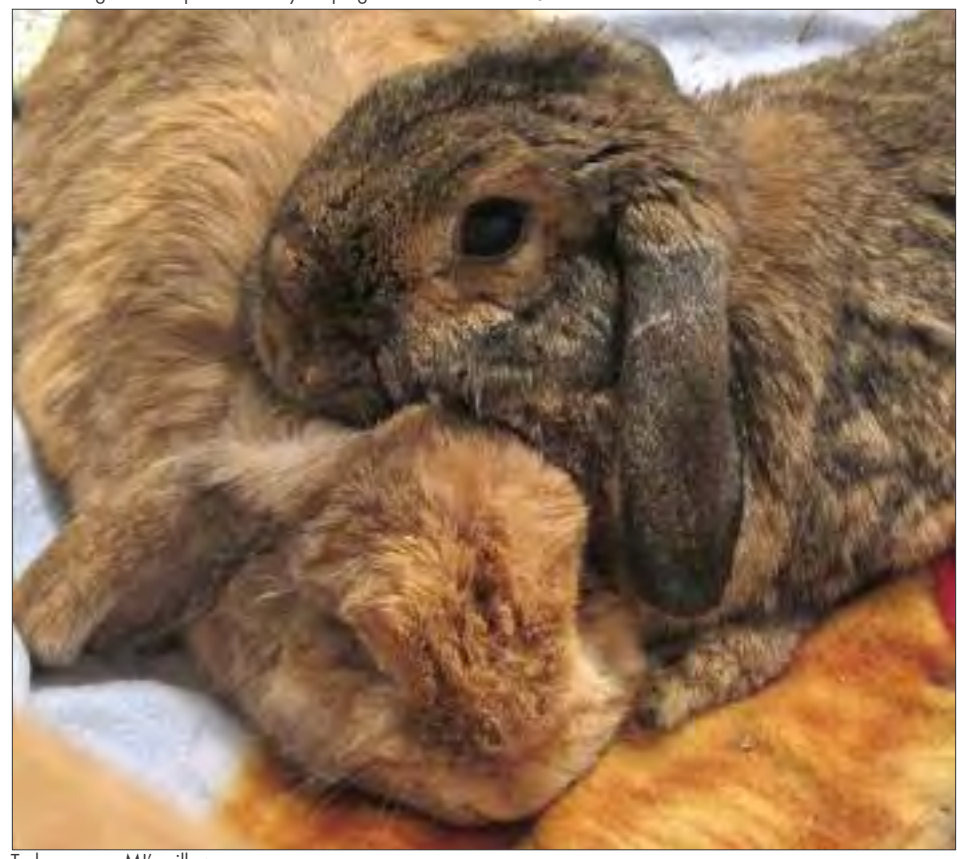
Tad serves as M's pillow.

Depot for about $5. I top the tray with a towel, with the natural slope of the tray making it easier for me to lower Mopsy's bottom into the area where the water is. I place the tray on the floor where I sit while giving her a gentle bath,