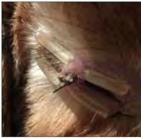
Dec. 6, 2014. Right eye was sutured to protect it and to allow administration of ophthalmic medication.