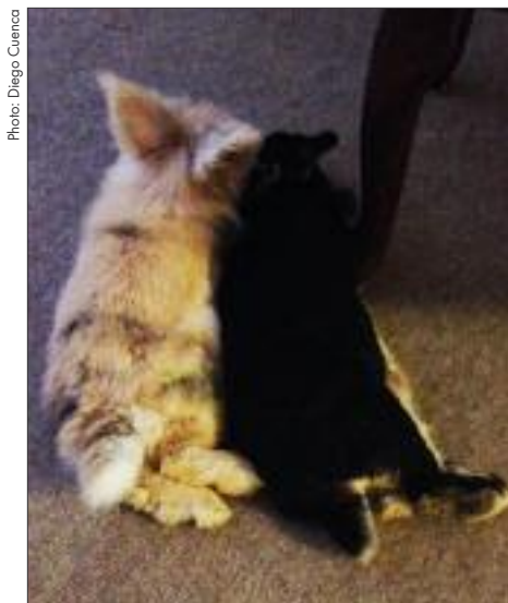
Doc and Lady Bug.

The initial meeting between the two rabbits involved a lot of ignoring, and as anyone who has bonded bunnies knows, this is a good sign! We brought Sheldon, now nicknamed Doc for his Dr. Seuss moustache, home on May 2, and the bonding began. At the start, the bunnies were living side by side in neighboring cages, separated by a heavy textbook. This was to allow both bunnies to see and smell each other, without being able to push their cages closer and risk unsupervised physical contact. We “swapped cages” every night, allowing them to get used to living in a space that smelled, or “belonged” to the other rabbit.