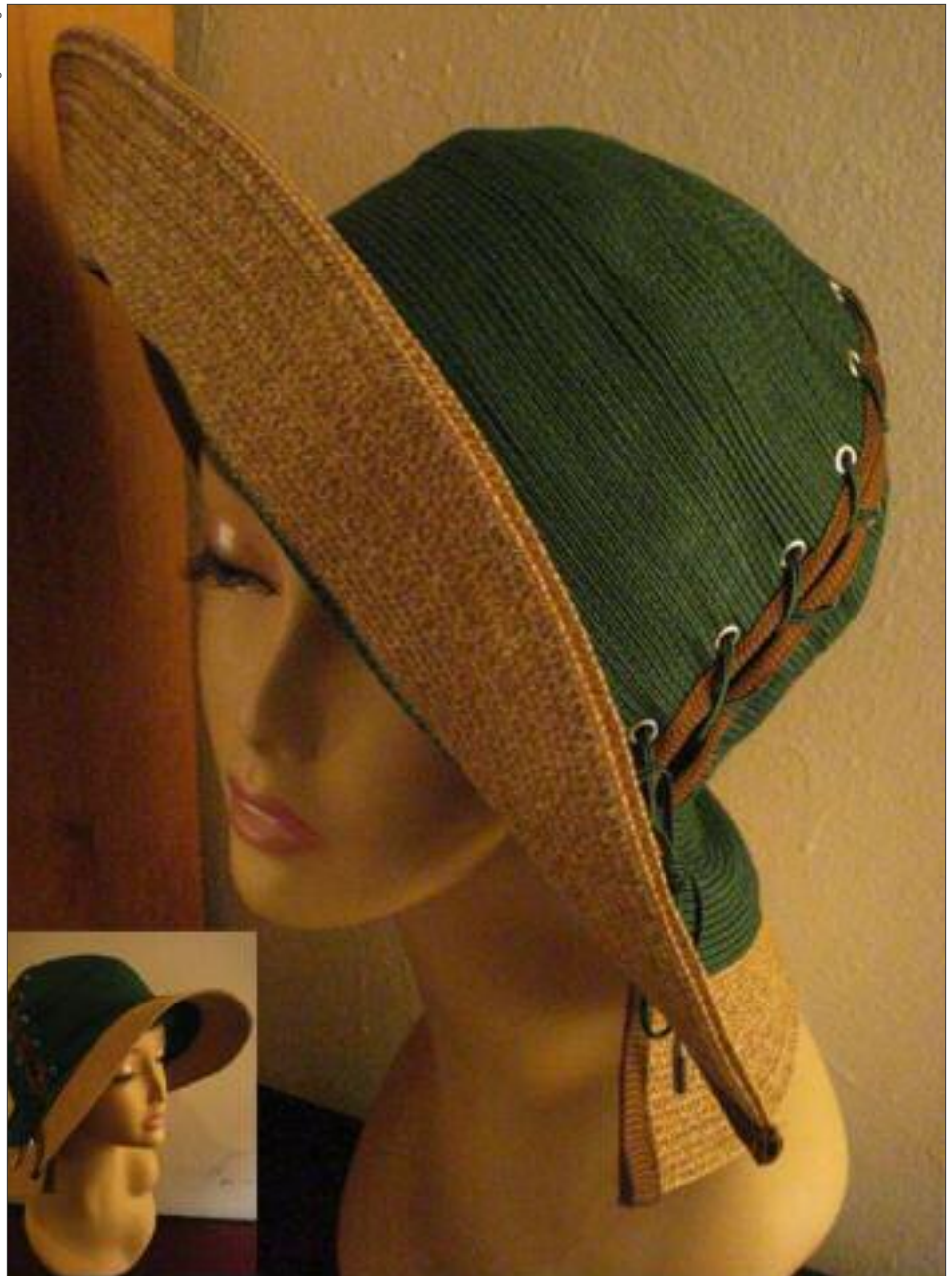
This hat was auctioned on Facebook.