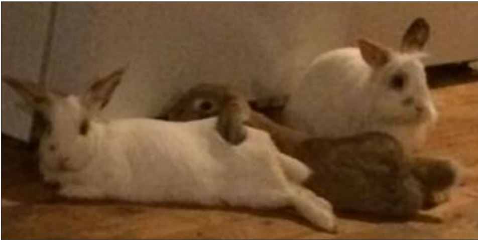
Rudy, Puddles and Rusty in front of the fridge.