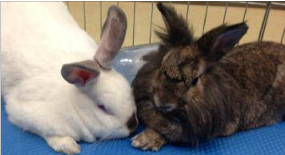
Juliet and Romeo.