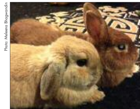
Simba and Nala.