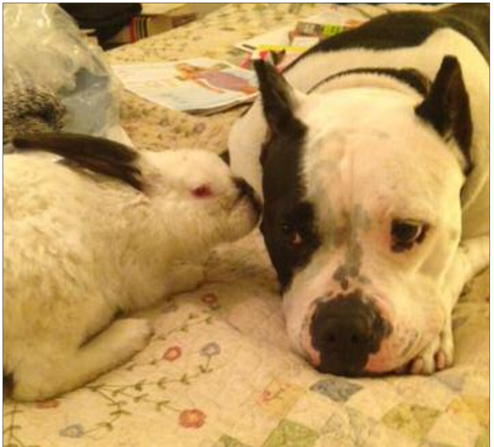
Cotton and Amelia.