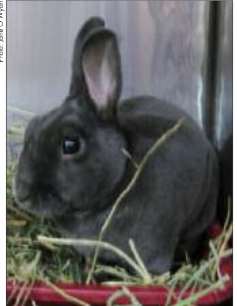
Rex rabbits are said to be less allergenic than other breeds.