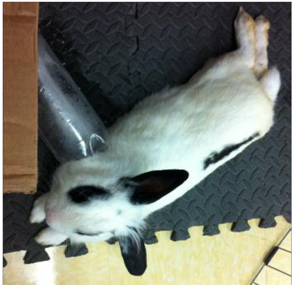
Ronan with frozen water bottle at Petco.