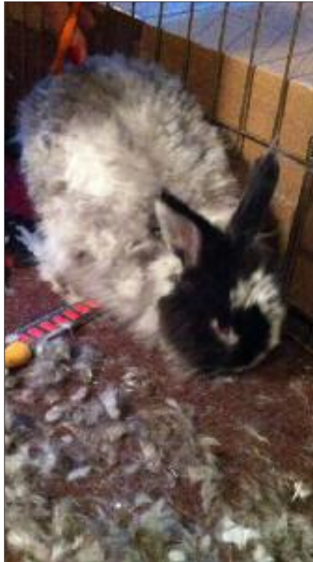
Jan. 9: Starting with an overall trim.