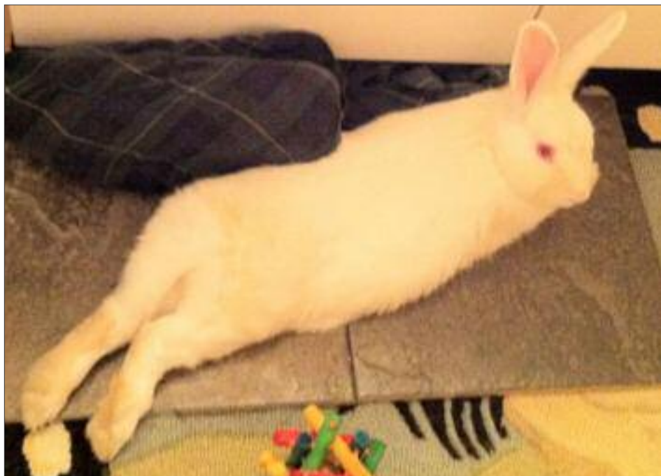
Lola on ceramic tiles with frozen water bottle.