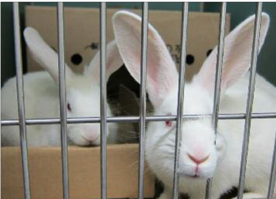
Thea and Temple.