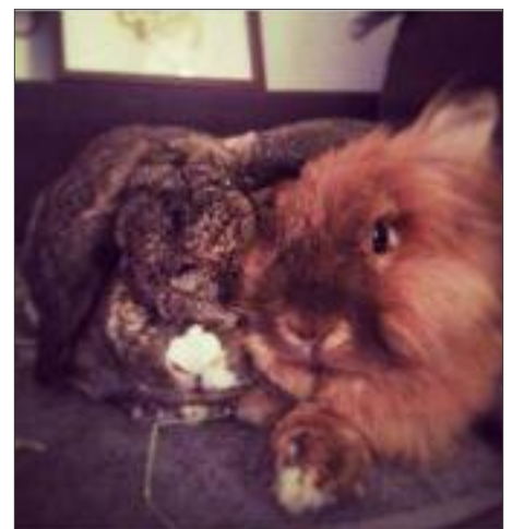
Polly and Bronco.

I will always miss our little Polly, but I am so grateful that I had the chance to love her and give her a good home, and that she had a chance to love Bronco. Thank you so much to all of the NYC Metro Rabbit and Rabbit Rescue & Rehab volunteers for the adoption work that you do, and for pairing me up with my lovely old bun.