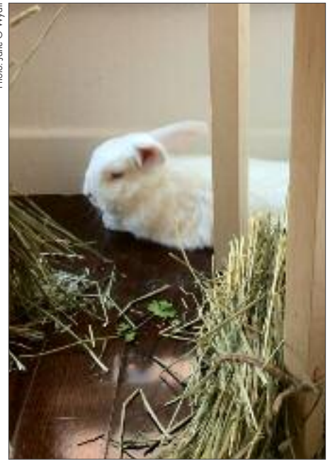
This bunny's people give her additional hay for foraging.