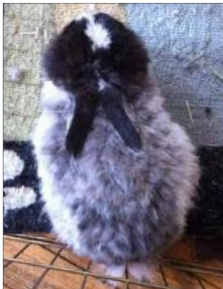
Feb. 5: Is this the same bunny?