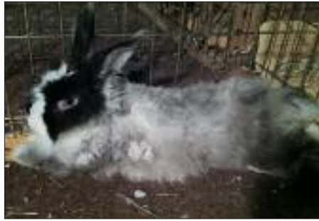
Jan. 9: A large mass of matted fur around Greyson's neck and chest felt like an enormous collar of thick, multilayered boiled wool glued to Greyson's skin. Getting at these mats was tricky.