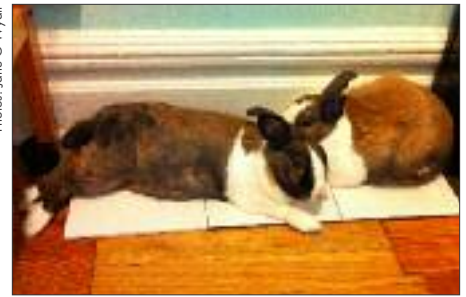
Arnie and Lizzie cool off on ceramic tiles.