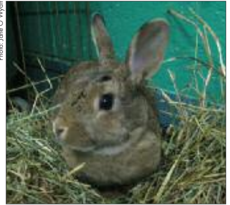
Bullet fka Twinkle at AC&C.