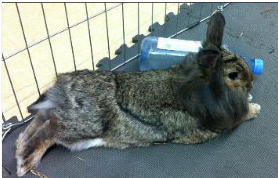
Romeo with frozen water bottle at Petco.