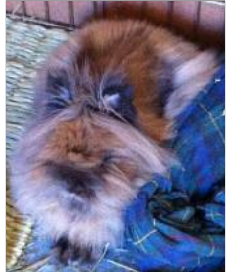
Magnolia next to her frozen water bottle (in pillowcase).