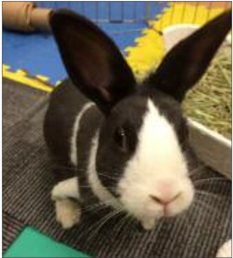
Dancing around. Happy as can bebe.

The lucky human who shares his or her life with Bebe will reap rewards daily. For just a little bit of extra care to provide Bebe with a safe and controlled environment, she will share her lust for life and love with you. She will show her gratitude for your love, and your bond will grow stronger every day.