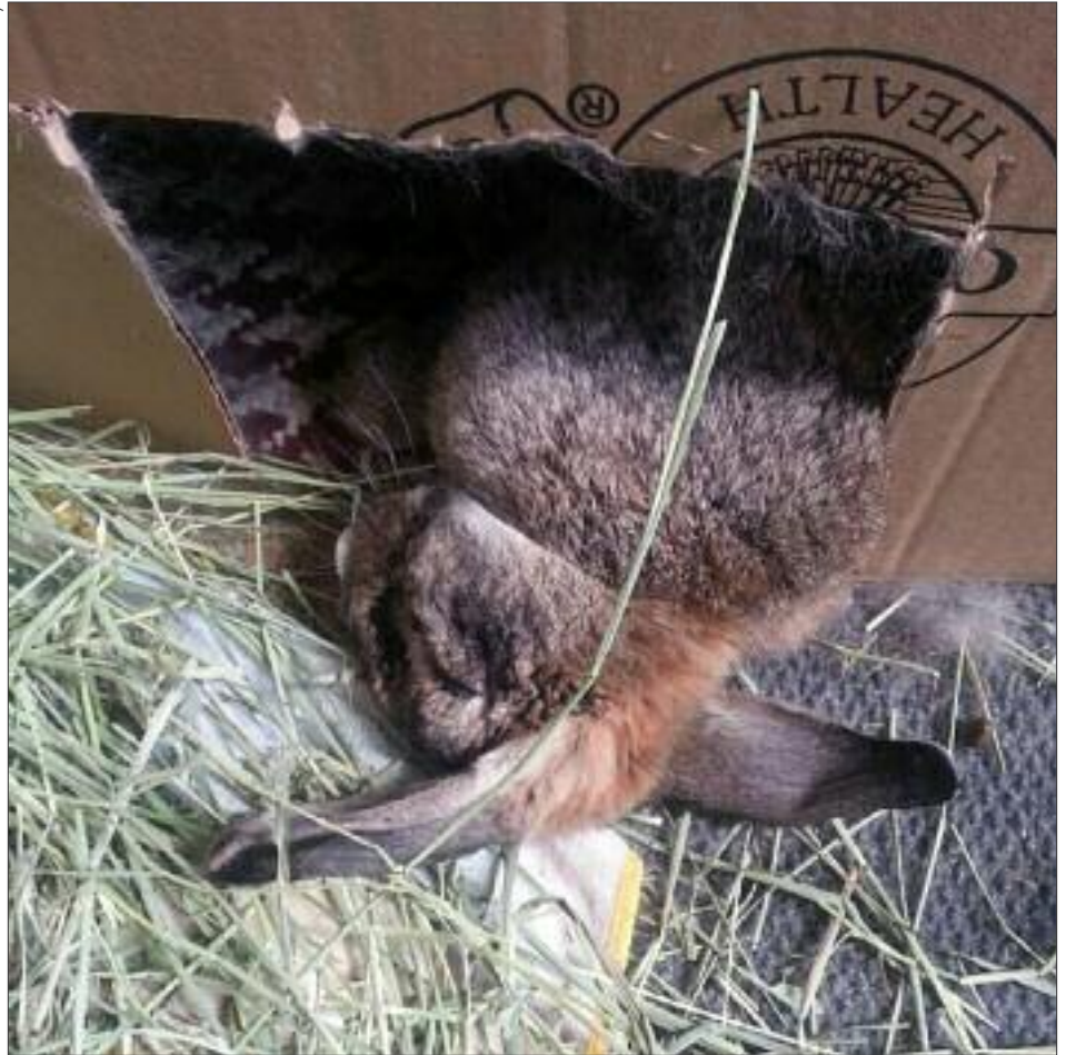
Polly asleep in her cherished hidey house.

the couch. However, he's now happily bonded to Sabine (who had been spayed at the Humane Society), and I know that the happiness he had with Polly is partly responsible for this new friendship.