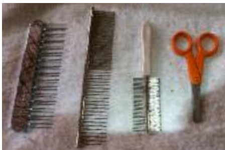
Grooming tools, left to right: staggered tooth butter comb; coarse/fine butter comb aka greyhound comb; fine/finer comb; blunt tip scissors.