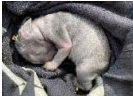
Tara, fka Babybun, after she was rescued last year.