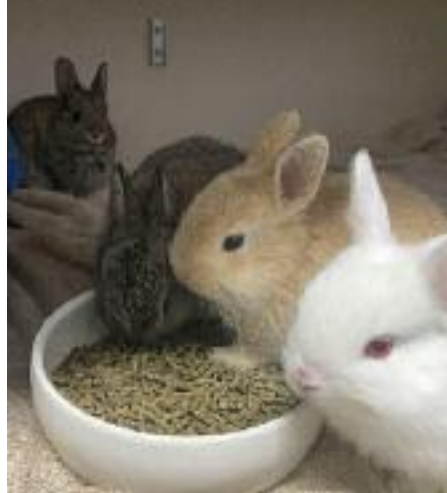
Swirl's Babies: Swoosh, Twirl, Whirl, Swish.