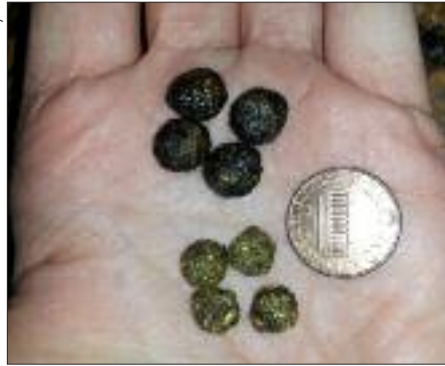
Normal fecal pellets.