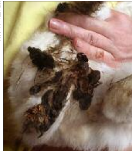
This rabbit needed a wet butt bath.

Resolving runny stool in a rabbit is not always a simple matter. It may require dietary changes, good husbandry, and sometimes extensive diagnostic work and treatment by your veterinarian. But it will all be worth it for a long life filled with happy, nose-wiggling love and a nice, clean bum.