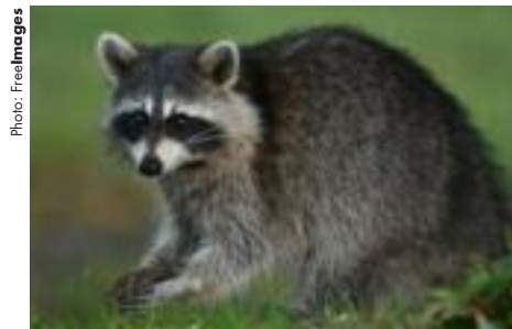
Raccoons harbor deadly roundworms.

Leaves can harbor fleas and ticks. Perhaps the most deadly parasite is raccoon roundworm: Rabbits who ingest leaves