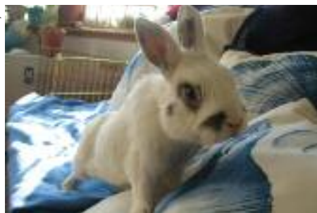
After Ramsey died very suddenly at home, his adopter had his vet do a necropsy.

It is a consolation for many to be present as their rabbit crosses the Rainbow Bridge. Others prefer to say goodbye and then allow the veterinarian to perform the procedure without them. It is a very personal decision. You may be offered the opportunity to spend time with your rabbit's body. If so, it's your choice. Do what feels right in the moment. Most veterinarians not only allow but encourage owners to spend some time with their rabbit after they pass away. Not everyone chooses to do this, but it can be comforting for some. Euthanasia is indeed very sad, but it is a privilege to assist a beloved pet with his or her suffering in this way. It is the final gift of love.