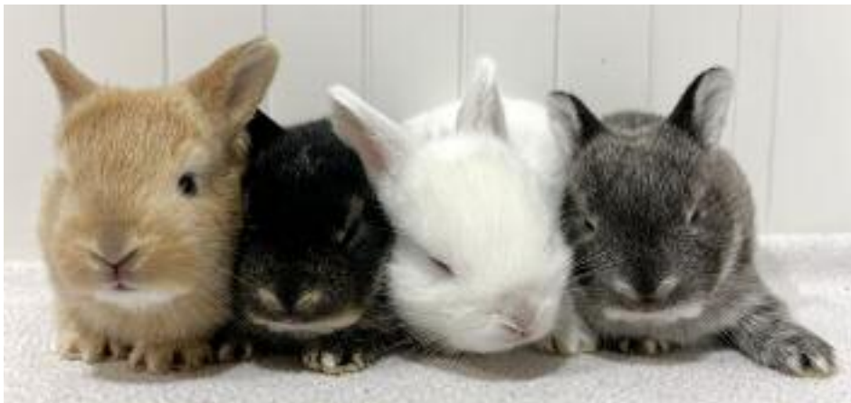
Beautiful babies, 10 days old.