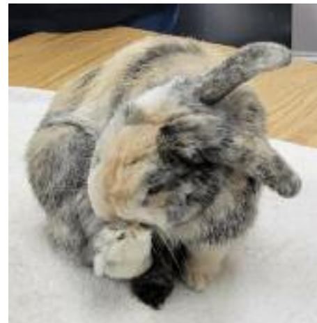
Quick timeout for cleaning at Oyster Bay-East Norwich Public Library.