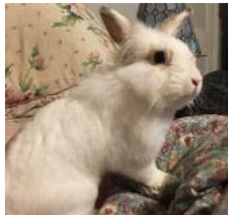
Princess Penelope Godiva.