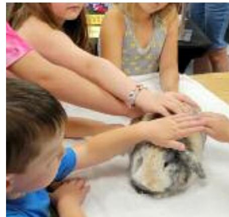
So many gentle hands petting me at Oyster Bay-East Norwich Public Library.