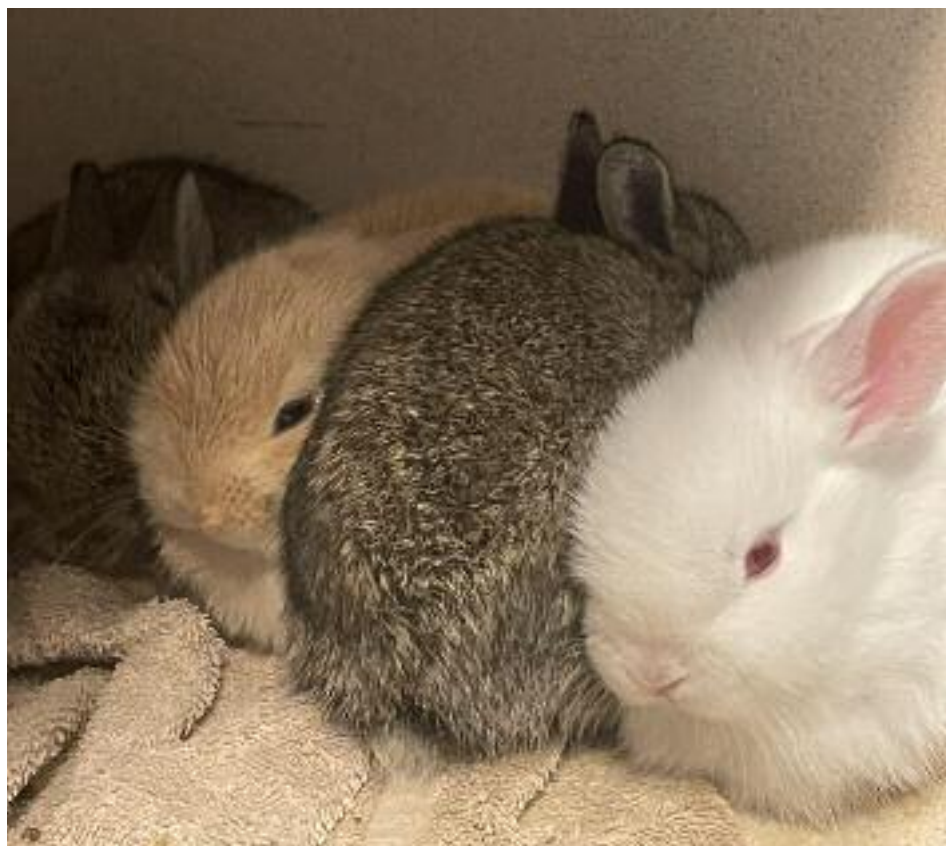
Swirl's Babies: Swoosh, Twirl, Whirl, Swish.