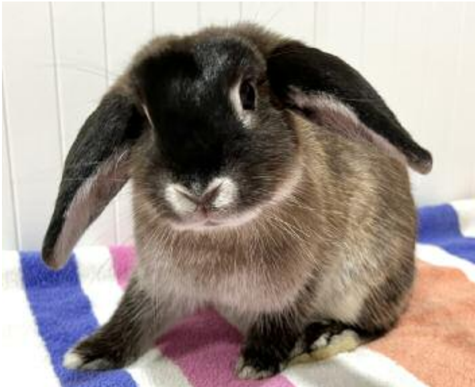
Avery shortly after rescue.