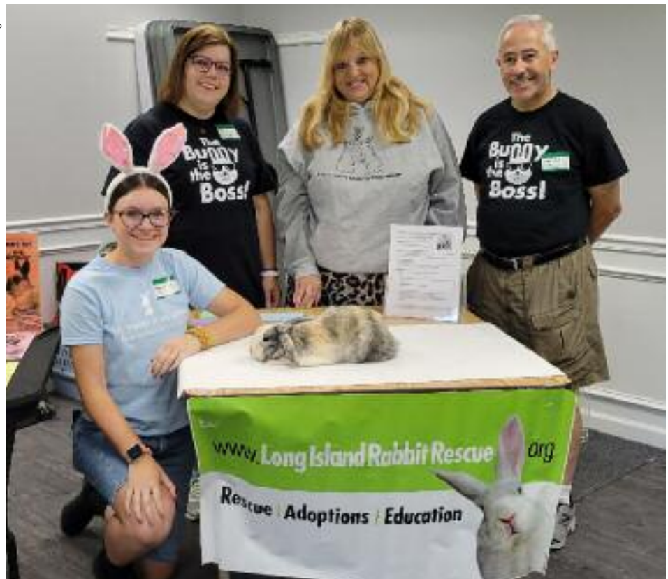
LIRRG volunteers at Oyster Bay-East Norwich Public Library.