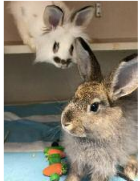
Polar Bear and Brown Bear.