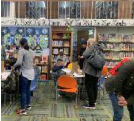
Floral Park Public Library.

attention while volunteers educated children and parents with fliers and activity books for the kids to take home.