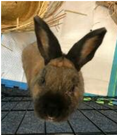
Budgie the Bunny.