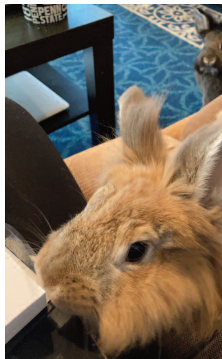
Nala (and Simba in the background) are back to their usual antics of begging for treats.

With the Covid-19 vaccine series, I knew the second dose often causes increased symptoms compared with the first. However, I wasn't overly concerned for my bunnies since the first dose had gone so well. Simba, Nala and Charlie might have known what was coming this time, though. Charlie definitely resisted more than usual when it was time to go in the carrier!