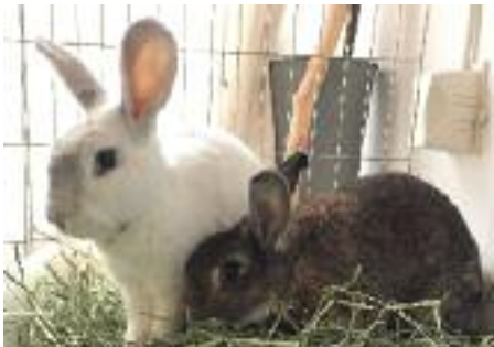
Sammy and Bullet.