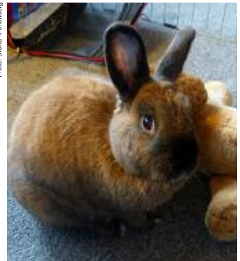
Budgie at Diana's.