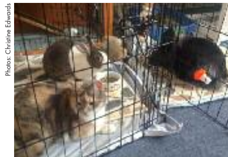
Nibbles, at rear, Kiwi and Chewy.

Chewy had the opposite temperament of Nibbles. Nibbles was very affectionate and trusting; you could do anything to her and she didn't care. Chewy, even to this day, is very territorial and grunts at me when I attempt to clean his pen. He