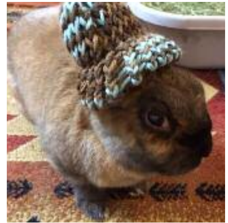
Budgie, 2019 New Year's.

The vet agreed to come to my home to euthanize Budgie so that he would be in familiar surroundings when he passed. While getting the first sedative shot, Budgie was struggling and fighting to get away until I was able to soothe him with my voice and by petting him. He