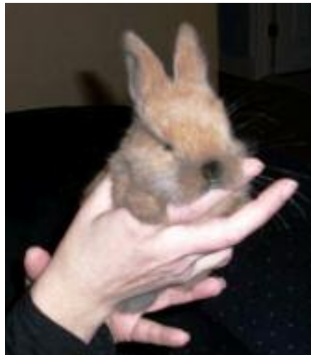
Budgie as a baby.