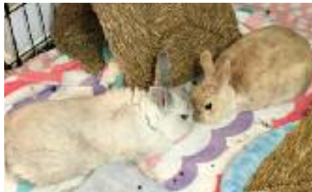
Winter and Peach.

We love Peach for the adorable, playful, clever individual that she is, and are so grateful to her for being such a gentle, loving, and patient partner to Winter.