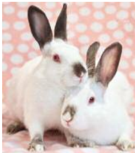
Purple and Blue.

Blue and Purple are a young brother/sister pair of 3.5-pound Himalayan rabbits. Blue is the more outgoing of the two, and enjoys being wherever his people are at all times. He loves having his cheeks rubbed and will happily melt into the floor for long petting sessions. Purple is shyer than her brother, but is never far behind Blue and enjoys occasional head pets from quiet, gentle people whom she trusts to respect her boundaries. Blue and Purple are a wonderful pair who are very affectionate with each other and spend a lot of their down time closely snuggled up together or grooming one another. Blue and Purple are neutered/spayed and living in