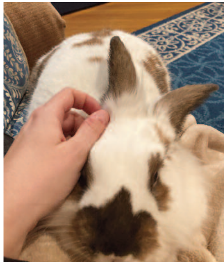
Charlie feeling back to normal and cuddling next to me while I watch TV.

The bunnies' vaccination cards are much cuter than mine.