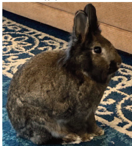
Simba always looks at me like this when she wants something!

Again, when we arrived at Catnip & Carrots a veterinary technician collected our bunnies from the car and brought them inside. About 15 minutes later the buns were back in the car again, and the vaccination cards were updated with the information for the second dose.