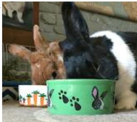
Pippi and Dashie.

has been linked to neurological damage and death in rabbits, although this product is apparently safe for dogs and cats. The manufacturer (Merial) has placed a warning on the Frontline label stating that Frontline should never be used on rabbits. Safe treatments to prevent and kill fleas on rabbits include Advantage (imidacloprid), Program (lufenuron), and Revolution (selamectin). Learn more at rabbit.org/faq-grooming .