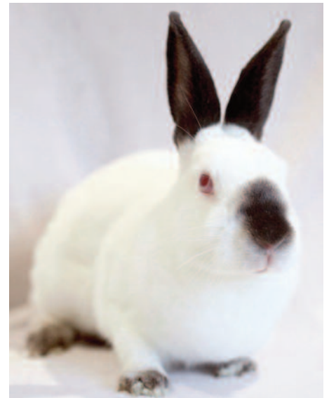
After: Skye, November 2019.