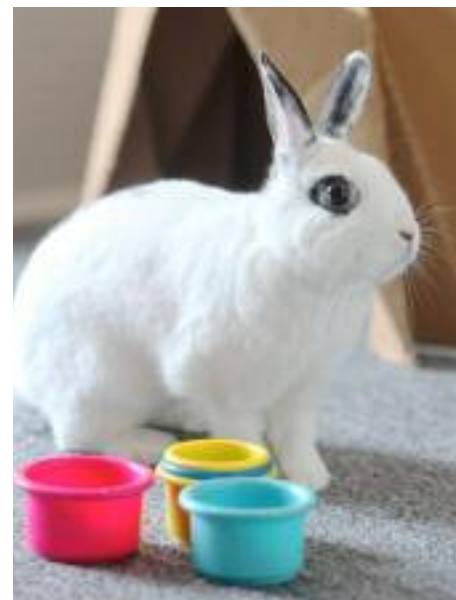
Bunnies can look alike but have very different personalities. Angelina, left, is outgoing, bold, curious and enjoys human interaction. Puffin, right, is shy and careful, and enjoys human interaction from only a very special human.

treatment. Rabbit health can be an elusive thing. If you don't think your bunny is responding to treatment, you must visit the vet again to determine if more tests or exams are necessary. Your rabbit is depending on you.