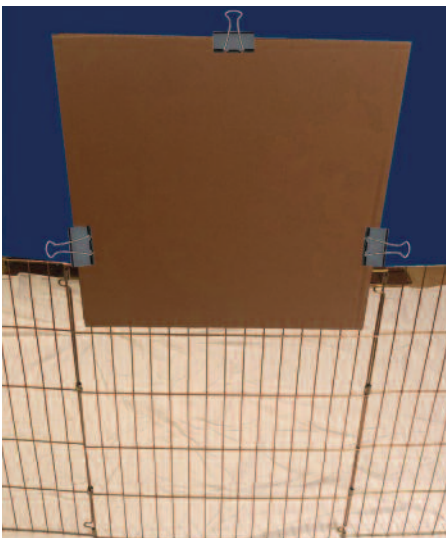
“Hat” attached to a gate or X-pen.