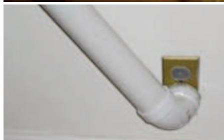
PVC pipe protects electrical wires.