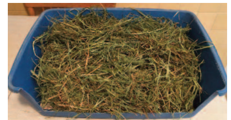
Low entry litter box.