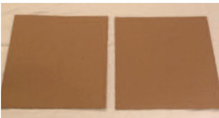
Cardboard to be used for the “hat.”