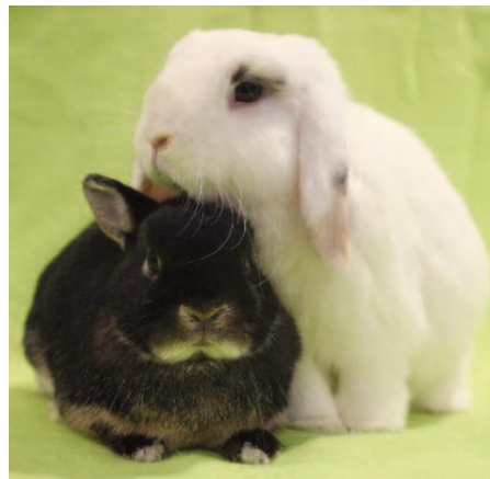
Remington & Delilah.