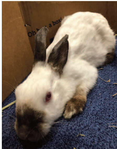
Before: Skye, May 2019.