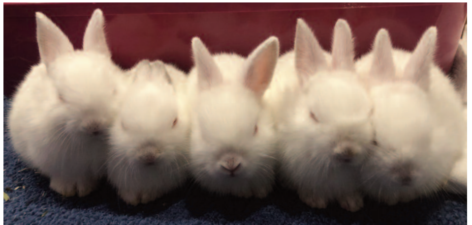
We needed to be able to tell the babies apart!