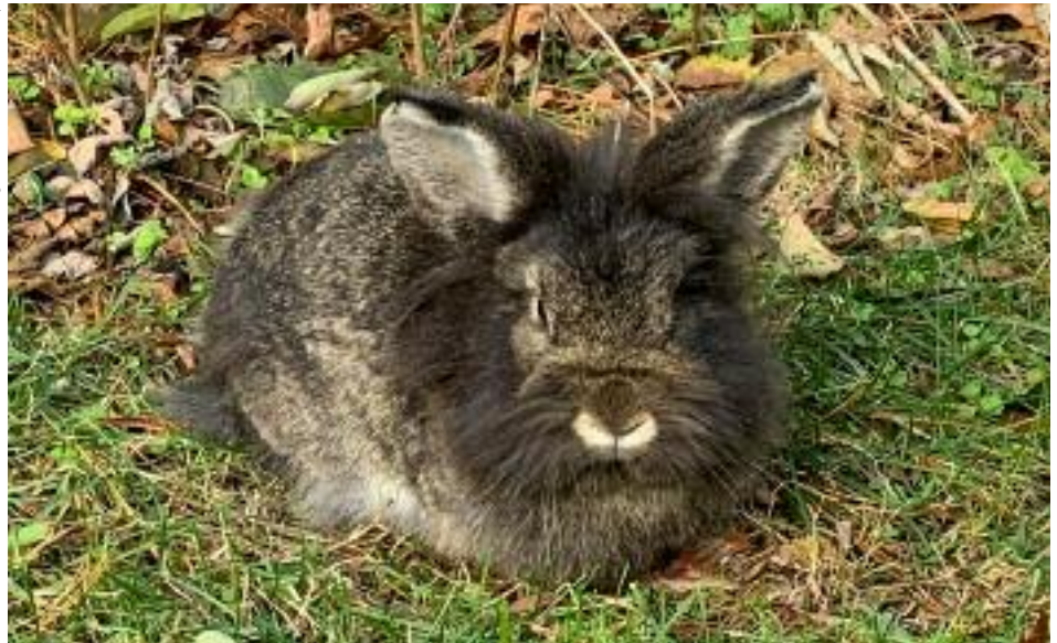
Violet in the finder's backyard.