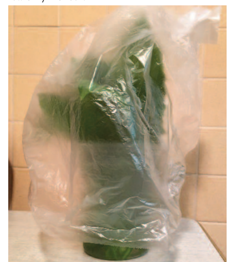
Keeping greens fresh.