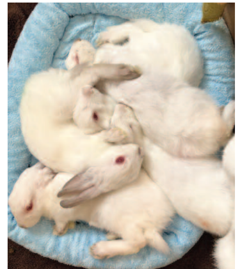
Babies nestling together.