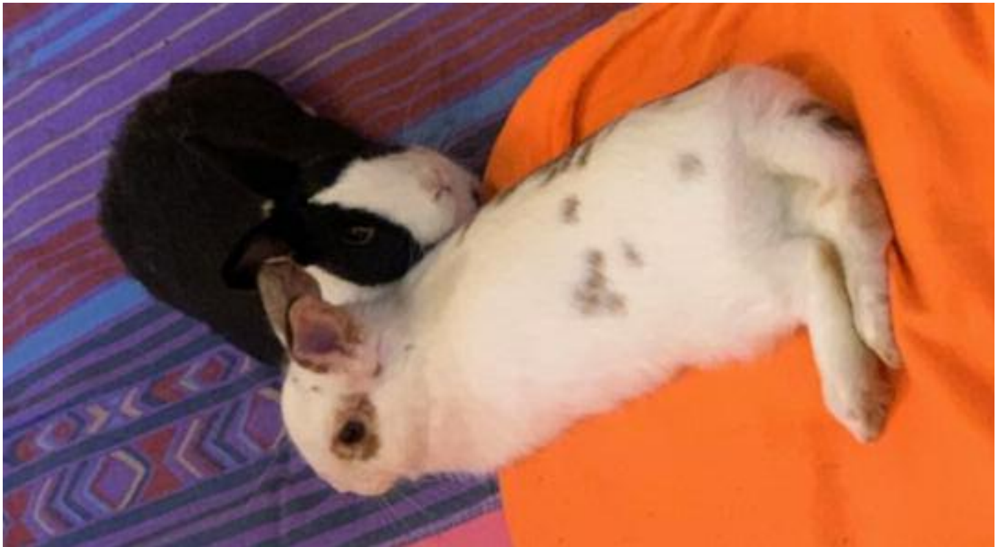
Munchkin (formerly Panda) with Matzah Ball.