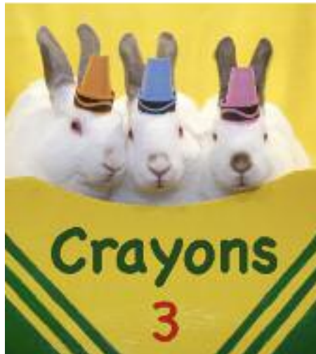
Four-month-old siblings Orange, Blue and Pink pose for a colorful group photo.