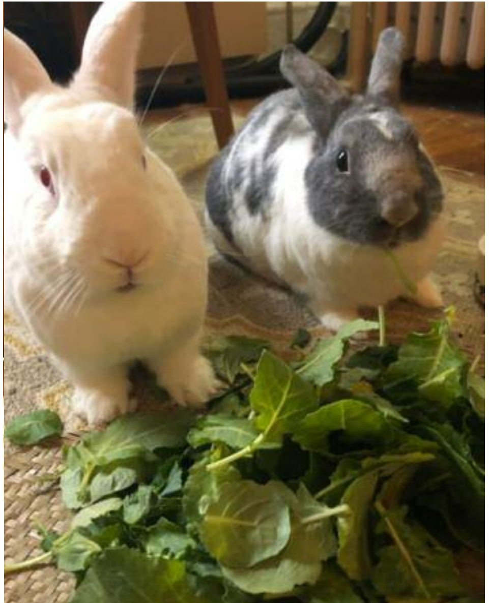
Milo, left and Victoria, right.

food is served correctly and signals me when she wants a session of pets and head rubs.