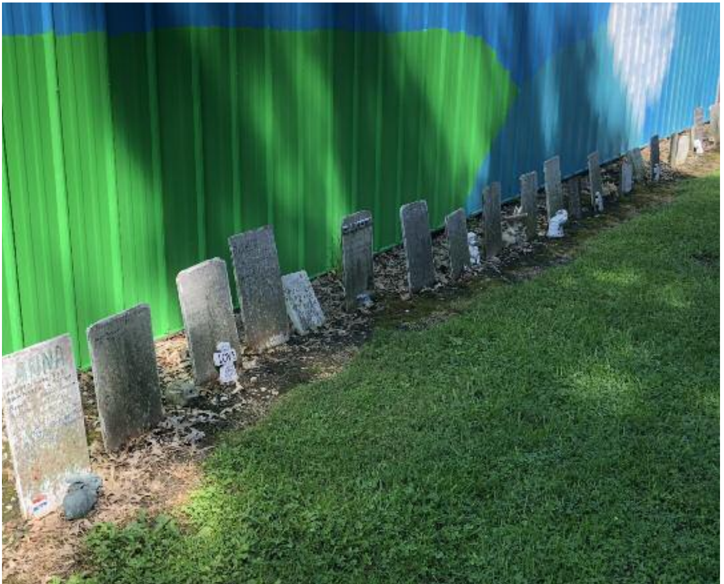
Rich Henry's rabbit cemetery.