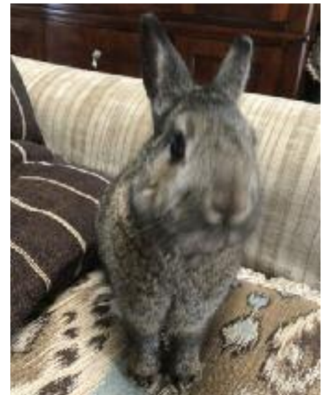
Chilling on the couch.