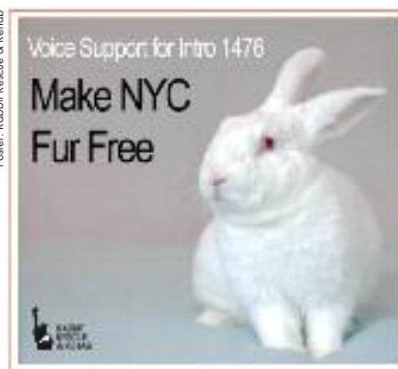
Poster: Rabbit Rescue & Rehab

have signed on to it, so be sure to urge your family and friends to voice their support to their council members as well.