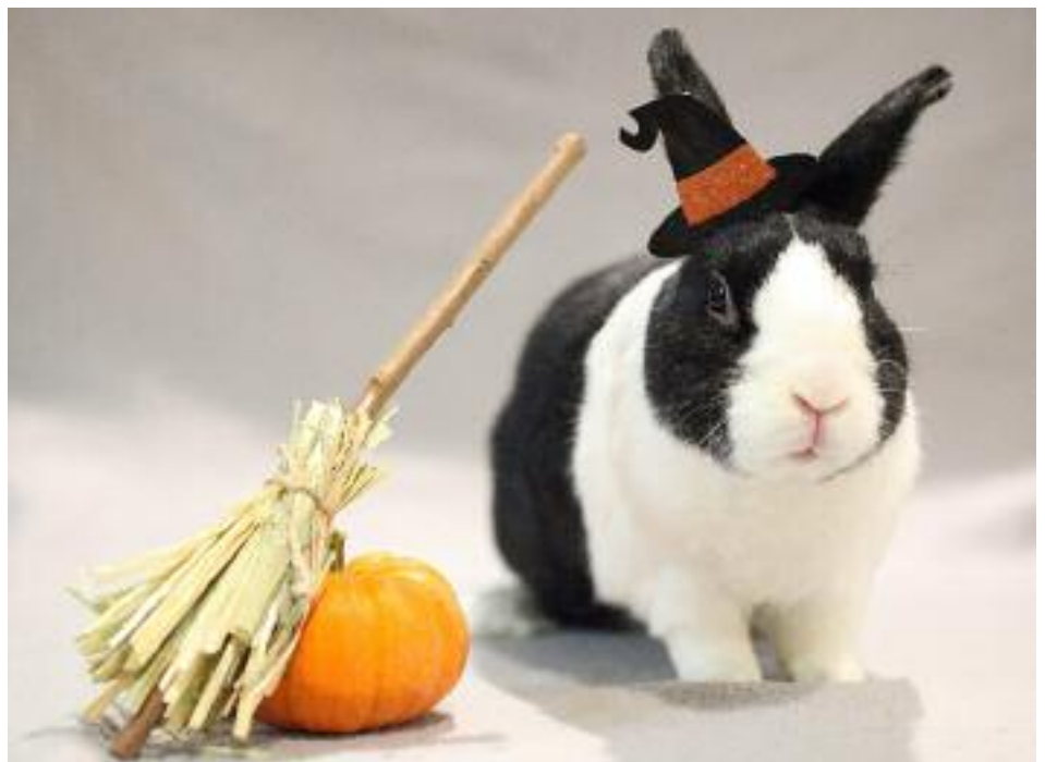
The perfect shot of Iko in his Halloween costume,