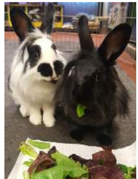
Pineapple and Sugarplum.

are a joy to watch as they exercise – running and binkying with reckless abandon! They have been spayed and are living in foster care. If you are interested in adopting Pineapple and Sugarplum, please email nyc.metro.rabbits@gmail.com .