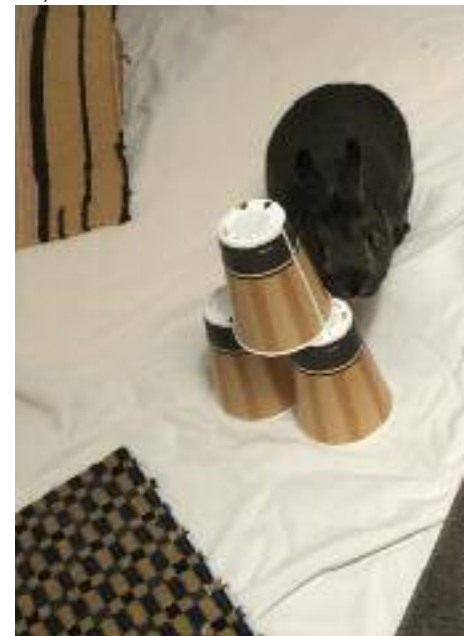
On Bun Island with stacked cups.