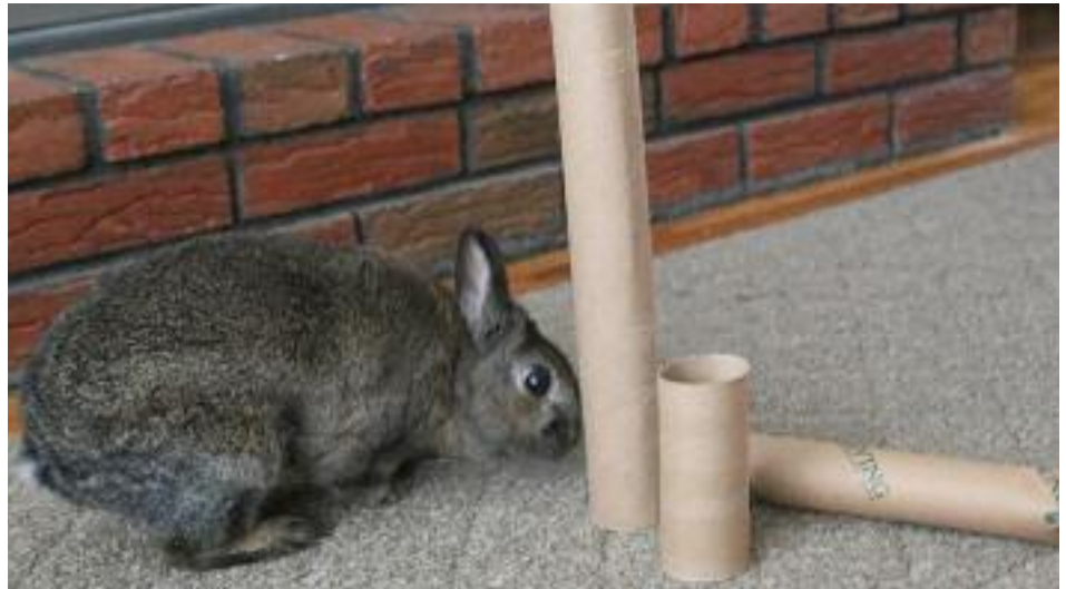
Don't toss out those paper-towel rolls. Your bunny will be so happy to knock them over and toss them over his head.