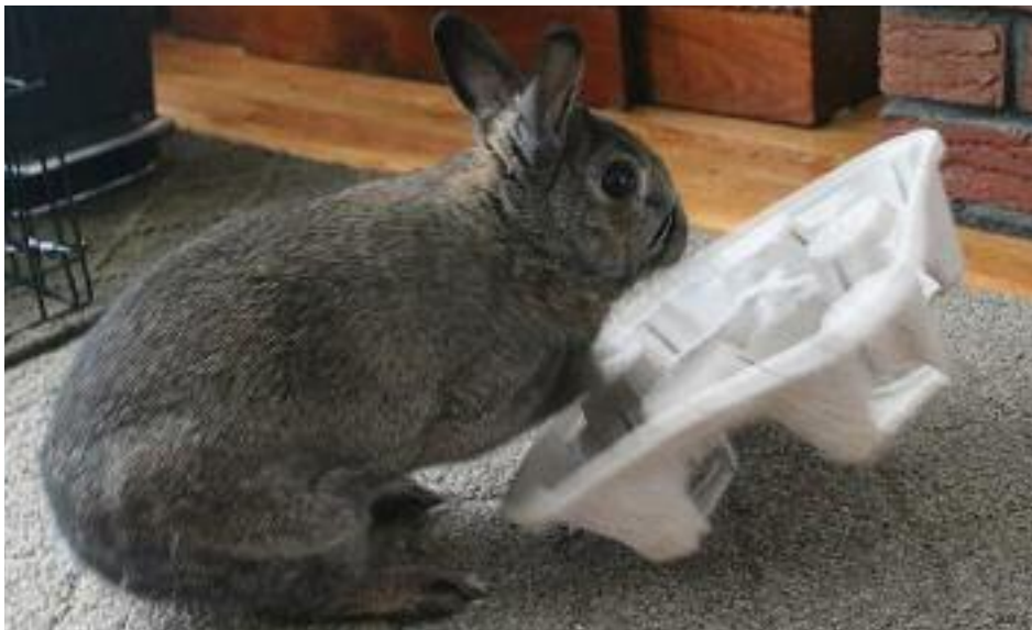
A drink holder is one of the best toys a bunny could ask for. You'll see your bun flip it, chew it and dig at it over and over again.