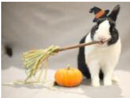
Iko's Halloween costume, outtake 4.