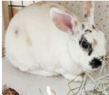
The incomparable Carmela.

dogs, cats and rabbits from more than 40 rescue groups and shelters. Sponsors included Petco and the Petco Foundation, Bobs From Skechers, and JustFoodForDogs.