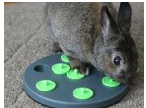
This Traxie toy makes treat time more fun for bunnies. They love to sniff out the treat's location.