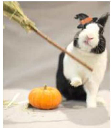
Iko's Halloween costume, outtake 2.