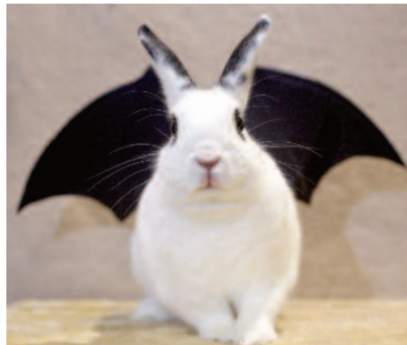
Puffin poses as Batman.