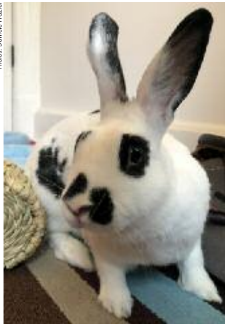
Today Marbles has reached a healthy weight and has become a happy and confident bunny.