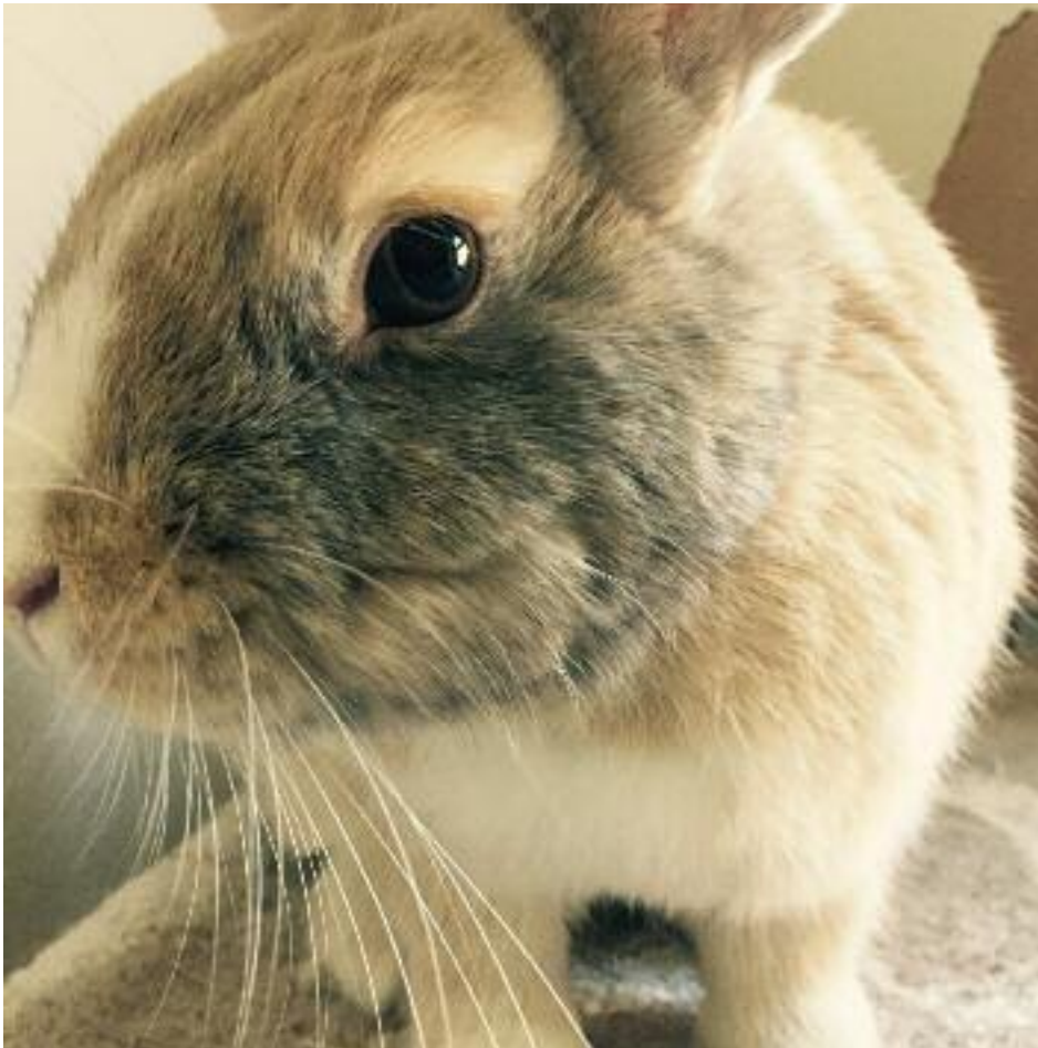
This gorgeous close-up of Butter's gray cheek was taken in 2016.