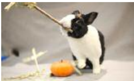
Iko's Halloween costume, outtake 3.