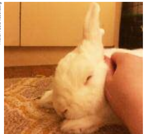
Milo loved caresses.