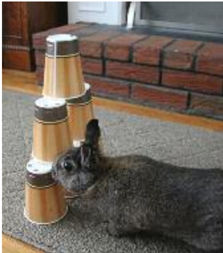
Any small cups can be stacked over and over again for bunny to knock over.