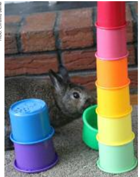
Stack them, hide treats under them or just place them around and you'll find what your bun likes best about stacking cups.

even nudge us to get attention. Setting up tall lightweight items such as toilet paper rolls or small plastic cups can provide the bun with a field of opportunities to nudge. Let the bunny knock them all over, and then you can set them up