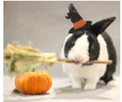
Iko's Halloween costume, outtake 1.