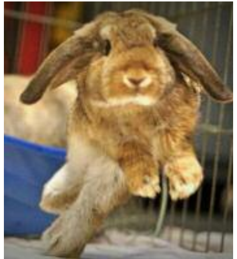
Bunbun jumps during bonding with Bubba (hidden at rear).