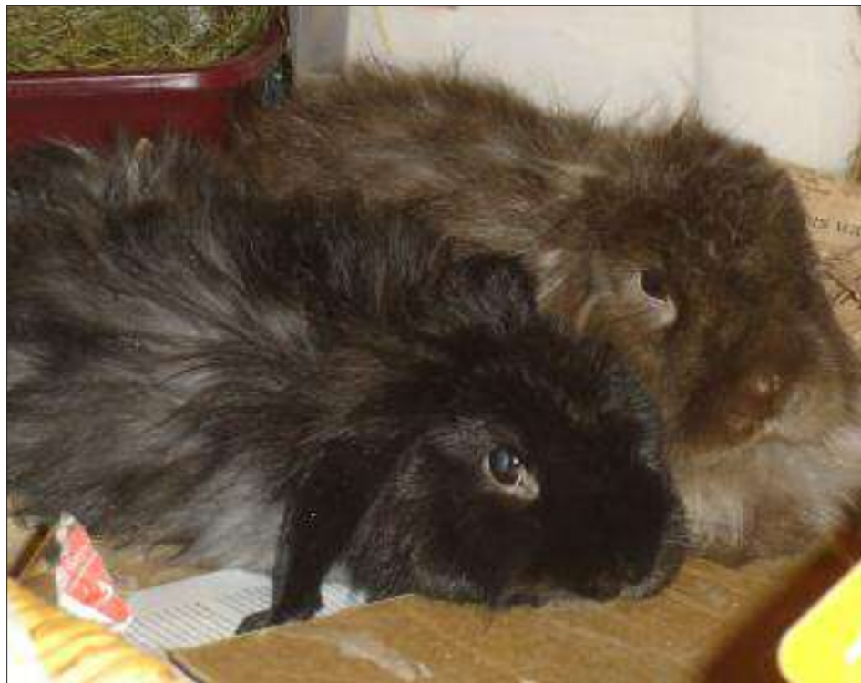
Mopsy and Robin.

I'm terribly sorry that I couldn't give Robin more than five years. I fought and fought to save him. Robin had health problems throughout his life. He had been to many rabbit vets in NYC and the surrounding area for his health problems. He'd suffered from numerous ear infections, E. cuniculi and repeated stasis episodes. Although Robin had at least 16 documented stasis episodes through the years, vets could never determine the cause.