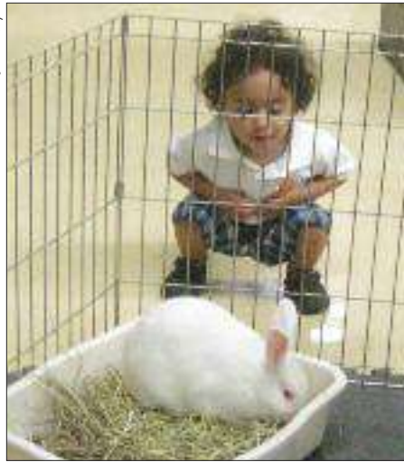
Lola with an admirer at Union Square Petco.

their bunny, they are advised to follow instructions for bonding precisely, with caution and patience.