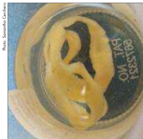
One of the several tapeworm segments found inside a rabbit.

The aim of this article is to shed some light on the topic of necropsy so that owners can be informed at a time when they can absorb and evaluate the information, instead of being faced with