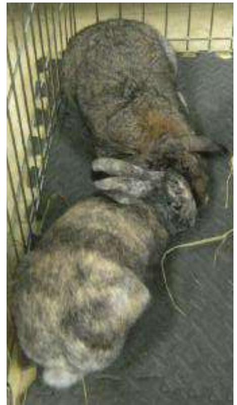
Agouti lop with Tippy.

my lovable foster bunny still hasn't met the right rabbit, much less the perfect (or good-enough) adopter, I believe she will, and soon.