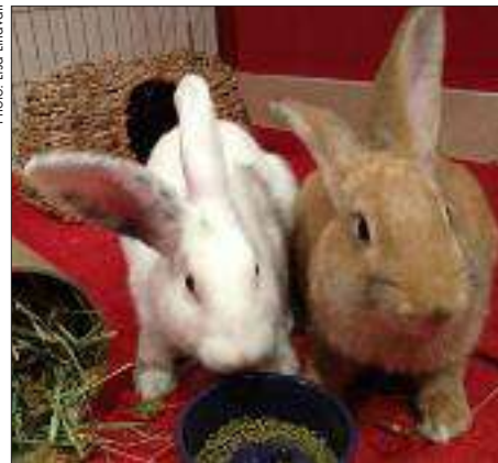
Bonnie and Clyde.