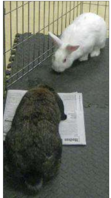
Agouti lop with Lola.

Relieved to return to her pen, Lola zooms through her five-foot cardboard tunnel and flops on the ceramic tiles in her favorite corner. Although I am disappointed that in three speed dates