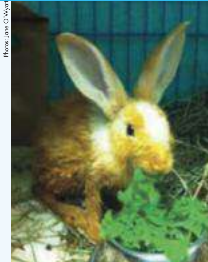
Sept. 7, 2010. Benita eating greens, ears up.

After Kitty and Cindy leave, I reheat both SnuggleSafes and put them back in cage (it's 8 p.m. and maybe they will stay warm through the night, though manufacturer guarantees only eight hours of heat), set up a salad bowl with wet greens and add dry pellets to bowl on top of which Cindy had put the