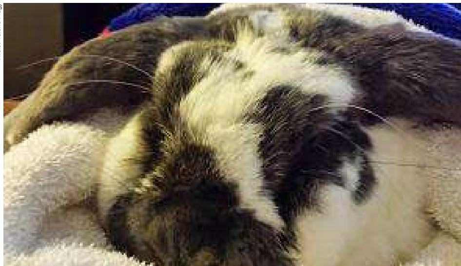
Lucky as burrito bun.

Eventually, after a little bit, he became my nap bun. I would take him out, burrito him and we would sit together and nap on the floor or couch. He would stay for hours with me and snuggle. Buns that I have had over for nail-trimming have proved that the burrito method generally works as a calming technique when a rabbit must be handled or picked up.