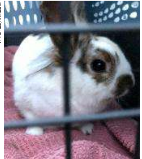
Scout in carrier.

We stood on either side of the rabbit, with the other two sides blocked by a fence and homes. Our pen only blocked off one side, though, and with no pens left, we were apprehensive as to what to do next. I grabbed some nearby garbage bins and cardboard boxes, and used what I could to barricade the opposite side.