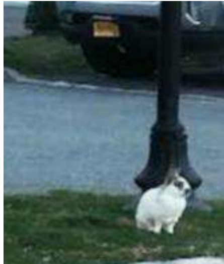
Scout just before her rescue.