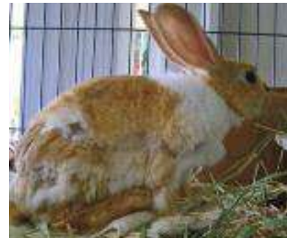
Oct. 2, 2010. Clipped fur is growing in.