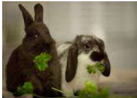
Blackberry and Marbles.