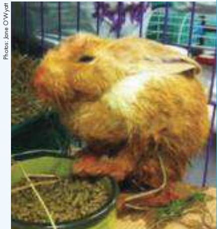
Sept. 6, 2010. Benita taking a rest break while eating pellets.

My helper Kitty Pizzo gasps, looks horrified when I bring the bunny into rabbit room. We set up cage: litter box lined with kraft paper, topped with soft Organic Hay Co. 2nd-cut, trimmed AC&C cardboard carrier with clean towel as a hideaway, water bottle with sipper tube. Rabbit sits in litter box in corner of cage with her back to us. She is wet and trembling, so I ask Kitty to find and nuke two SnuggleSafe heating