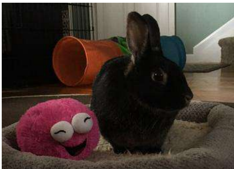
Storm at home.

I never knew there was so much to learn about rabbit lingo before Storm came into our lives. She has taught us a lot and has made us better bunny parents. Learning any new language takes time and patience, but most of all, love. If you get to know your little ones, learn what to look for, and listen to their own special personalities, you, too, can be "bunlingual!"