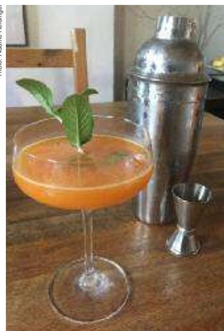
Krolik in the Sun.

serious animal-themed gathering. The Google can provide you with many scrumptious recipes and options but a personal favorite is the endive boat (obvit!), mozzarella and tomato skewers cutely arranging like bunny ears, and a slow cook with veggie meatballs – which yes, does indeed look like a Flemish Giant's litter box. You're welcome!