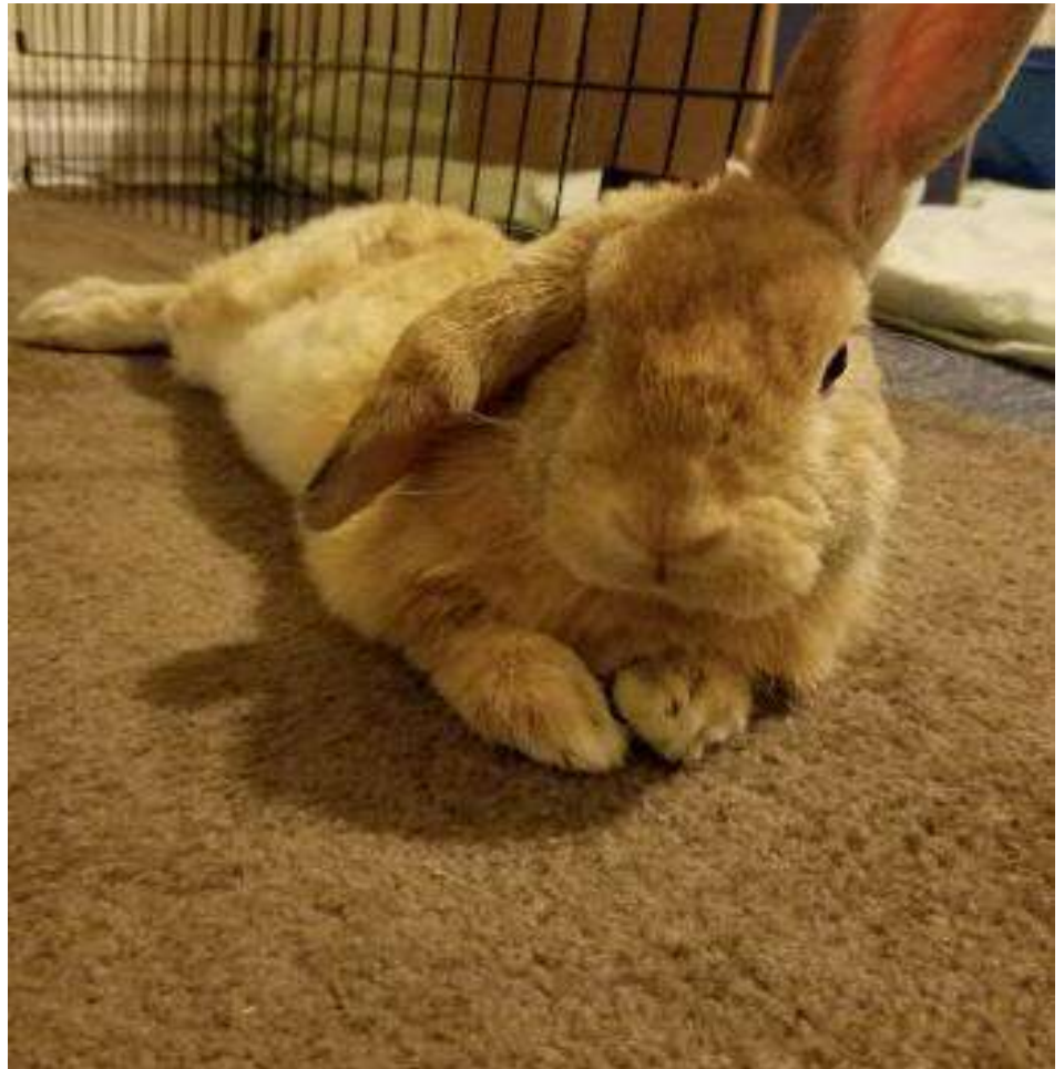
Baloo stretched out.