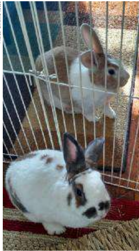
Benita and Uriel.

while she supervised. Sometimes they would share hay together in the hanging hay ball. Then he would find a comfy spot by the gate and she would lie beside him. She loved to observe him. Benita made a great cottontail nanny. She always informed me when it was “sleepy time.” Uriel adored and looked up to her. Like a kid, going to bed was not his favorite thing, but for her he would do it. It was their special bonding time. Since she's moved on, he no longer sleeps in the big boy pen. Instead, he sleeps where she used to sleep after she put him to bed.