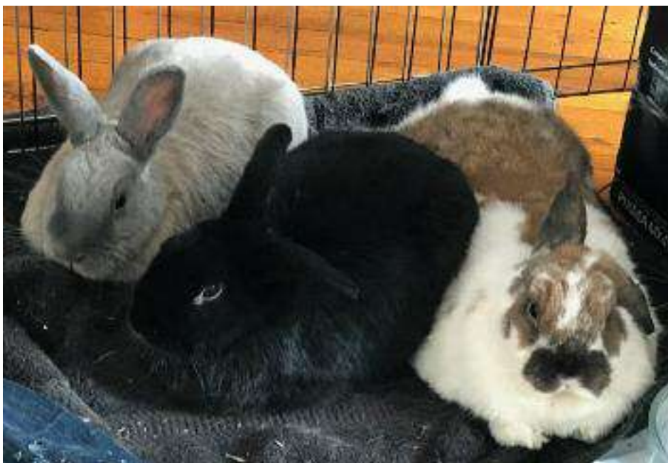
Ares, Coco and Hank.