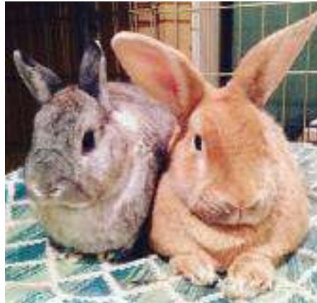
Eeyore and Lola.

and neutered. If interested in potentially adopting them, please email nyc.metro.rabbits@gmail.com