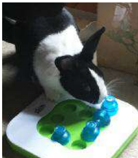
Pauly with the Living World Teach N Treat Toy.

https://store.binkybunny.com/cottontail-cottage-p43.aspx?widget=mp