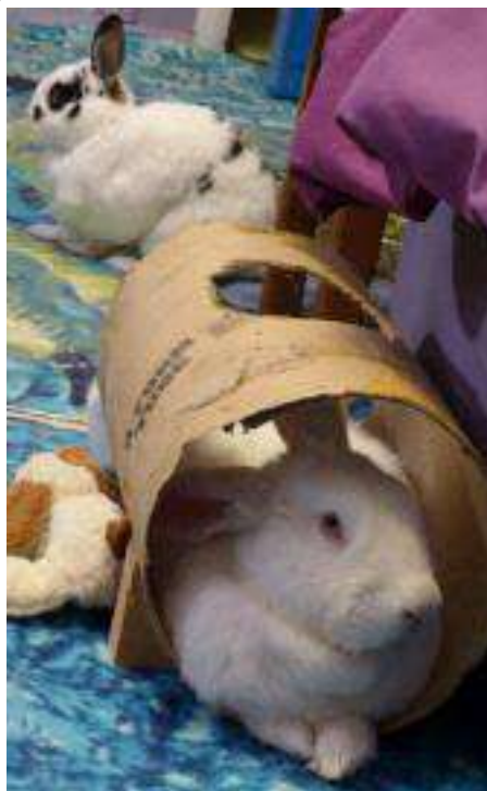
Charlie and Piper with cardboard tunnel.