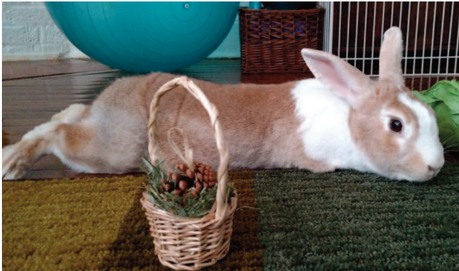
RIP Benita. See Thump's coverage of Benita's rescue and rehabilitation in 2010 and 2011, pages 19-26.