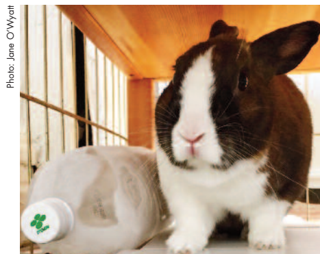
Arnie with frozen water bottle on ceramic tiles.

islands" that can make it feel even warmer than surrounding areas, and with a heat index that can soar to the upper 90s for multiple days at a time. I would rather