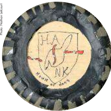
Our "House of Hank" family crest shield.

surgically trimmed regularly. Eventually he succumbed to an abscess.