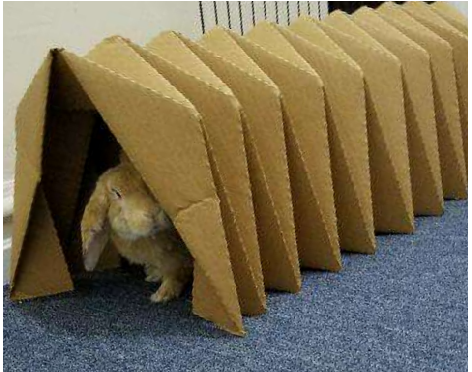
Baloo in cardboard tunnel.