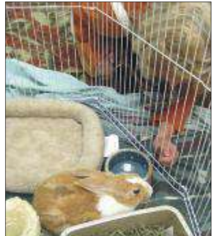
Benita with admirers at annual Rabbit Rescue & Rehab conference at the end of October.