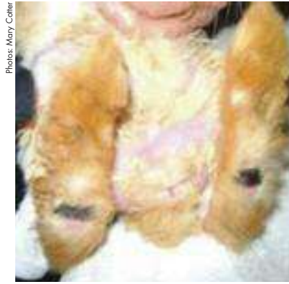
Sept. 19, 2010. Scabs on hocks

She gives a quick startle and jerks away when I am too close, or nicking her skin, but she settles right back down on my lap, unrestrained, ready to tolerate more. I am able to use one hand to hold up the spikes, and the other hand to work them loose with tiny scissors or with my electric clippers – leaving no hands to restrain her. She permits me to use those loud electric clippers even right next to her enormous angel-ears. Some very sensitive areas (especially under her chin) she does not want me to touch, but we “negotiate,” and sometimes she relents a little, and I am able to make some progress. And when she has had enough, she lets me know, and I put her back in her cage so we can both take a break.