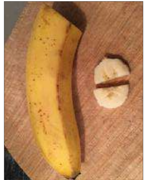
A small piece of banana is a good treat.

Be sure to securely support the bunny's back end, and do not allow him to kick or struggle. If he does, carefully release him to a sternal (on his belly) position, supporting his back and hindquarters at all times. Talk reassuringly to him, and stroke him gently, and don't try again until he has calmed down. Depending on the rabbit's personality, you might have to try several times before you're successful, and if you are having trouble doing this alone, get a second person to “spot” for you. Never force anything. If you feel resistance, pull back, change position slightly, and try again. Be very gentle, as the rabbit colon and rectum are very delicate and easily damaged.