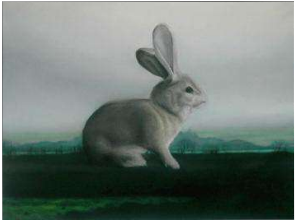
Painting by Amanda Parer.

Why rabbits? According to Intrude 's publicity, "The visual humor of the large rabbits lures audiences into the artwork to reveal a more serious environmental message. For artist Amanda Parer, rabbits are an animal of contradiction. While they often connote furry innocence frolicking through idyllic fields, rabbits are considered an invasive pest in the artist's native Australia, where they have caused a great imbalance to the country's natural and delicately balanced ecosystems since they were first introduced by white settlers in 1788."