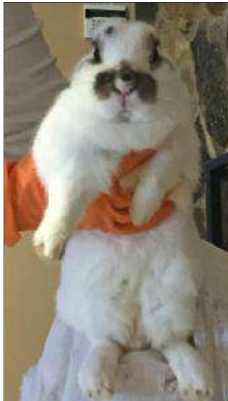
Betsy on the day she was rescued.

in the uterus. Betsy's estimated age is 4 years old, compared to the typical 10- to 14-month-old abandoned rabbits that we usually rescue. Further medical testing