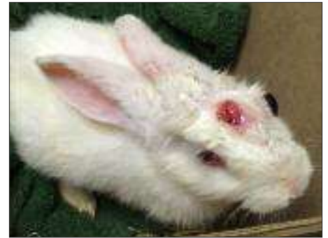
Oliver when rescued.

As these recoveries were unfolding, we already had another rabbit in treatment