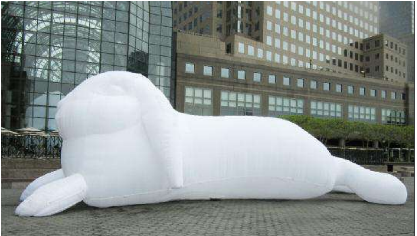
One of the two biggest sculptures, unlit.