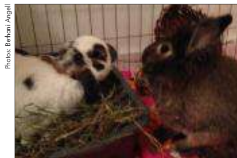
Gigi and Duke.