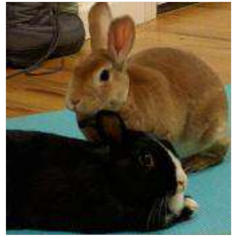
Buster and Emilia.

Introducing BOB (a/k/a Big Orange Bunny!). All rabbits are beautiful and special, and this sweet guy is no exception. Bob came to us after being abandoned outside in NYC with a group of other rabbits. A testament as to why it is so important to never expose domesticated rabbits to the outdoors, all of these young rabbits had terrible ear mites, parasites like coccidia and giardia, as well as other infections and abscesses. Bob has received extensive veterinary care and is now free of mites, parasites and abscesses. We continue to monitor