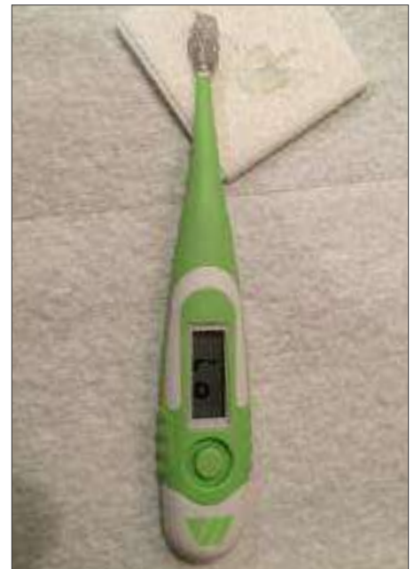
Use a well-lubricated plastic thermometer.