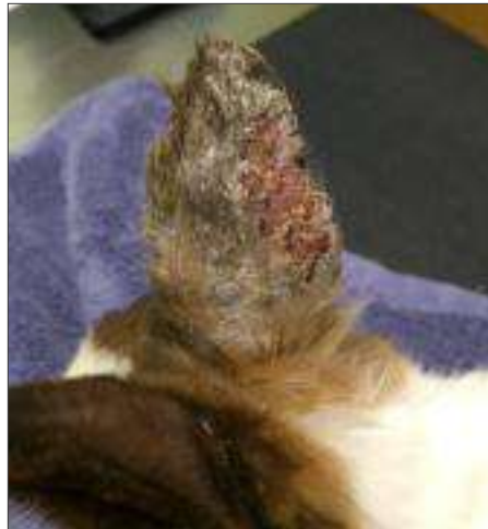
Luke's ear when he was rescued.

Just before the Fab Five were rescued, we took in a severely injured, tiny, baby rabbit (approximately eight weeks old) that had been found under a car. Little Oliver weighed less than a pound and had a horrendous wound on his head. It looked like a severe burn with blunt force trauma from an object and, unimaginably, it was suspected that the little guy had been tasered or burned with a cigarette. The tissue under the burn was traumatized and was badly