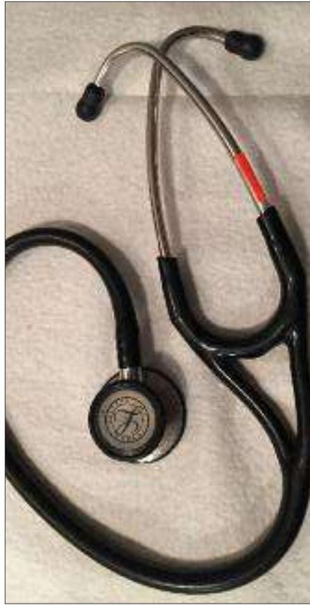
An inexpensive stethoscope is a good investment.

If the hypothermia is due to the late stages of a systemic infection, it means that bacteria in the bloodstream have used up so much of the rabbit's glucose (blood sugar) that he cannot maintain a normal body temperature on his own. This must be treated immediately and aggressively, sometimes with intravenous antibiotics