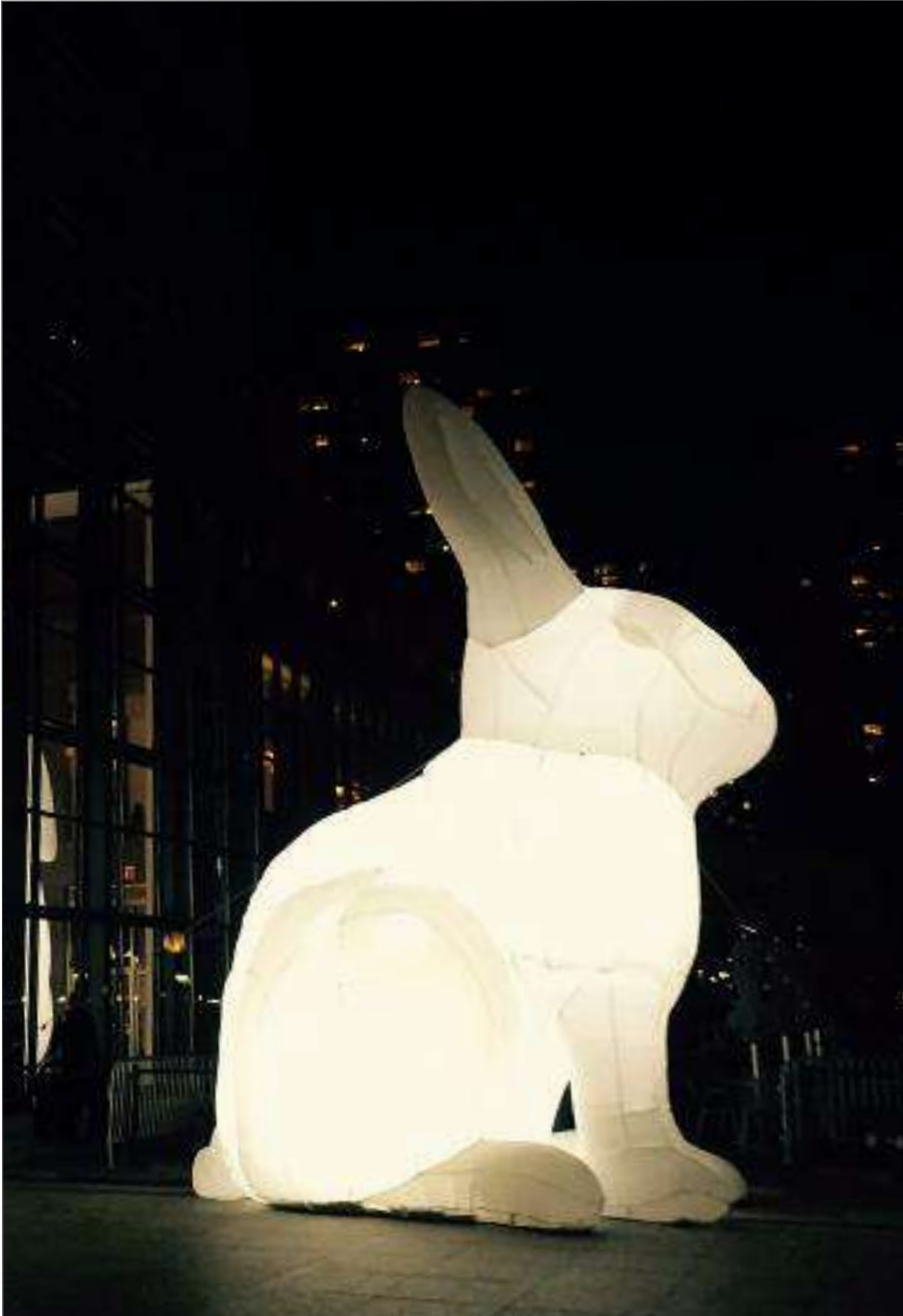
A light sculpture faces west.