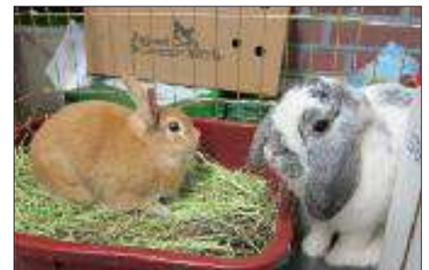
The speed date of Bentley and Tribeca.