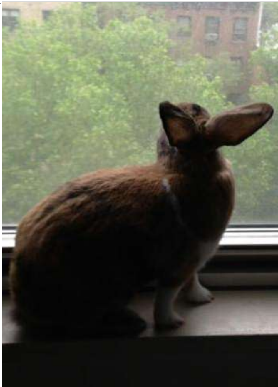
Sophia watching the world go by.

know that IF I didn’t have such stellar adopters, I might really miss Juno, Dylan, Sophia and Duke, but I can’t help but be so happy for everyone involved.