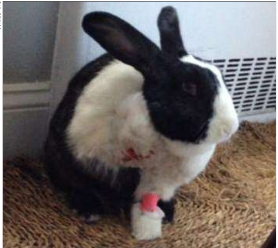
Lara at home after surgery.