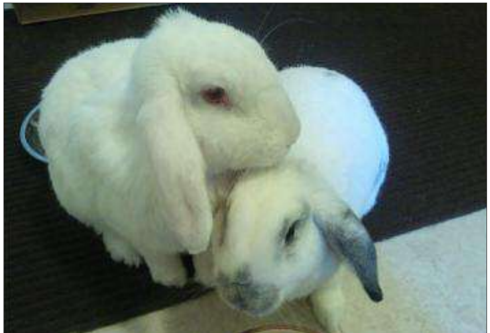
Marshmallow and Mochi.