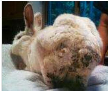
Audrey was brought in emaciated, covered in feces, and, it turned out, besieged by maggots.