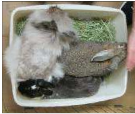
A three-bunny speed date.