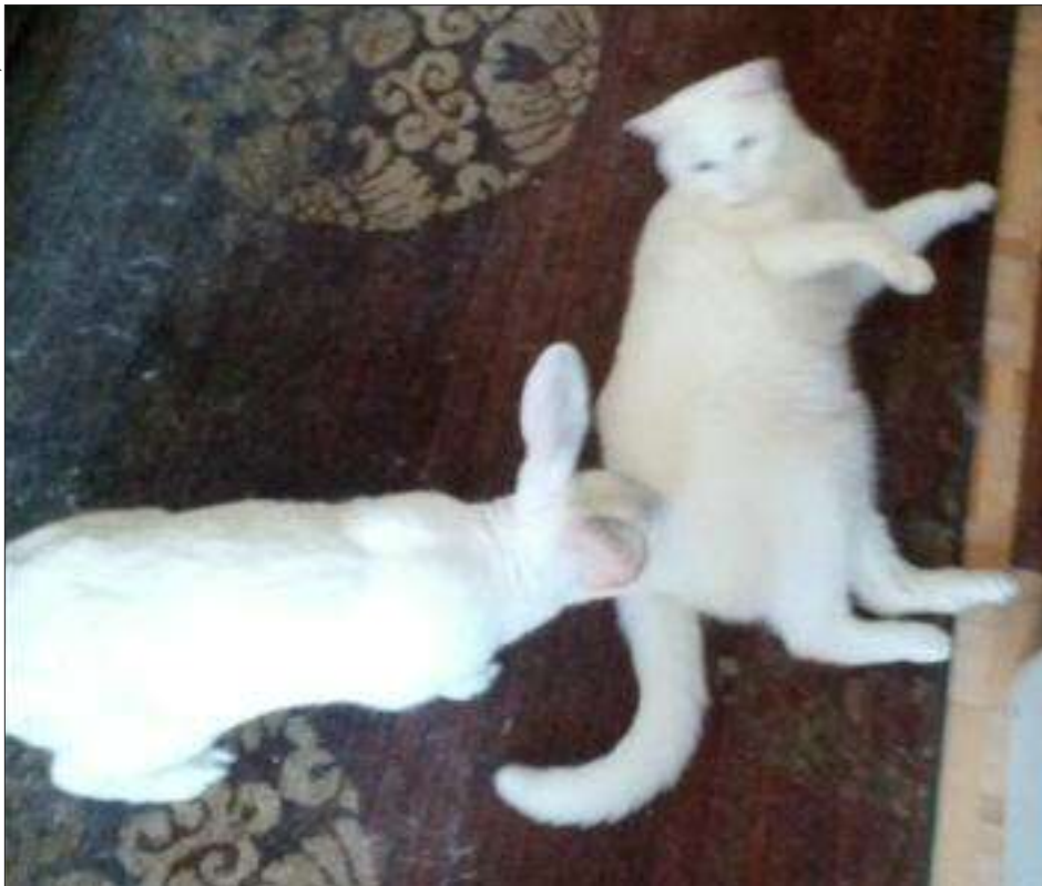
Polar Bear with cat Sasha.