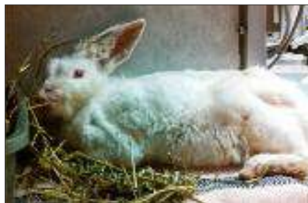
Audrey recovering at Catnip & Carrots Veterinary Hospital.