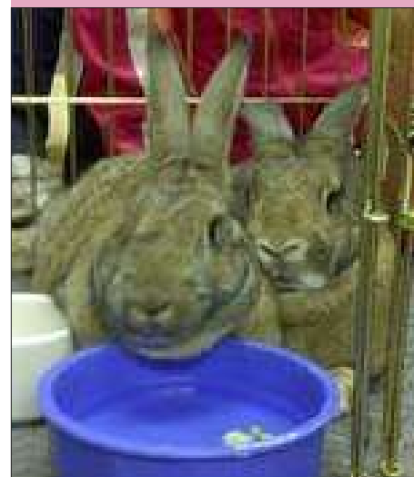
Nutmeg and Clovis during a speed date.

Rabbits adopted since the last newsletter include: Cinnabun, Dolly, Chestnut, Isabella, Brownie Bits, Georgette, Sky, Bagi and Boci, Polar Bear, Snoopy, Easter, Zoro, Duke and Sophia, Schroeder, Noelle, Nemo, Cinnabun, Houdini, Rizzo, Charlie, Buddy, Alesha, Abby, Mocha, Luciana, Kingston, Calvin and Hobbs, Midnight, Daffodil, Stanley, Nicole, Octavia, Clovis, Mocha, Bunny, Beau, Edwin, Tank, Theo, Gepetto.