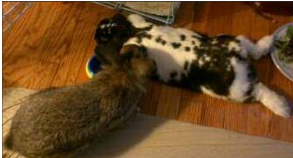
Chewbacca and Oreo.