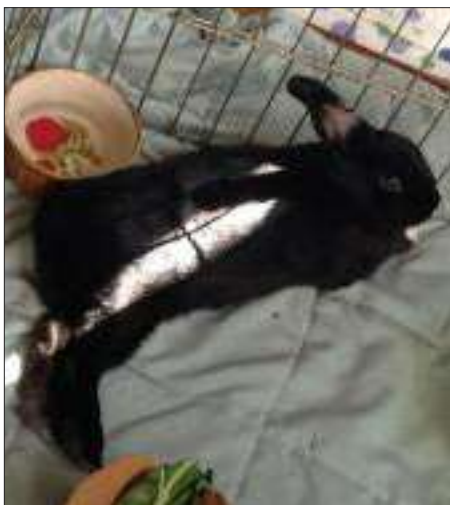
Owny in the sun.