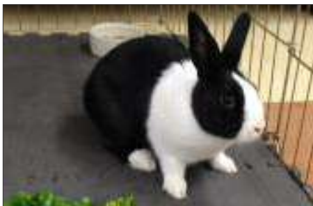
▲ Sassy was adopted. ▼ Maxine and admirers.