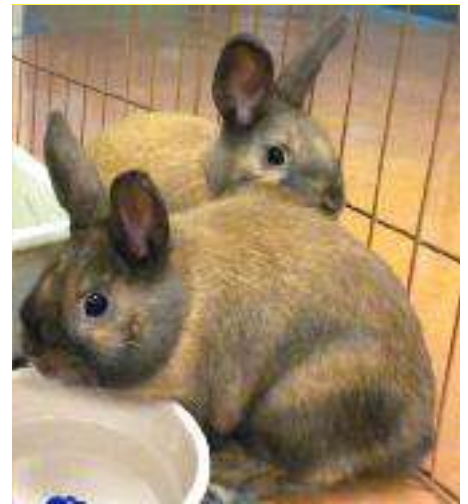
Baxter and Quincy at Maddie’s Pet Adoption Days.