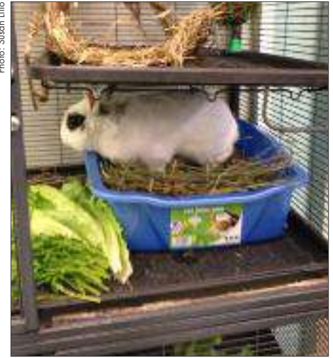
Pinto in her cage at the West 117th Street Petland Discounts store.