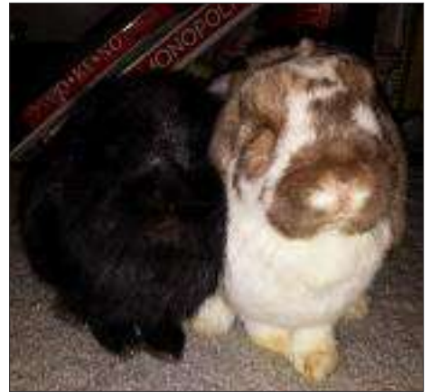
Scribble and Trixie.