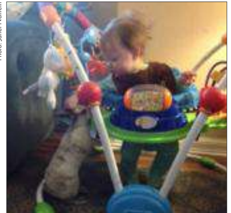
Marbles and Lily.