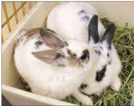
▲ Famous and Elvis. ▼ Puddles with Rudy and Rusty.