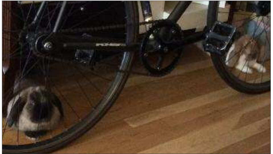
Pixie and Stanley.

It's so cute! He loves his cage and really made himself at home here. I think he likes us, too. He's still shy about being petted but is slowly letting us give him a stroke or two.