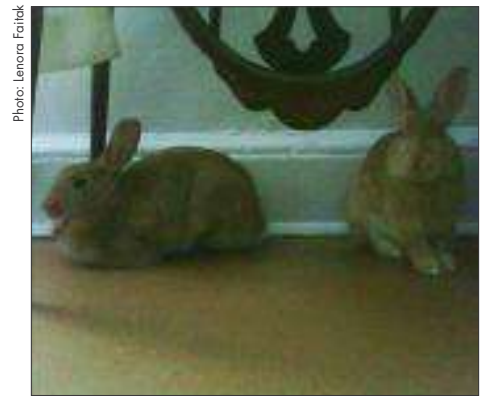
Dixie Do and Bosco Bean.