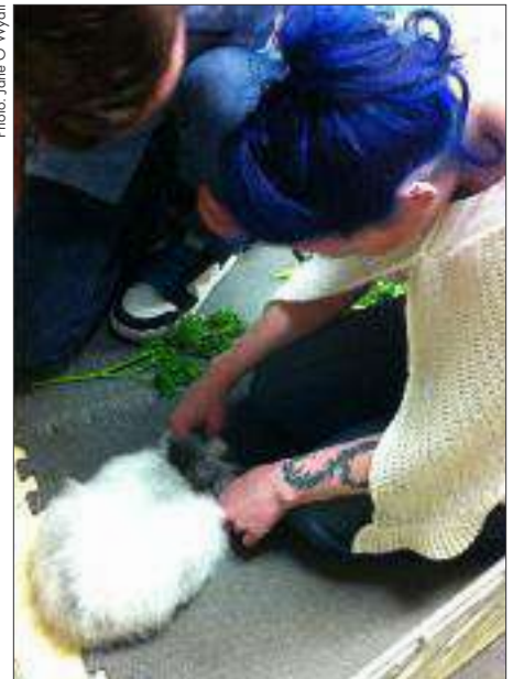
Motin with his adopters.