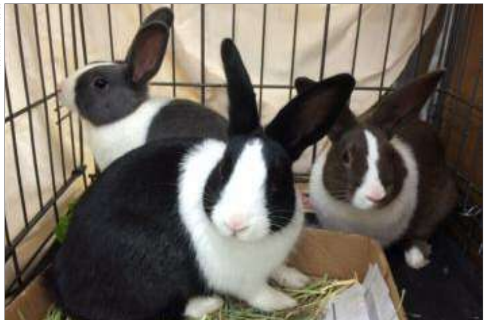
Dutch litter mates.