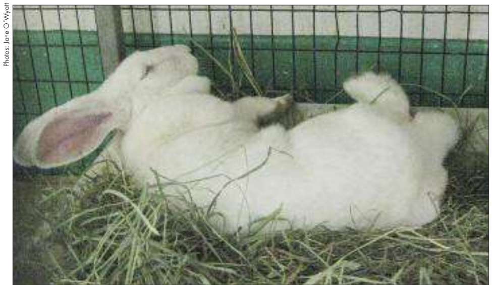
Sleeping Beauty at AC&C.

Since I did a weekly volunteer shift in the afternoons, I helped to place countless arrivals into clean cages with salads, rabbit pellets, water bowls and litter boxes. It was heartening to watch these