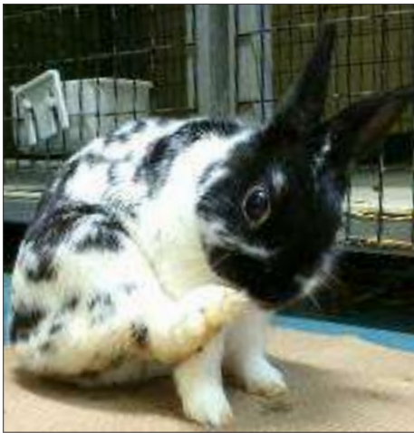
▲ Dark Cloud. ▼ Coco.