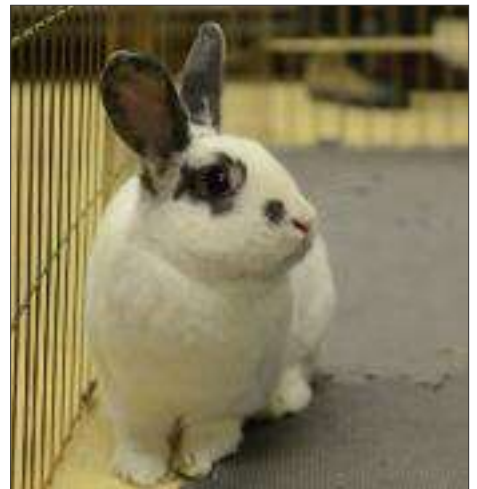
▲ Charlie Girl aka Charlene. ▼ Herbie.