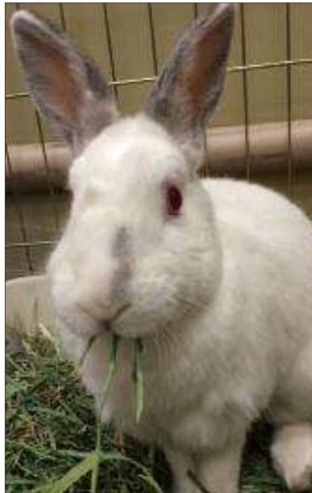
The meaning of hay...?

are: "The wise bunny knows we rarely see things as they are; we see them as we believe them to be," or "Bunnies hop. It is neither good nor bad; it simply is." One of my personal favorites is, "Every hop we hop resonates throughout the entire universe."