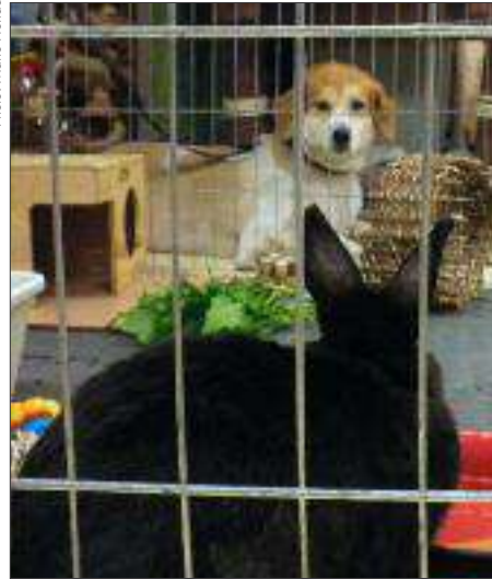
Vanessa calmly watches a dog.