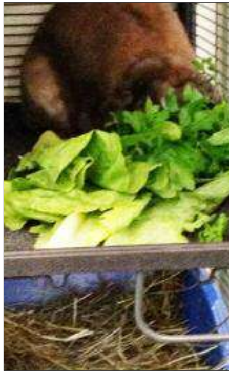
Ruby, at the West 117th Street Petland Discounts store.

“I support either of these proposals, and I am waiting to see when the City Council moves forward on these.”