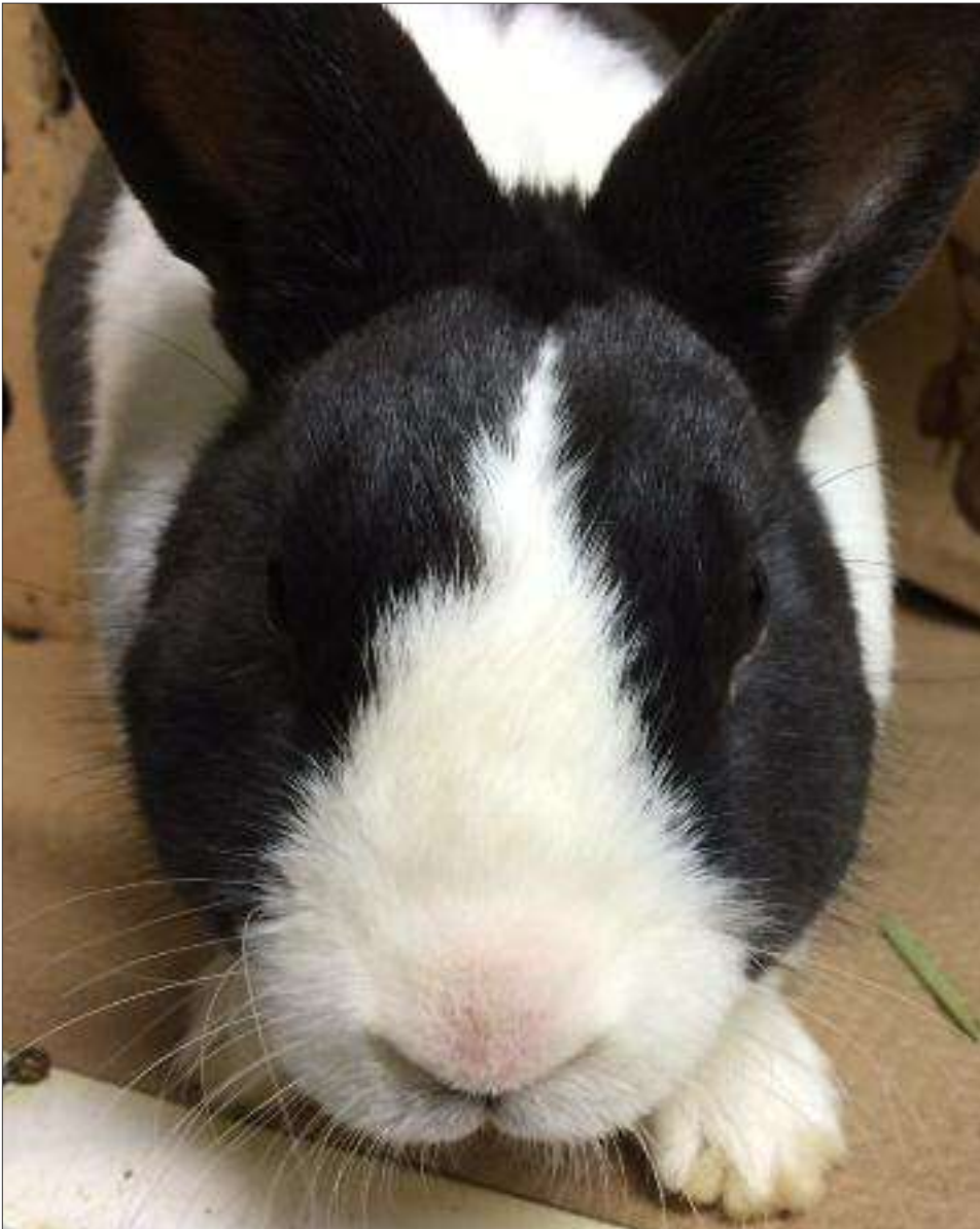
▲ Thumper. ▼ Queen.