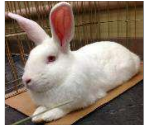
At peace with bunniness.

"Bunny Buddhism" is something to keep by your side to guide you throughout