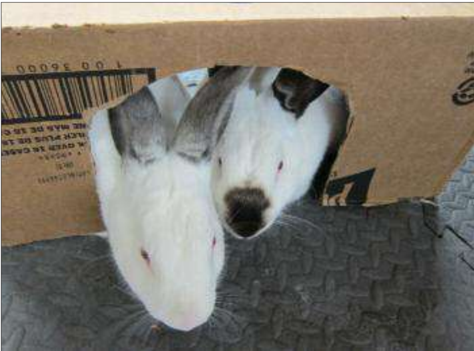
Riff and Raff.