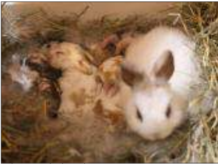
Baby-sitting the latest litter.