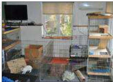
Living spaces for single bunny Toby on the left, bonded pair Kirby and Penny on the right.