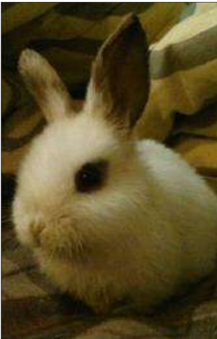
Candy, Jan. 29.

Candy, a tiny white lop with tan ears, arrived at the shelter in mid-December with mom Trixie and her larger siblings.