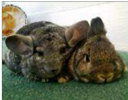
Ruby the chinchilla with Freeda the bunny.