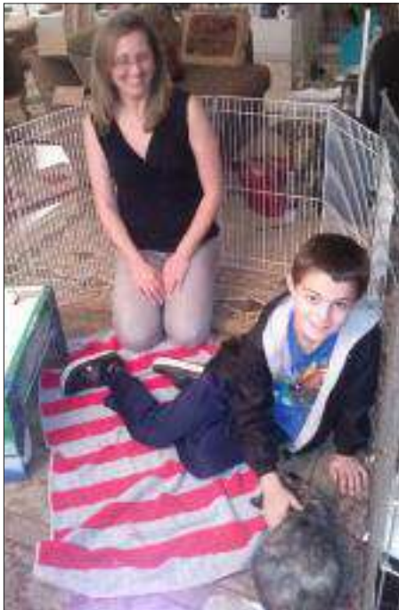
Dasher with his new family.