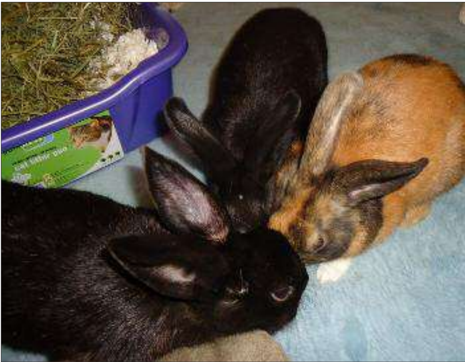
Reunited with happy babies.