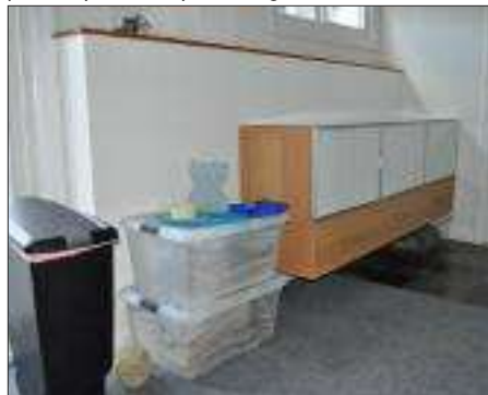
Floating cabinet mounted to the wall provides storage and hiding place for bunnies.