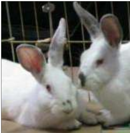
Riff and Raff.