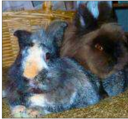
Thumperino and Veronica.

Most often they use their talents for good, but sometimes I sense they are plotting to take over the household and gain control of the treat jar. Their incredible teamwork inspired me to add Veronica as a character in the latest installment of my book series for young readers. The latest book is titled "Thumperino Superbunny and the Christmas Star Caper." Veronica is the rabbit riding a skateboard on the cover.