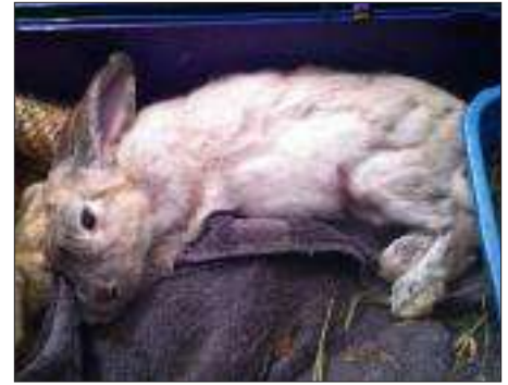
Three months later.

We took a long bus ride back to the East Village, Sky poking his head out of the bag the whole time, less afraid than interested in what was going on around him. I set up his cage and included a Palace Pet mat to keep him dry. He slept