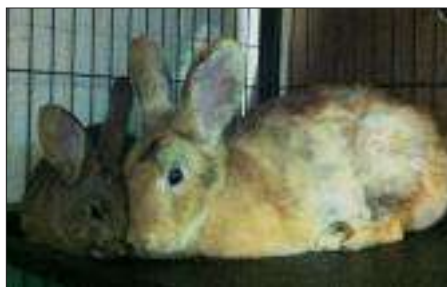
Lottie (with one of her kits).