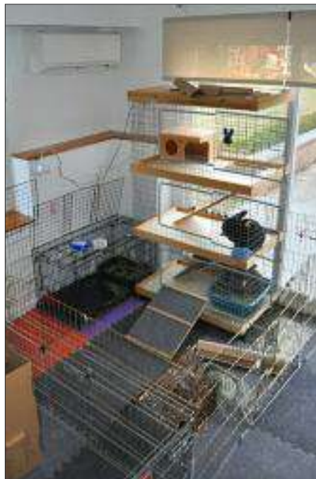
AC/heat unit mounted at the top.

room year-round. This system is more energy-efficient than central A/C and would ensure that none of the air circulated in the rest of the house would contain allergens from the bunny room. We got rid of the existing baseboard heaters because we knew that bunnies would like to play wherever there were small gaps. It is also a prime location for