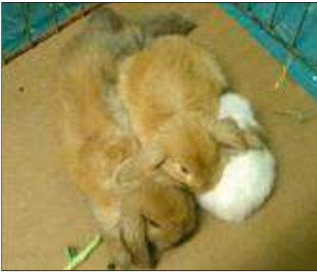
Candy, right, with siblings.