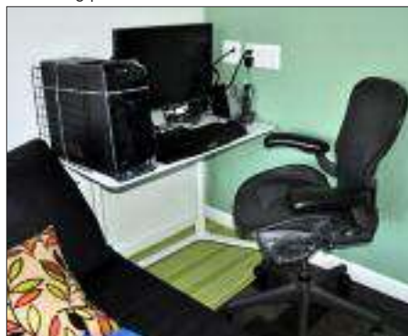
Computer setup with network cable and electrical wires 36" above the floor. Nothing dangling underneath the table!

for the bunnies to run under and use as hiding space. So far, my bunnies have enjoyed having private bunny-only meetings there as much as they enjoy racing around the rest of the room.